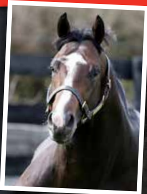
NZ's Leading 2nd Crop Sire Sire of 2016 Karaka 3YO Mile-winner