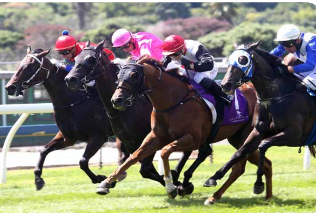
Chancery (middle) breaks his maiden status in style at Ellerslie