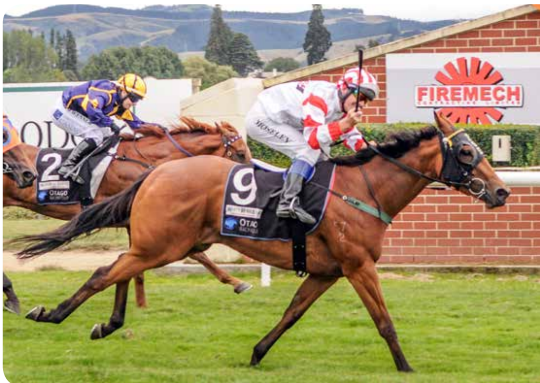
Bargain buy Honor That scores handsomely at Wingatui

"I told him I had bought her for four grand so he told me he would like to buy a share in her as he had raced one that was 17 hands high and wanted to race one that was about half that size. We had a good laugh but I did tell him that even though she was only a tick over 14 hands she had a pretty good motor under the hood."