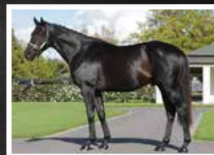
FERLAX G1 Aus Guineas Winner First Foals Impressing