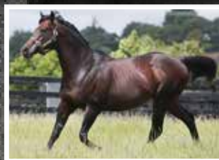
IFFRAAJ NZ's Leading 2YO Sire Sire of 2016 Karaka Million-winner