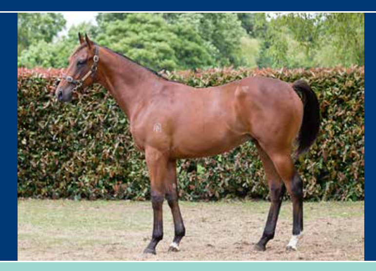
Lot 595: Jimmy Choux-Spin Align Colt SOLD $100,000 Buyer: Paul Moroney Bloodstock