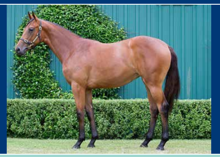
Lot 64: Jimmy Choux- Shaheen Filly SOLD $210,000 Buyer: Michael Otto Bloodstock

An $89,324 Select average made Jimmy Choux the Leading Sire by Average for those sires selling 12 or more yearlings.