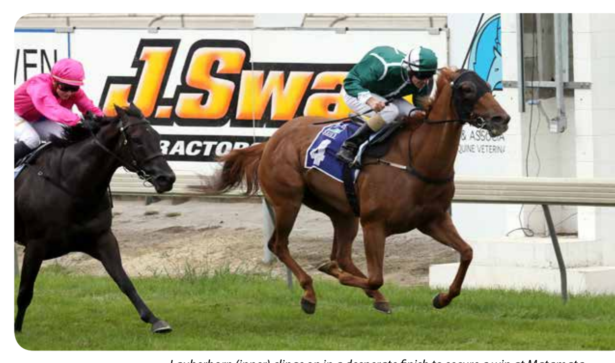
Lauberhorn (inner) clings on in a desperate finish to secure a win at Matamata

year and just seems to thrive on the whole stable environment as she has got better and better as we've gone along."