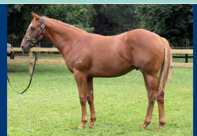
Lot 837: Jimmy Choux-Diva von Tessa Colt SOLD $210,000 Buyer: Big Red Farm (Japan)