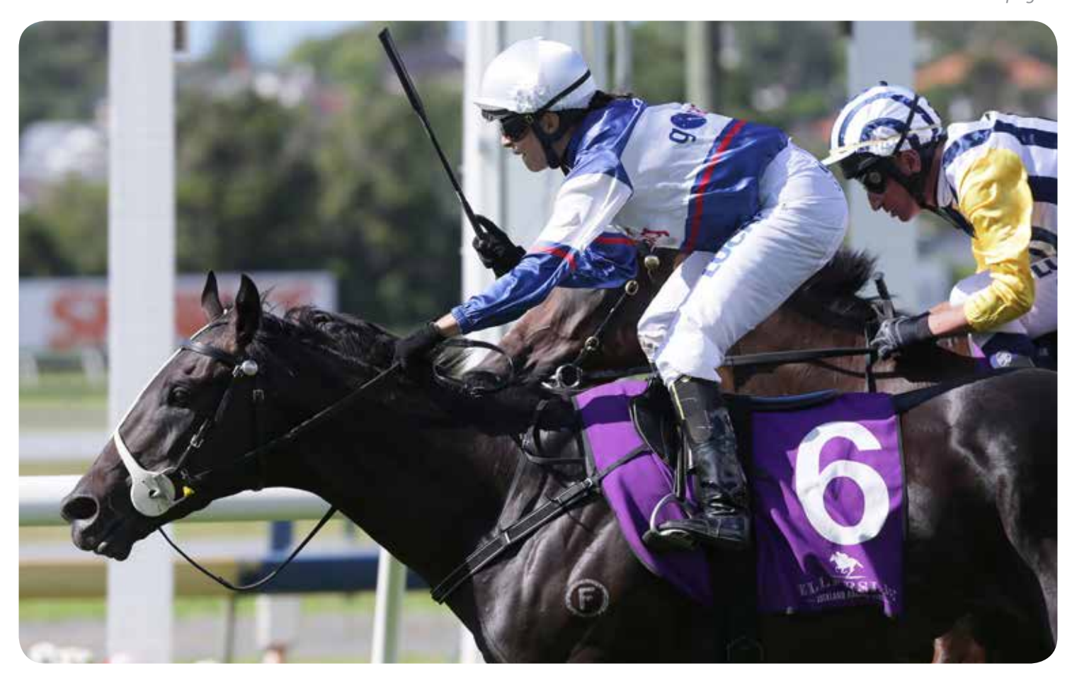
A remarkable performance on the weekend saw What's The Story grab his place in the Gr. 1 New Zealand Derby in a fortnight