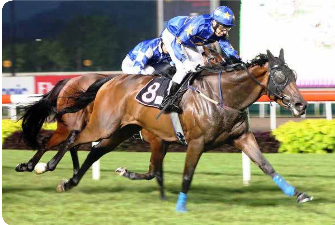
Lim's Affection scores emphatically at Kranji on Friday night.

"When I gave her a backhander at the 500, she went from three lengths behind to only a length-and-a-half behind," said the Australian jockey, who has been riding in a rich vein of