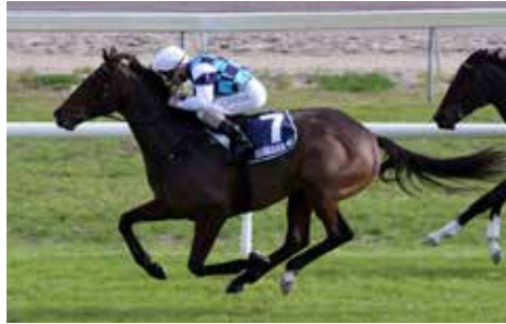
Hasselhoof (NZ) (Tavistock)

Guess What has won two of his last four starts with his latest success achieved with a game front-running performance in the Hamilton Cup at Te Rapa. Full story here.