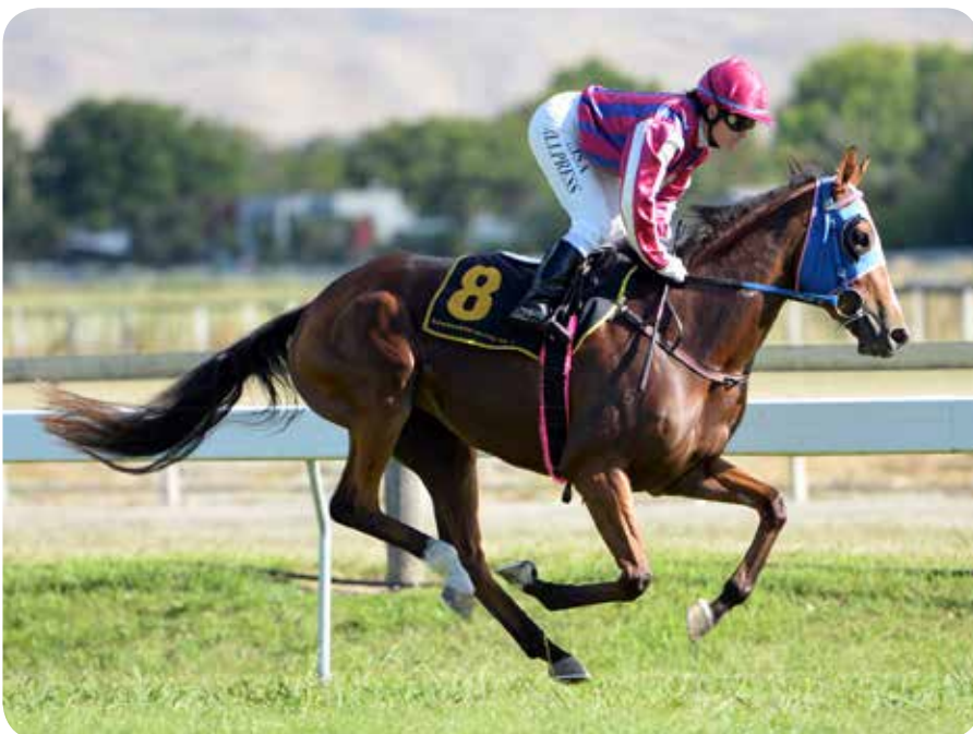
Dual Pearl Series Bonus winner Acquisto

Alternatively the NZTBA will be hosting a Pearl Series information open day in "The Gazebo" at the Matamata Breeders Stakes meeting on Saturday February 27th and would welcome any last minute nominations and enquiries.