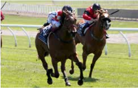
What Choux Want (NZ) (Jimmy Choux)