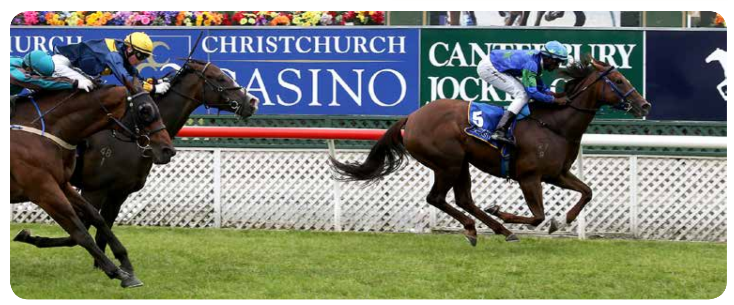
Headstrong mare Red Dirt Girl was at her brilliant best on the weekend