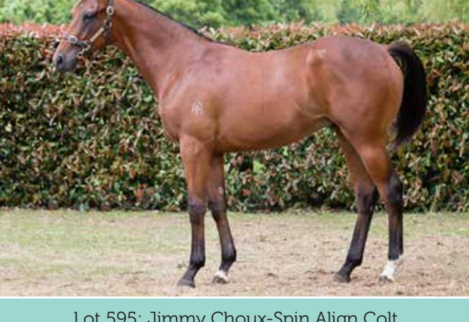
Lot 595: Jimmy Choux-Spin Align Colt SOLD $100,000 Buyer: Paul Moroney Bloodstock