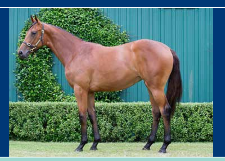
Lot 64: Jimmy Choux- Shaheen Filly SOLD $210,000 Buyer: Michael Otto Bloodstock

An $89,324 Select average made Jimmy Choux the Leading Sire by Average for those sires selling 12 or more yearlings.