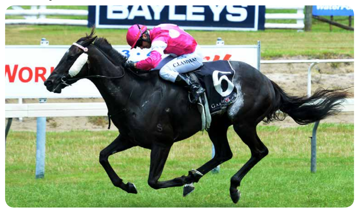
Pukekohe mare Somethingvain looks a leading prospect in the feature event at Tauherenikau today