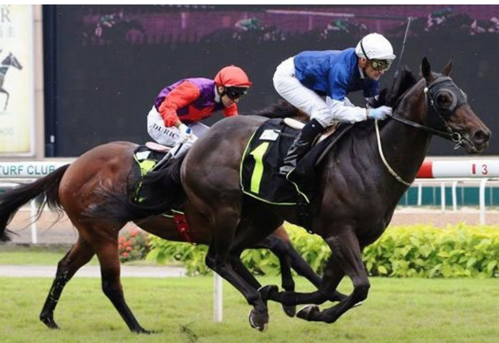
Magnum gets the better of Justice Day to win fresh-up at Kranji