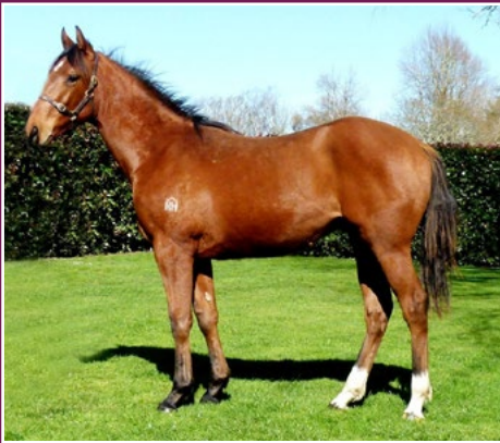
DUAL WINNING MARE