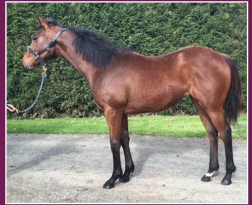
IN FOAL TO OCEAN PARK