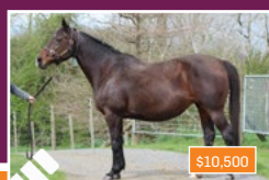
SOLD on gavelhouse.com