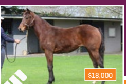
SOLD on gavelhouse.com

NEXT FORTNIGHTLY SALE ENTRIES CLOSE THIS MONDAY 25 SEPTEMBER AT 7PM ENTER ONLINE OR CONTACT THE TEAM TO DISCUSS YOUR OPTIONS ON 09 296 4436