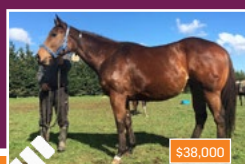
SOLD on gavelhouse.com

Last NZ sale results: 33 sold (80%) for over $140,000 worth of turnover.