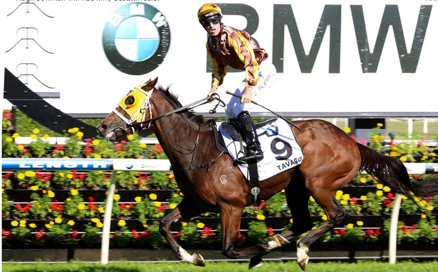
Tavago will have his next run in the Gr. 3 JRA Cup at Moonee Valley