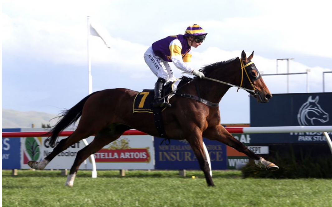
Impressive Hastings winner Nymph Monte will tackle the Gr. 1 Livamol Classic in a fortnight

"The way he won today would suggest he has to be in with a chance