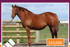
SOLD on gavelhouse.com