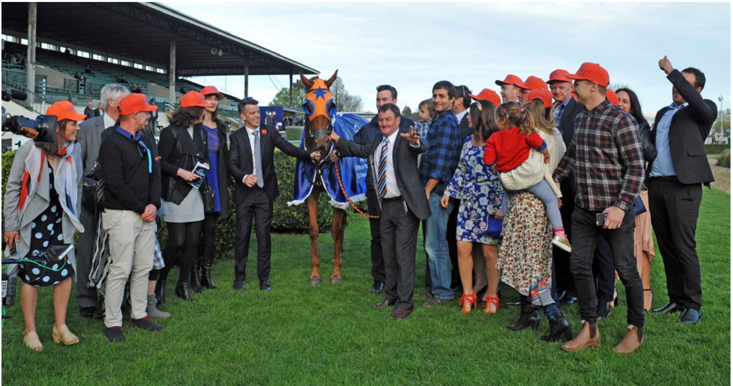
The familiar orange caps of the Gingernuts army are prominent during the victory ceremony for their pride and joy at Hastings on Saturday