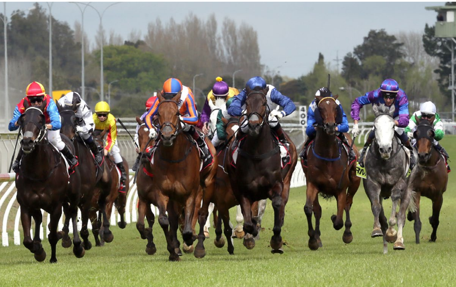
Chance To Dance in the tangerine and blue colours heads to the line to win on debut in New Zealand

Imported gelding Chance To Dance (Teofilo) made his raceday debut in New Zealand a winning one when he burst between runners to claim the Listed Haunui Farm Karaka Classic at Pukekohe.