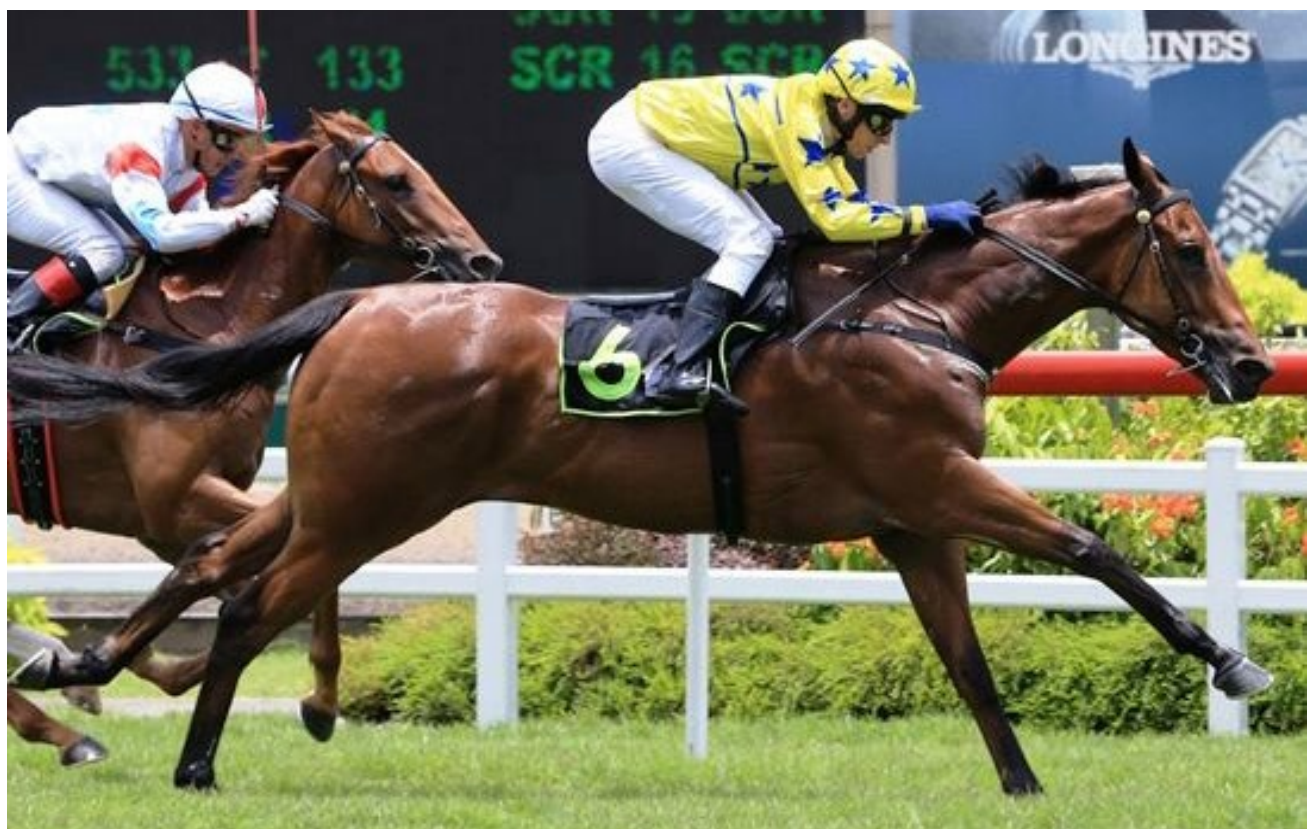
Late starter Noble Liaison scores at Kranji