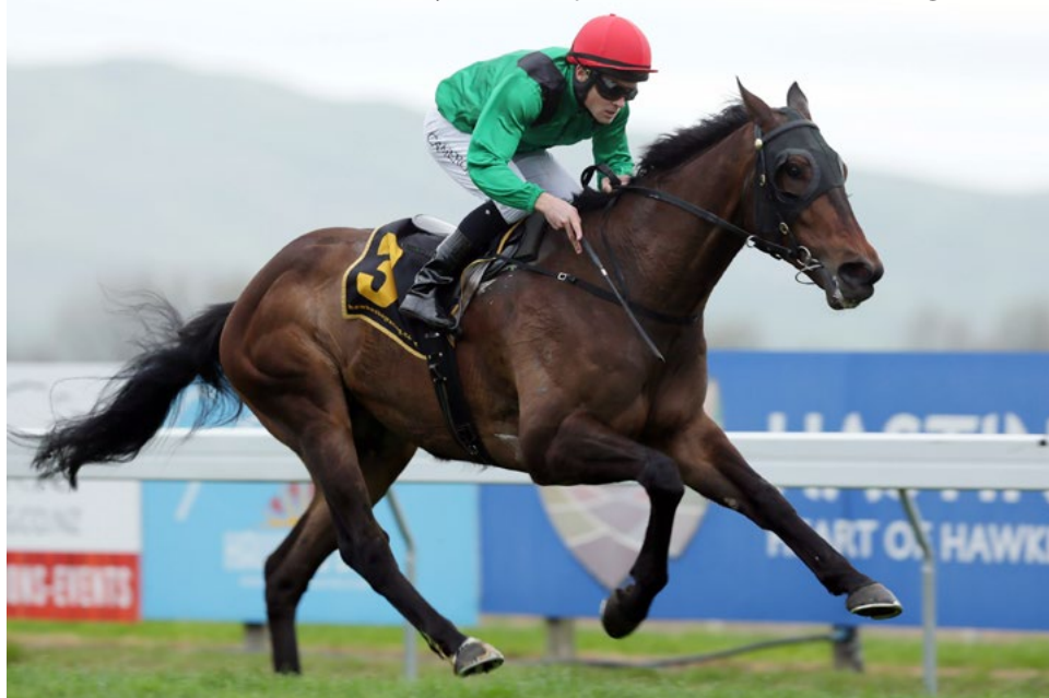
Get That Jive signals his return to racing in brilliant fashion