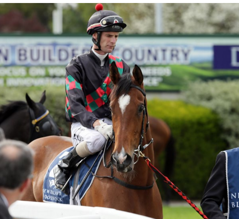
Volpe Veloce in the birdcage prior to her starting gate mishap at Hastings