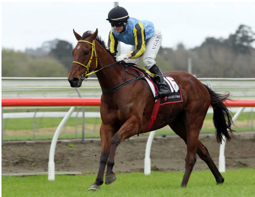
Admiral streets his rivals in Sunday's Listed Haunui Farm Karaka Classic

"He was coming back home as this is where he started off so he knows the place well.