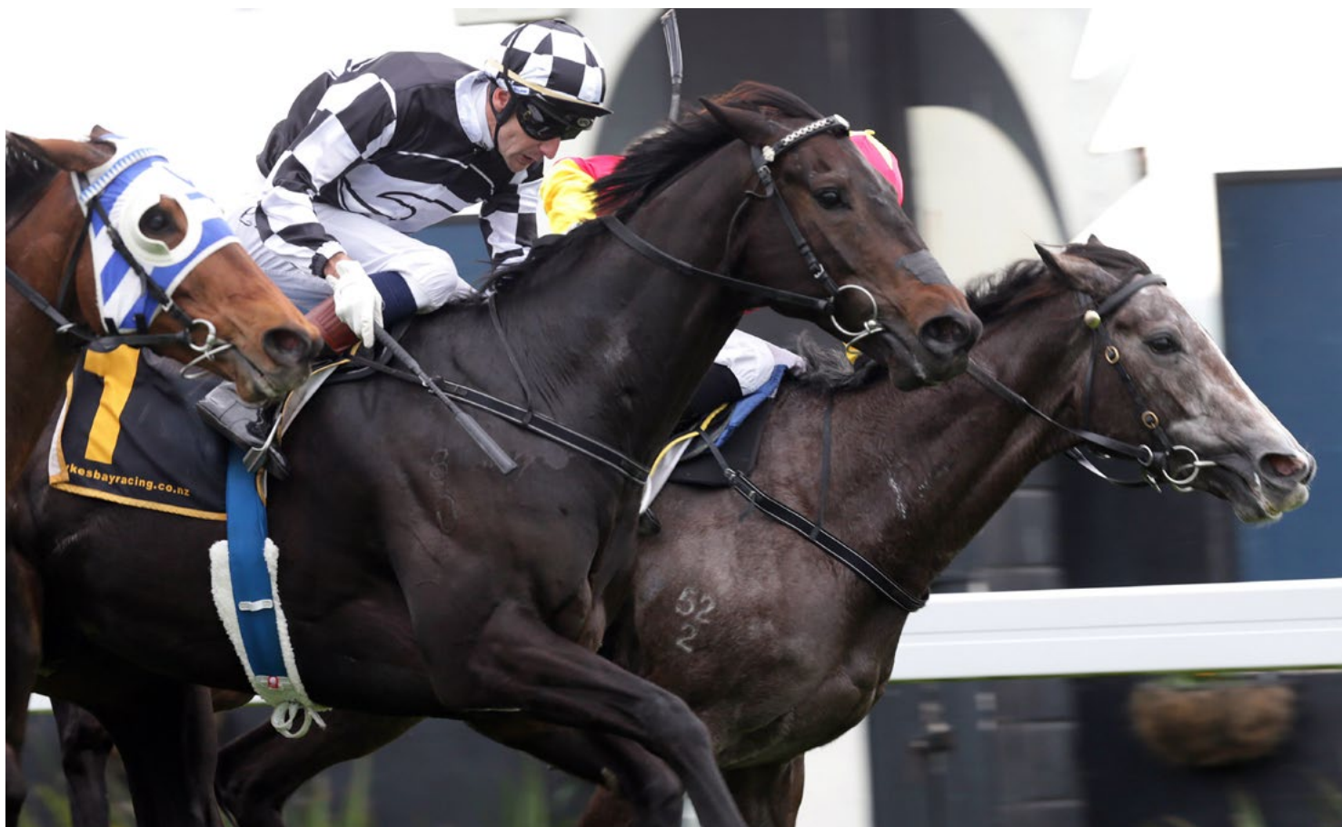
Smart kiwi galloper Kawi will forego an attempt at the Hastings triple crown for the riches of Perth