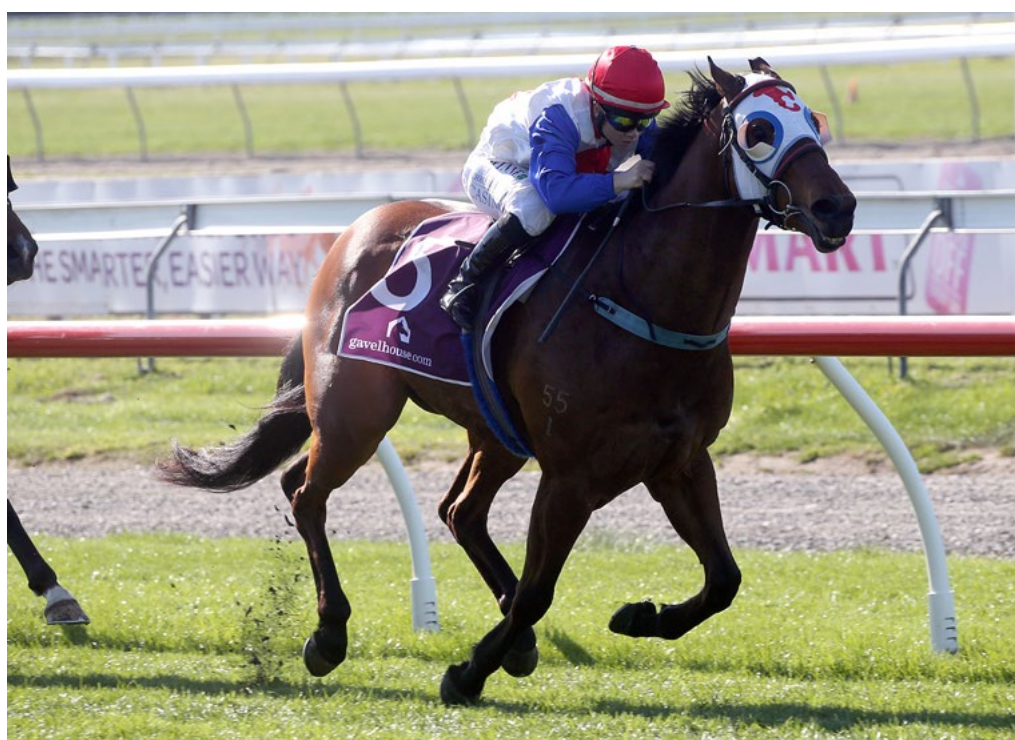
Kinagat stretches stylishly at Riccarton