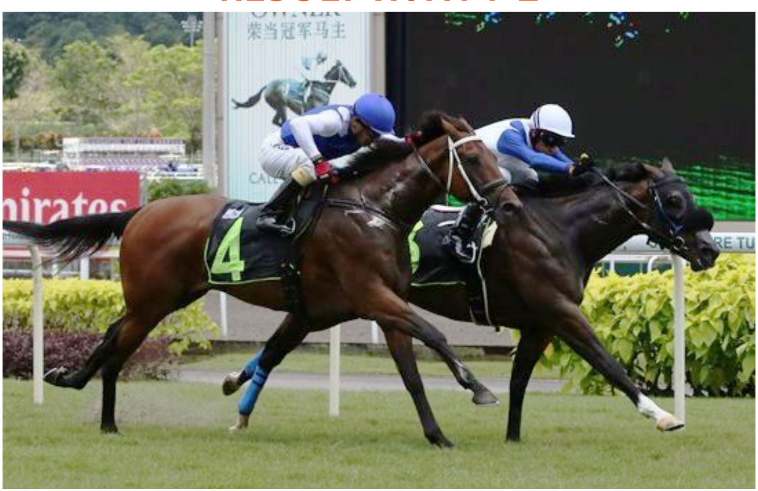
Ebraz holds out his stablemate Ateej at Kranji

wo debutants, Ebraz (NZ) (Burgundy) and Ateej (Equal Stripes), gave emerging outfit Al-Arabiya Stable the quinella in the second race on the Committee's Prize meeting at Kranji on Sunday.