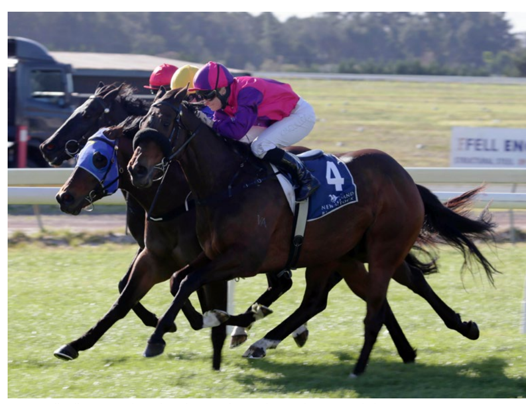
Biggin Hill collars Amarula and Statham to claim a deserved win at Ruakaka

There was an element of drama added to the final result with the Ruakaka protest siren sounding to indicate an inquiry against the winner after interference was alleged in the concluding stages. After deliberations by the judicial panel the charge was dismissed with no change to placings.