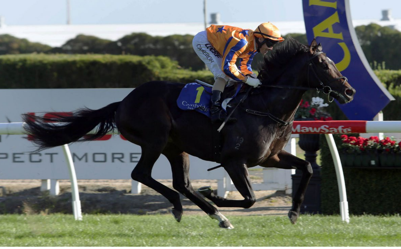
Kiwi colt Xtravagant has his connections searching for answers after a lacklustre showing at Flemington last weekend

e Akau Racing will continue to monitor Xtravagant (NZ) (Pentire) but have not found anything amiss in the 24 hours since his failure at Flemington.