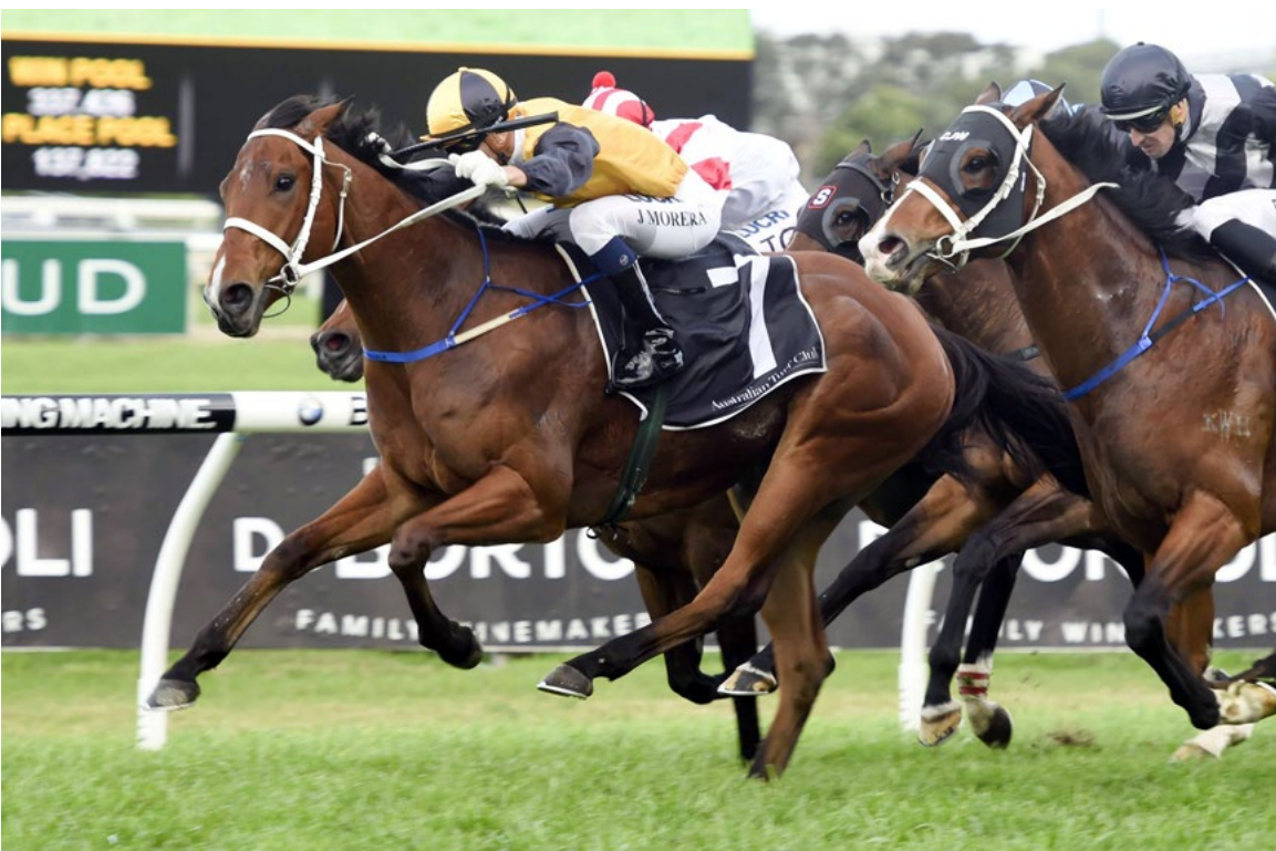
After bursting through a wall of horses, Mackintosh (#7) holds out the late charge of Counterattack to win the Theo Marks Stakes at Rosehill.