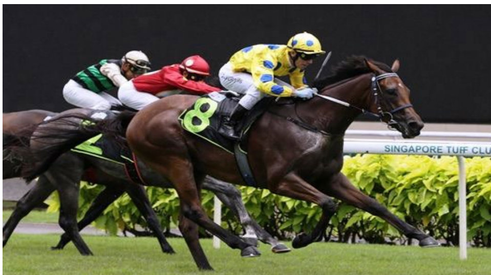
Mr Clint scores at Kranji to provide Lee Freedman with his first training success in Singapore