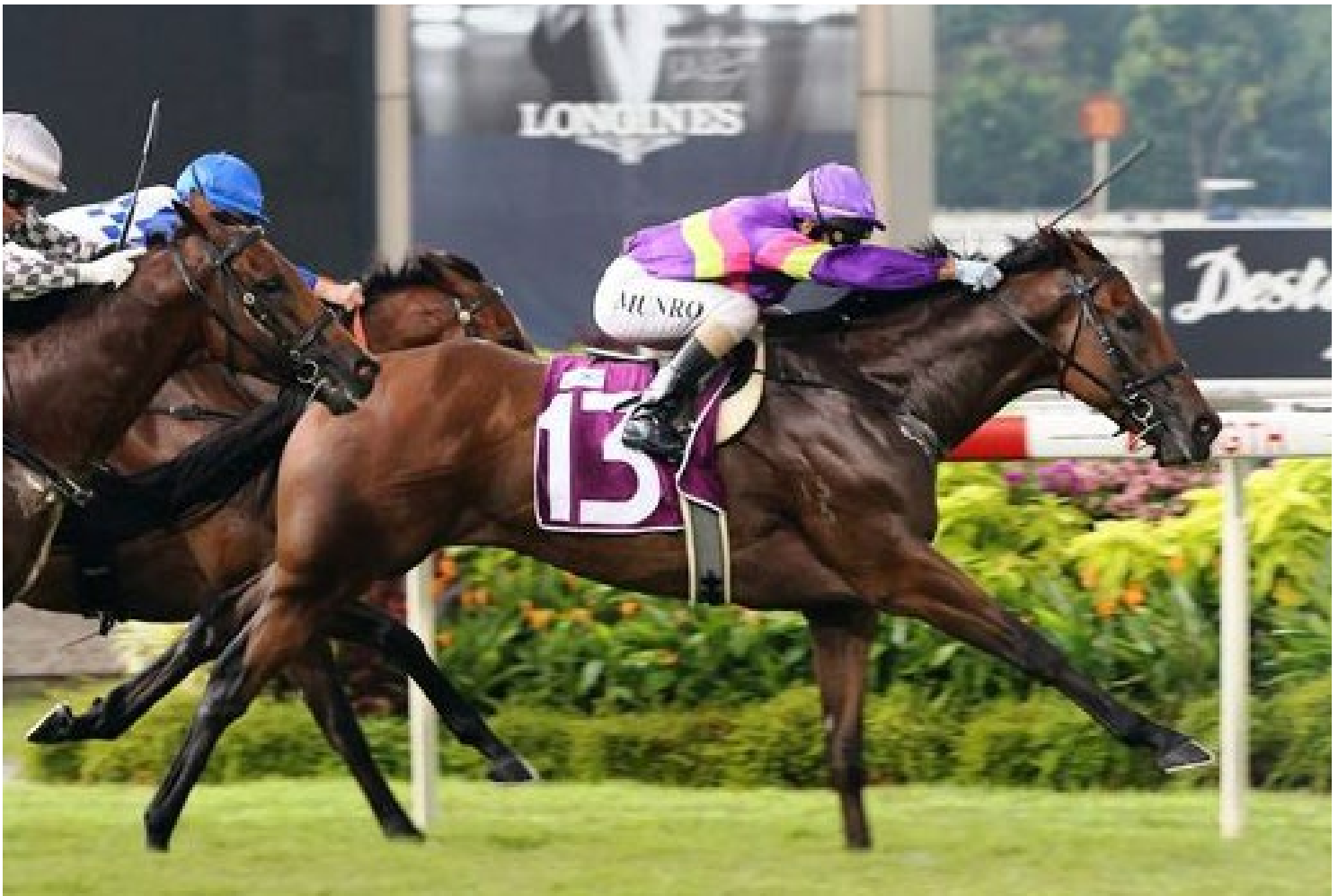
Countofmontecristo fights off his rivals to score handsomely at Kranji