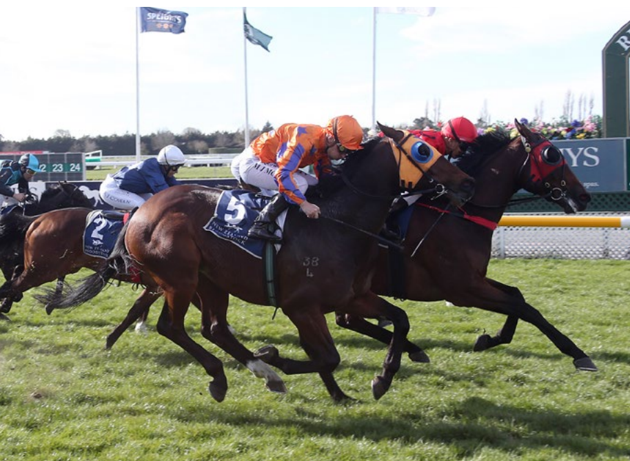
Greenpark Gem (red hood) gets in the deciding stride at Riccarton