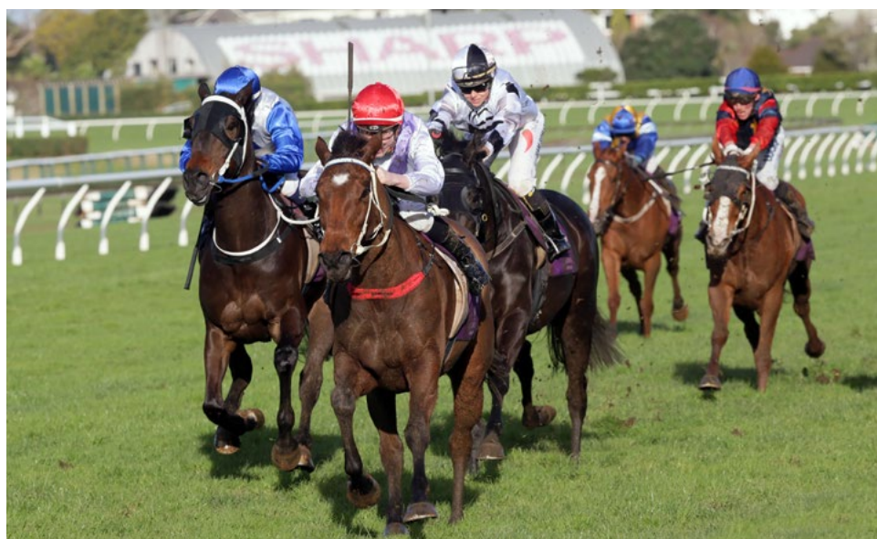
Gritty mare Philipa Charlotte proves toughest in the trying conditions at Ellerslie on the weekend