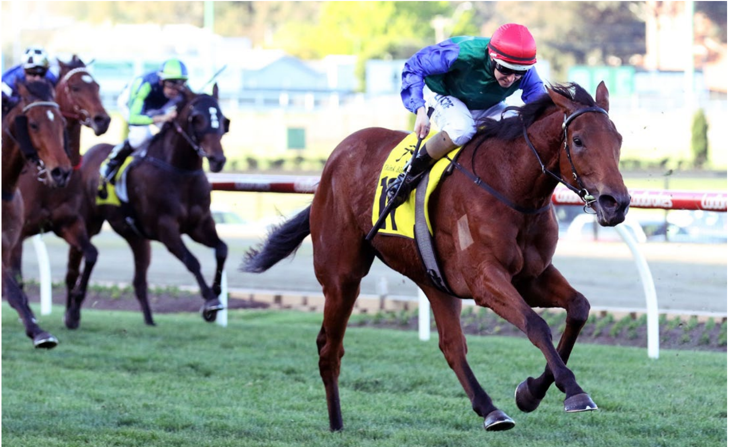
Bonneval streaks home at Moonee Valley