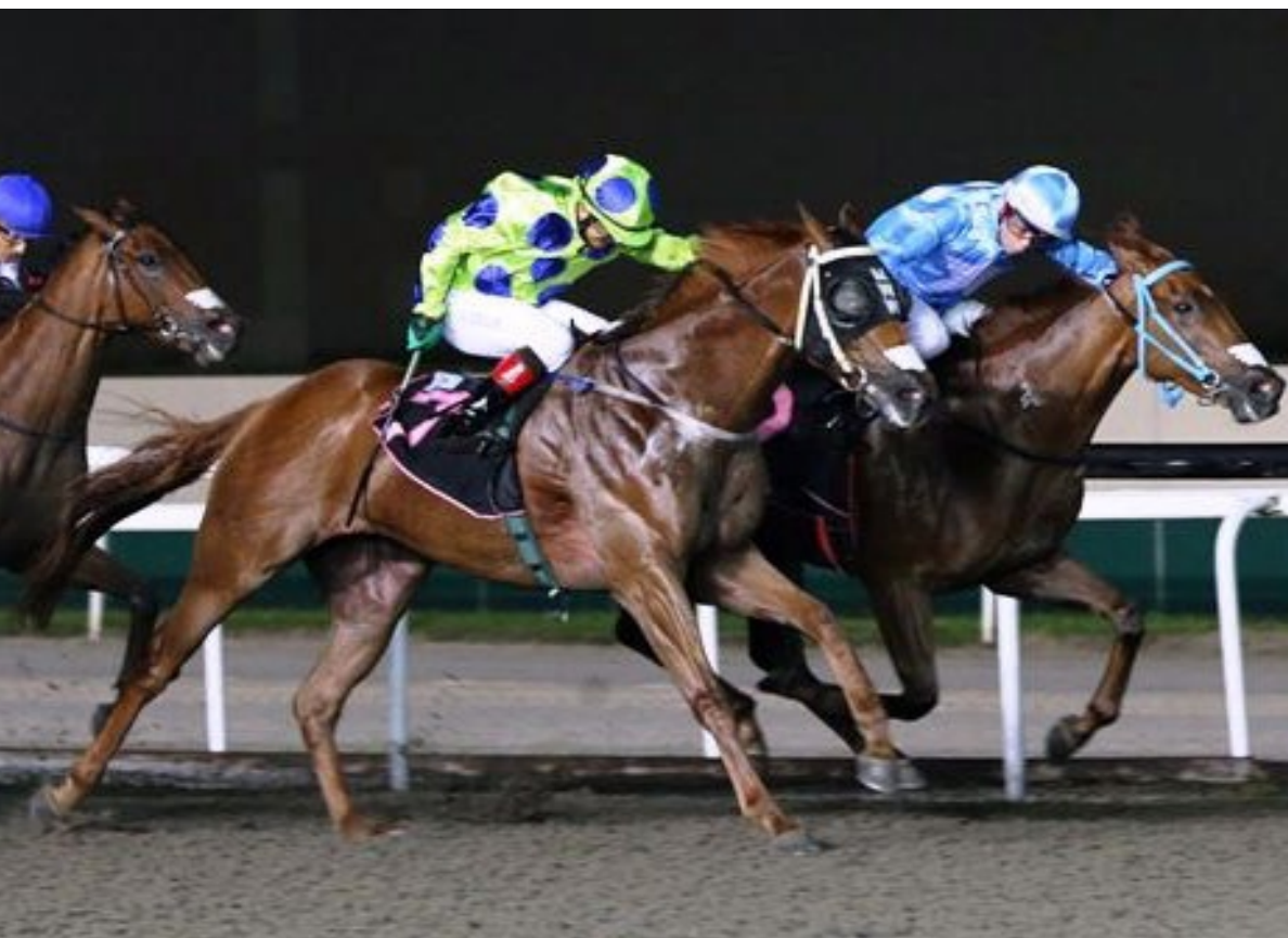
Grey Falcon (blue colours) outbobs Decreto at Kranji on Friday night.