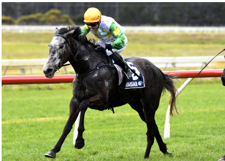
Danzdanzdance opens her season with a win at Ruakaka

which means there is no point trying to get another run into her before the Livamol.