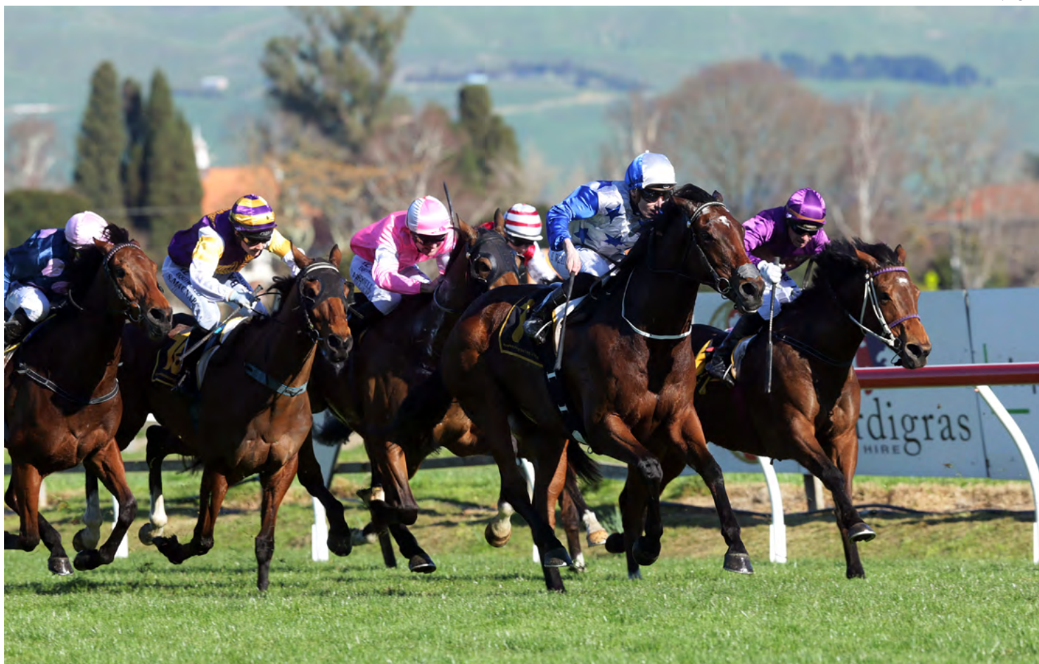
Charles Road powers home at Hastings to grab an eye-catching victory (Trish Dunell)