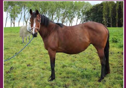
ZABEEL MARE IN FOAL TO SWISS ACE.