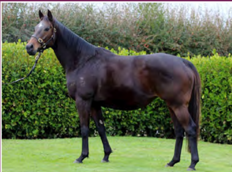
MEDAGLIA D'ORO MARE IN FOAL TO CHARM SPIRIT.

Youngsters, racing stock and broodmares with covering sires including Burgundy, Charm Spirit, Proisir, Redwood, Shamexpress, Swiss Ace and Tivaci plus a nomination to Rock 'N' Pop.