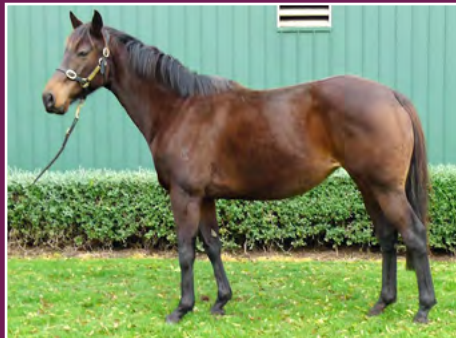
WINNER OF FIVE IN FOAL TO BURGUNDY.