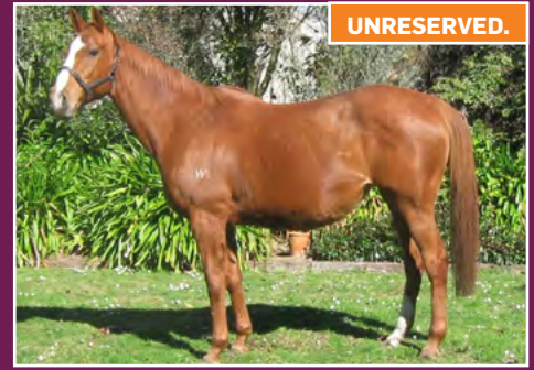
PINS MARE IN FOAL TO PROISIR. DAM OF TWO WINNERS.