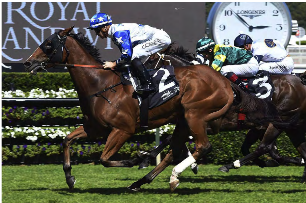
Crack Me Up in winning action