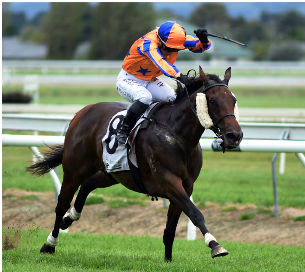
Champion two-year-old Avantage winning the Gr.1 Manawatu Sires Produce Stakes

"He's had a trial and a gallop, and we might even give him another gallop somewhere just to have him hard and