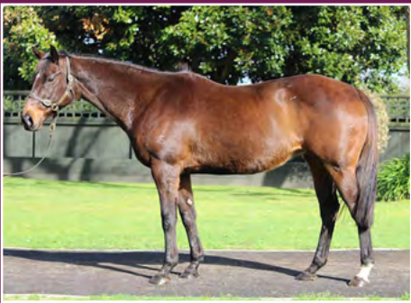
IN FOAL TO CHAMPION FIRST SEASON SIRE SHAMEXPRESS.