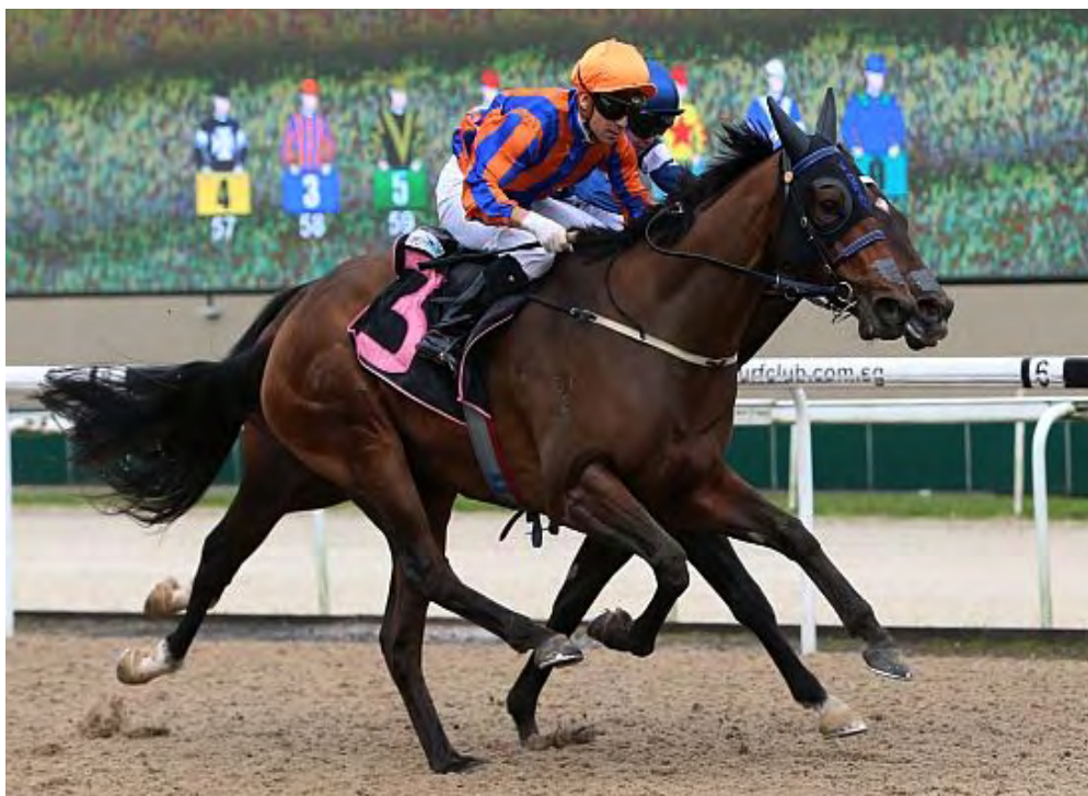
Sky Rocket outfinishes the opposition to score a gritty fresh-up victory.