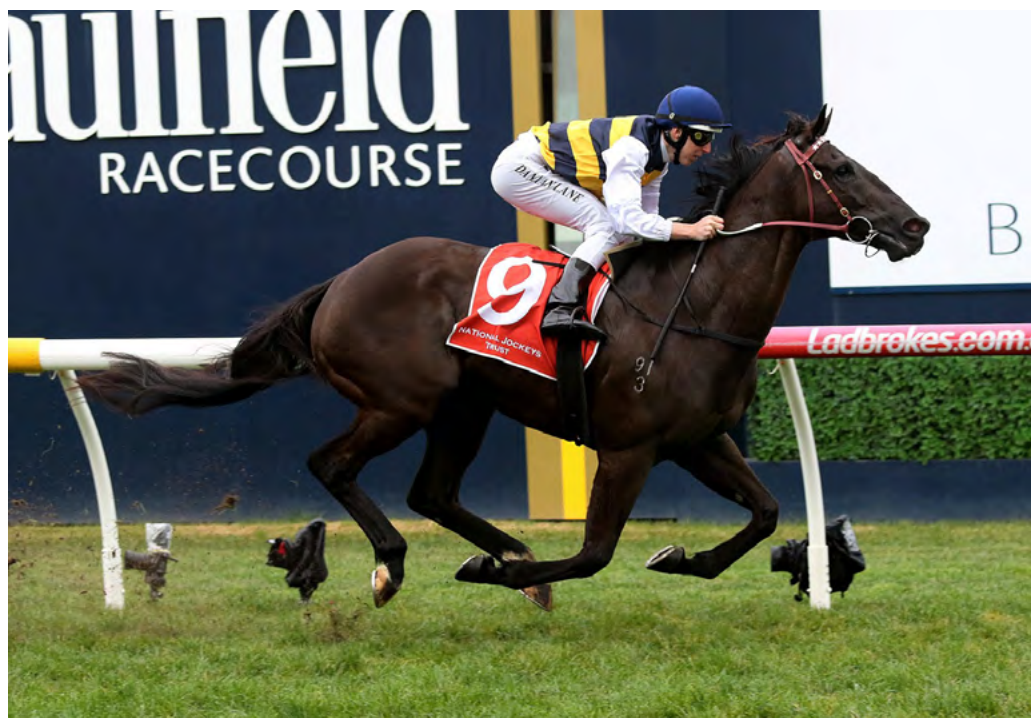
Saturday's impressive Caulfield winner Night's Watch could be headed to the Caulfield Cup next month

"The plan is to hopefully get him to a Caulfield Cup, there's a long way to go to get to a race like that, he has to qualify, so it's an interesting few weeks