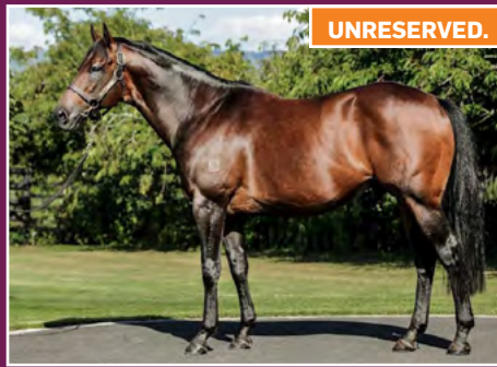
NOMINATION TO GR.1 WINNING SON OF FASTNET ROCK, ROCK 'N' POP.