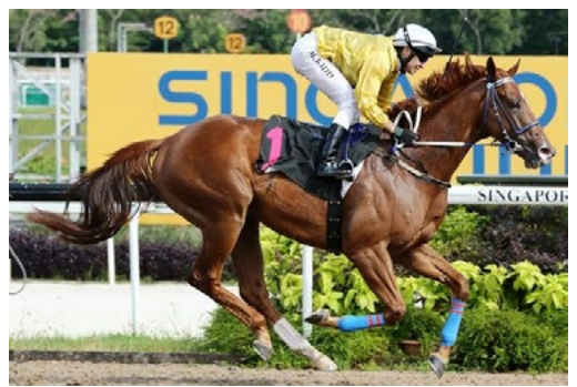
Huka Falls (NZ) (Align)

The Align seven-year-old last ran in the Kranji Stakes A race over 1200m last Sunday, running out of the placings for Glen Boss and unfortunately bled upon pulling up.