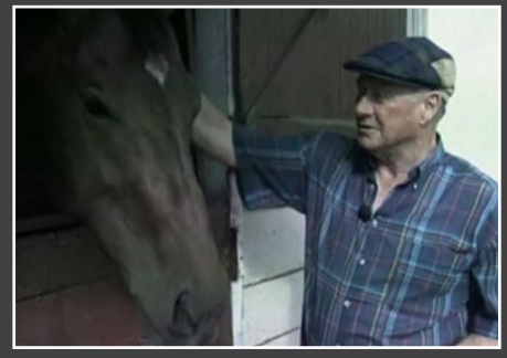
CLICK TO PLAY

Associated with many memorable horses, some of his best performers included Uncle Remus, McGinty and The Phantom Chance,