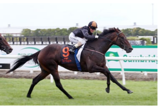
Valley Girl (NZ) (Mastercraftsman)