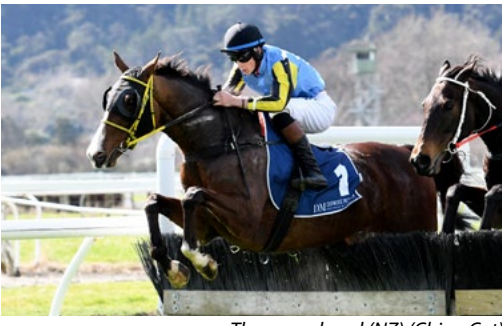
Thenamesbond (NZ) (China Cat)

The winner of the Northern in 2014 and third 12 months ago, Amanood Lad has mixed his form this time around. Full story here.