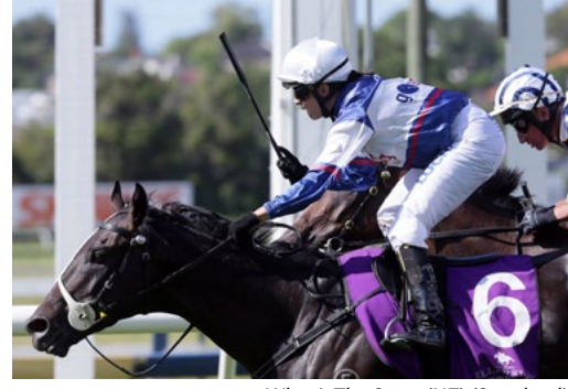
What's The Story (NZ) (Savabeel)

The Group One performer, who was laid low by a blood infection, furthered his