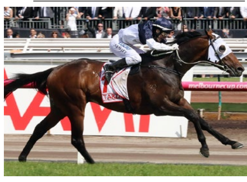
Tarzino (NZ) (Tavistock)

Saturday with the last-start winner Thenamesbond (NZ) (China Cat) in the Schweppes Great Northern Hurdles and he will also partner Old Redfeather (NZ) (Generous) in the Meadow Fresh Great Northern Steeplechase. <u>Full story here.</u>