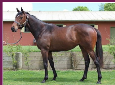
2yo filly by O'Reilly.

OCTOBER AUCTION • Bidding from 7pm Monday 31 October to close of auction on Thursday 3 November • Lots close in sequential order from 7pm on Thursday 3 November