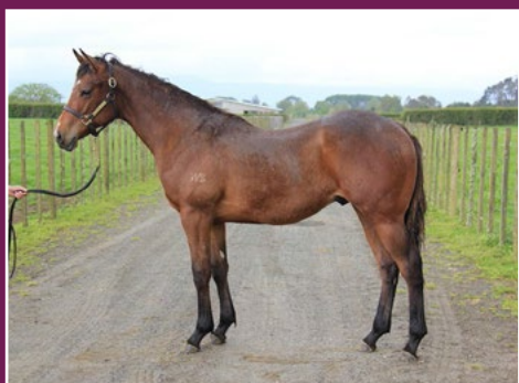
Ocean Park colt.

Yearlings, two year olds, racehorses and breeding stock including: