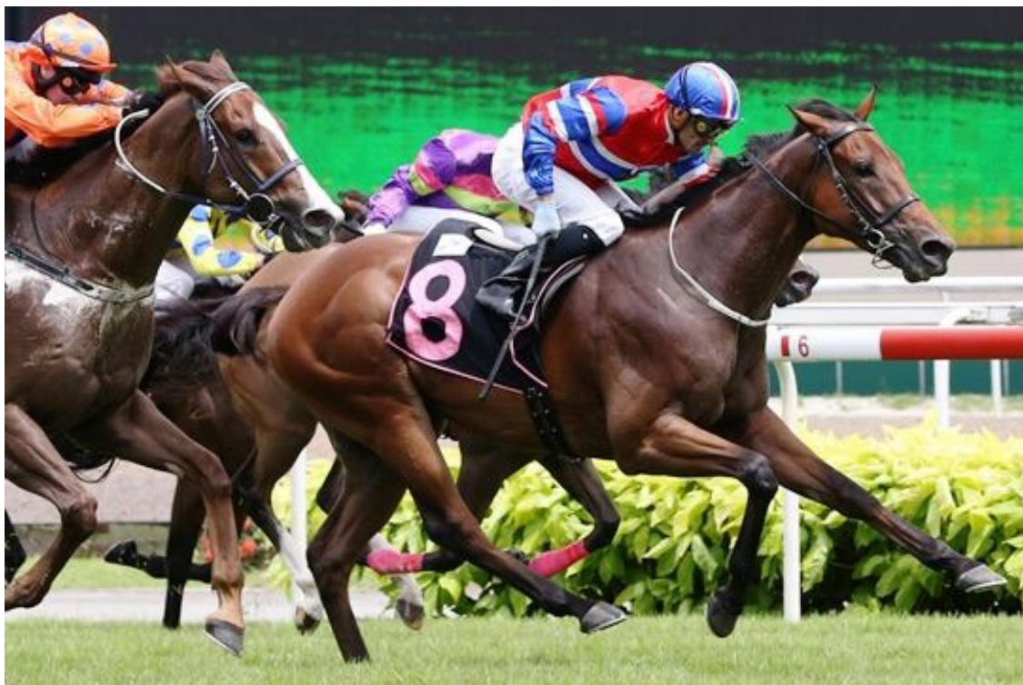
Golden Peninsula breaks his maiden status at Kranji