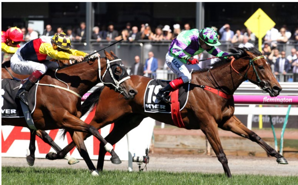
Three-year-old filly I Am A Star captures the Gr. 1 Myers Stakes at Flemington