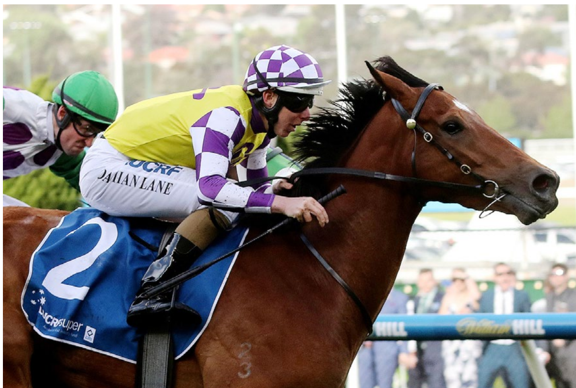
Sacred Elixir did his connections proud in Saturday's Gr. 1 VRC Derby