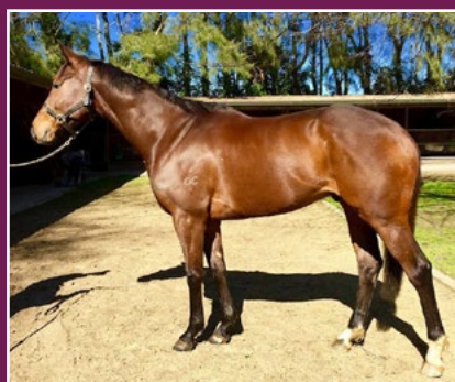
Alamosa trial winner.