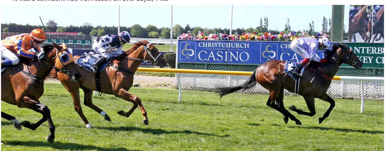
Ever Loyal stakes his Two Thousand Guineas claim with a decisive win over Scott Base (blue and white colours) and Swing Note in the Zacinto Stakes.