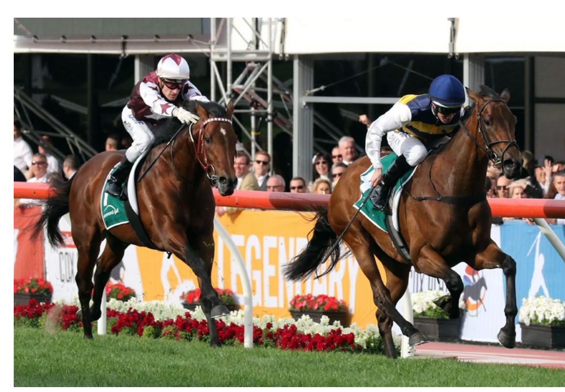
Aloisia scoots away from VRC Derby second fancy Cliff's Edge and into odds-on favouritism for the Oaks in yesterday's three-year-old staying test at Moonee Valley.