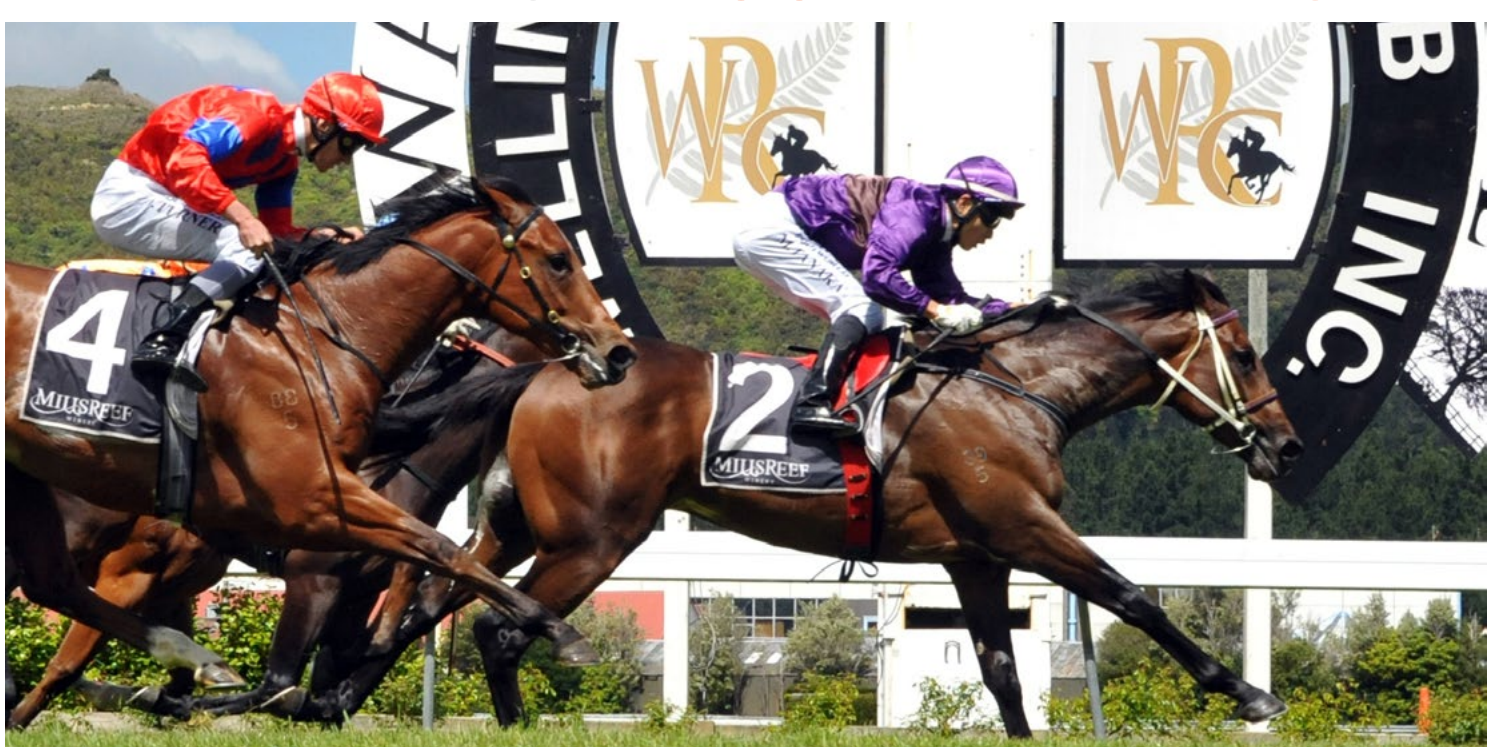
A titanic home straight battle ends with Sir Nate edging away from King Louis (#4) and Masque to win the Wellesley Stakes.

nbeaten youngster Sir Nate (NZ) (Nadeem) has earned himself a break ahead of his major summer target, the two-year-old set to enjoy time off following yesterday's spirited performance at Trentham to claim the Listed Anuka Smoker Wellesley Stakes.