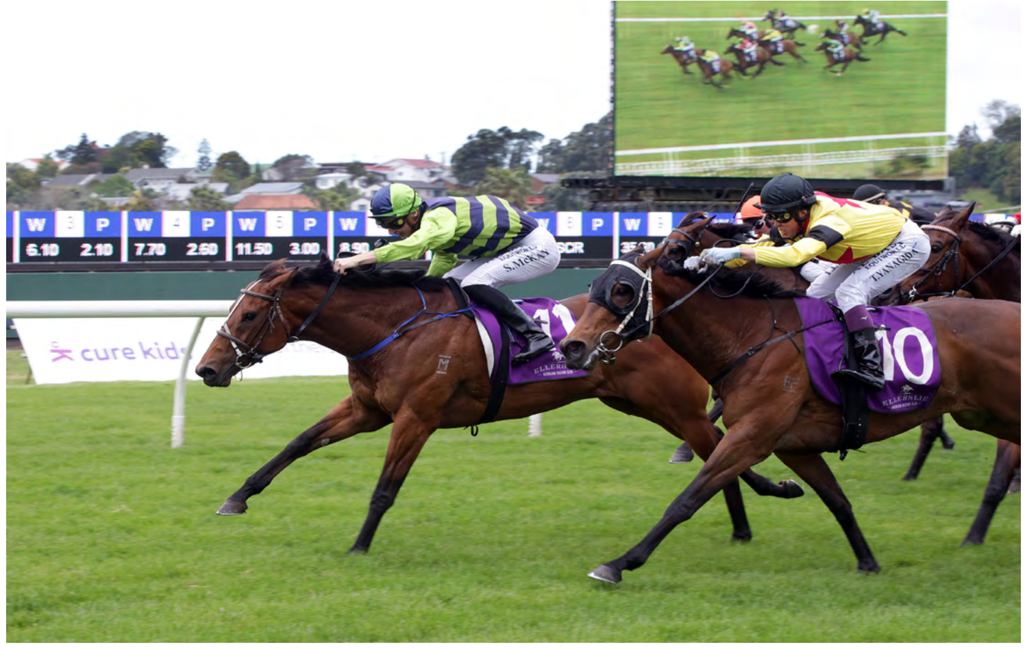
Yearn stretches impressively to claim victory at Ellerslie (Trish Dunell)