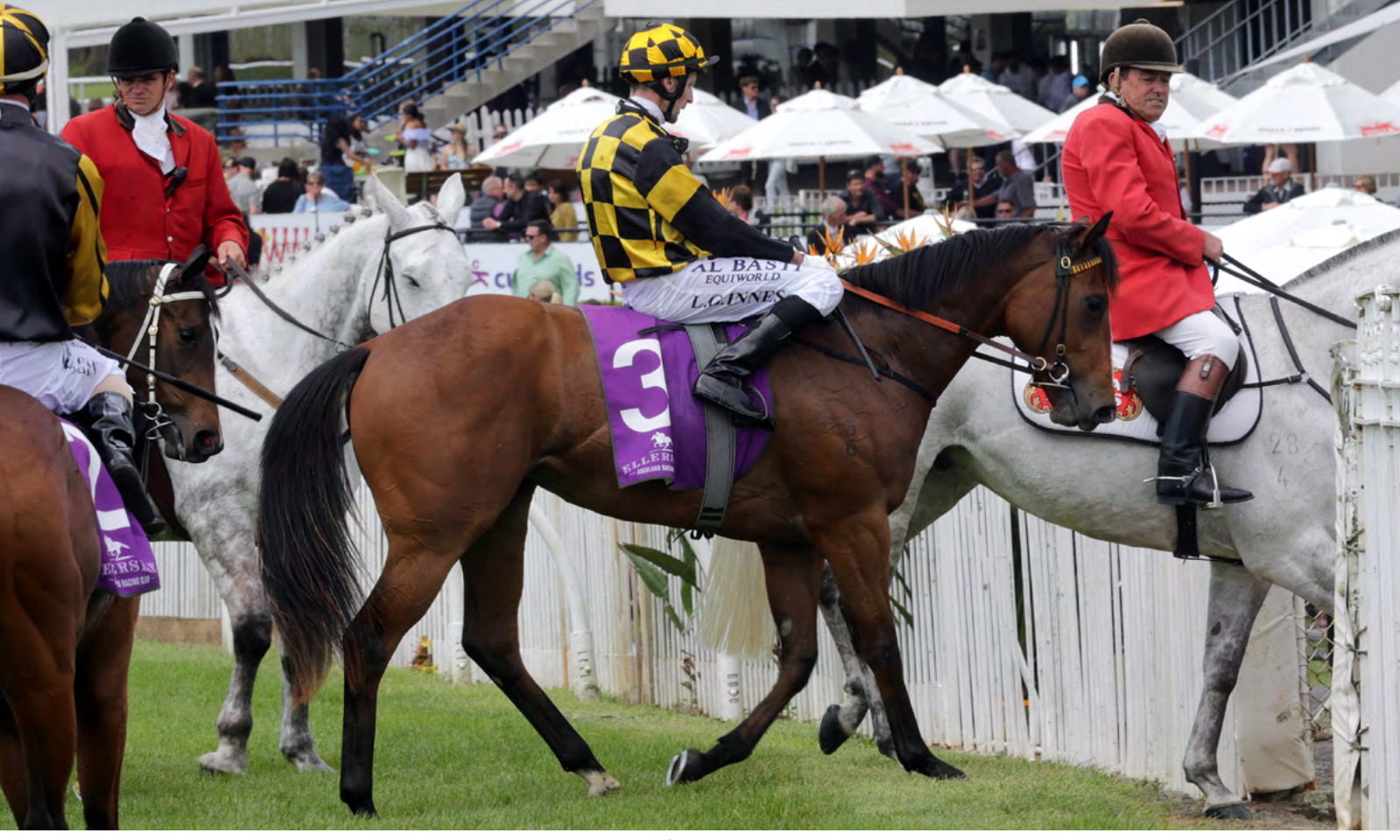
Speedy two-year-old Bavella returns to the winners enclosure at Ellerslie after a debut victory