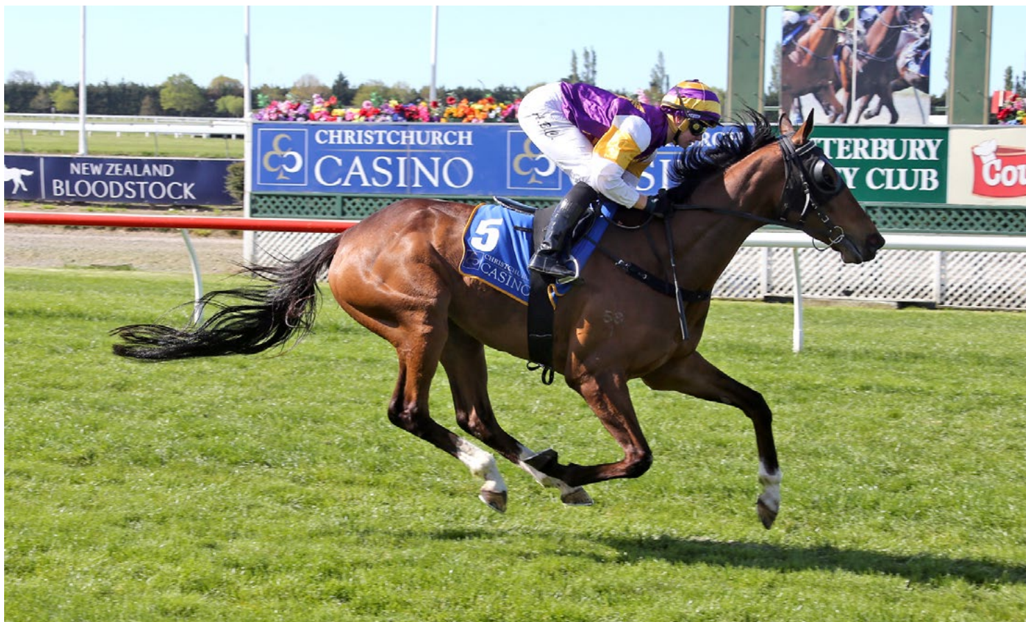
Nymph Monte powers clear for a comfortable Riccarton win on the weekend