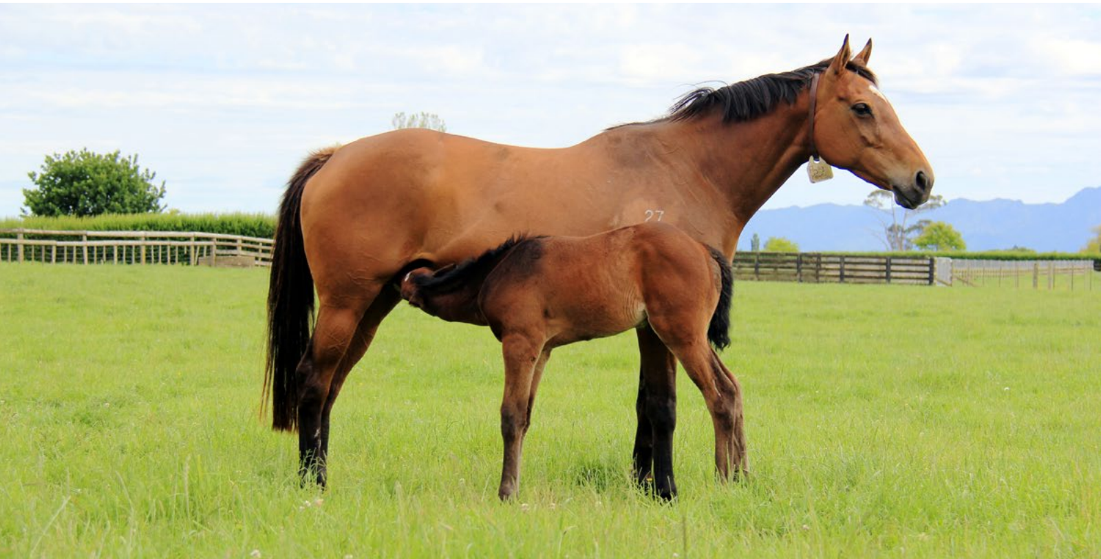
Flying Monty with Nurse Kitchen at foot

If Saturday's ultra impressive Moonee Valley winner Nurse Kitchen (NZ) (Savabeel) is even half as tough as her mum Flying Monty (NZ) (Montjeu) then the Savabeel filly is in for one hell of a career.