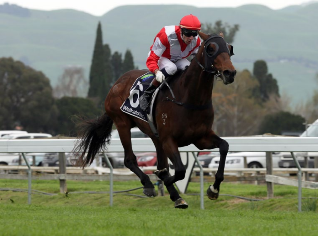
Mongolian Falcon in full flight at Hastings