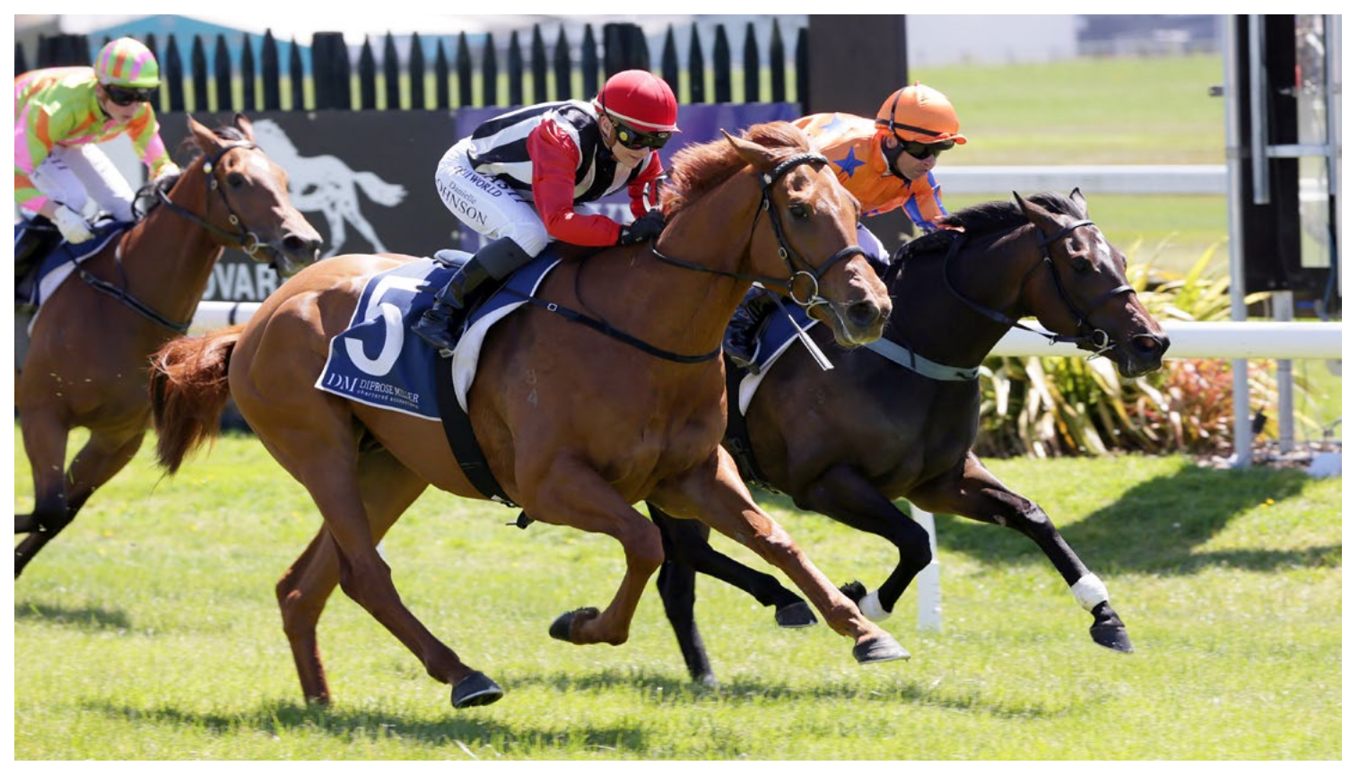
Civilised quits maidens with a strong-finishing win against better-performed rivals in the three-year-old sprint at Rotorua.

late decision to send Civilised ( NZ ) (Civics) to Rotorua had its reward yesterday when he upset a handy field of age-group gallopers.