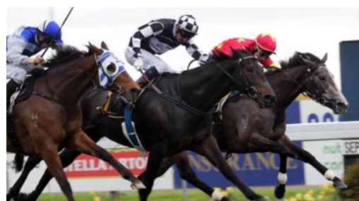
Kawi (NZ) (Savabeel)

Maraini's sibling Hasselhoof (NZ) (Tavistock), himself a debut winner, hasn't raced since he finished third in the Gr.1 Livamol Classic. His long-term aim is the Gr.1 Barfoot & Thompson Auckland Cup on March 11.