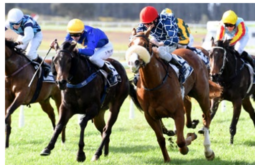
Barcelo (NZ) (Alamosa)