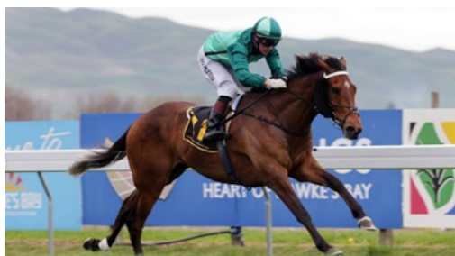
Humidor (NZ) (Teofilo)

Ellerslie the same day and Midnight Gossip (NZ) (Showcasing) looks to enhance her Gr.1 gavelhouse.com 1000 Guineas prospects at Riccarton. Full story here.