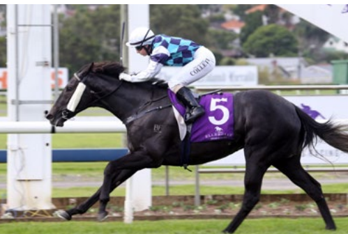
Astara (NZ) (Dalghar)