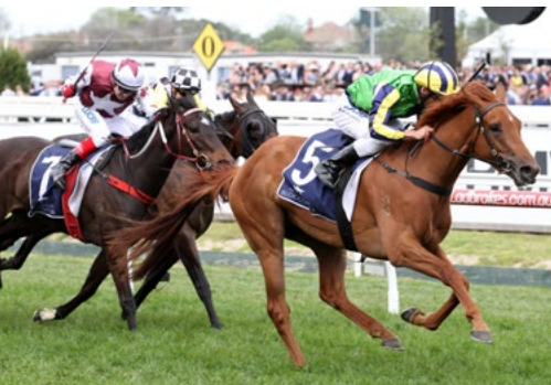
Eleonora (NZ) (Makfi)