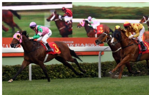
Aerovelocity (NZ) (Pins)

Trent Busuttin and Natalie Young will be represented by their Cape Blanco filly Ceylon (NZ) who is coming off an impressive last start maiden win at Cranbourne.