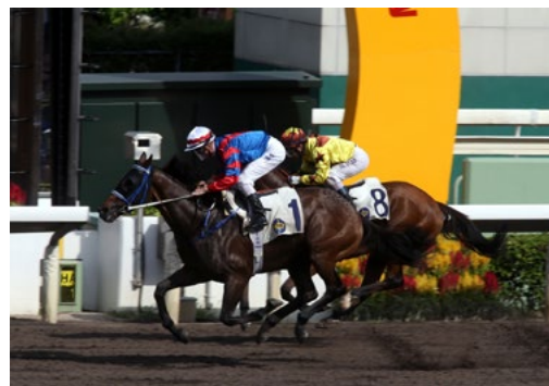
Gun Pit (Dubawi)

Her assignment is the Gr.3 Hong Kong Jockey Club Stakes, formerly the Maybe Mahal, over 1400 metres.