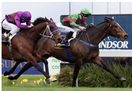
King Oberon (NZ) (Savabeel)