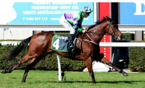
I Am A Star (NZ) (I Am Invincible)

"He hit the line well and had a wee puff which was perfect," he said. "He's going well and has improved nicely from his first run over here."