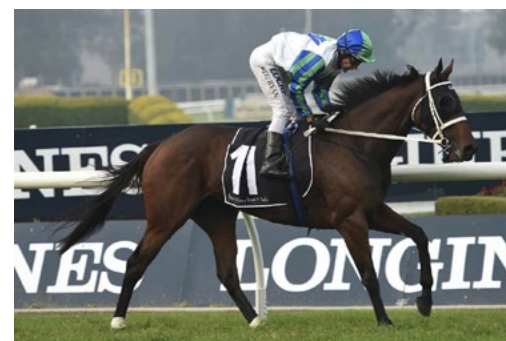
Lady Le Fay (NZ) (Thorn Park)

"The race on Monday will tell us whether we're going to Christchurch – he doesn't have to win, he just has to run well and he does seem bright and happy to me."