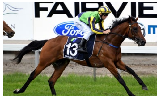
Maraini (NZ) (Exceed And Excel)

"He's going really well and we're happy with his condition."