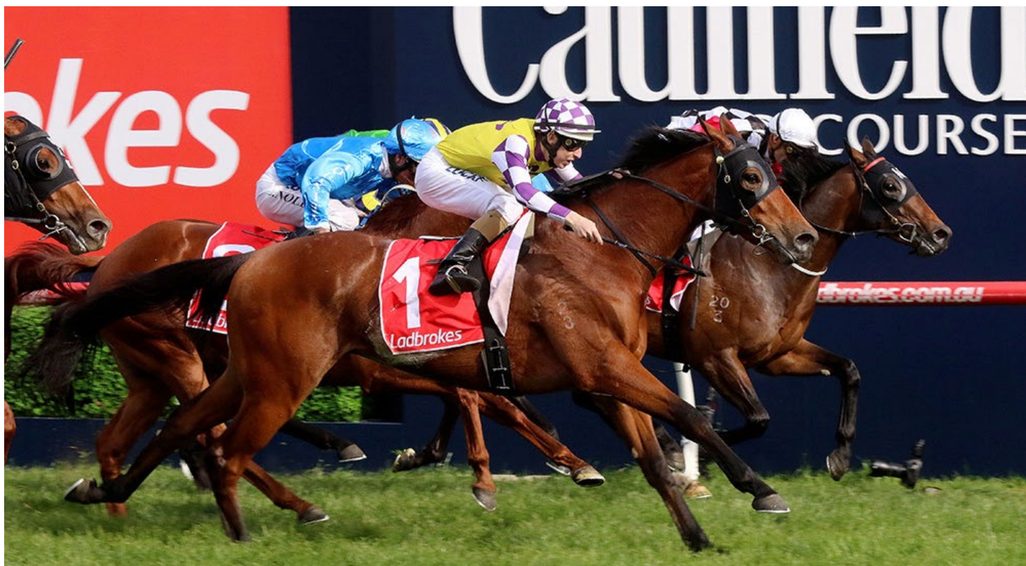
Sacred Elixir will have the blinkers off when he lines up at Moonee Valley on Saturday