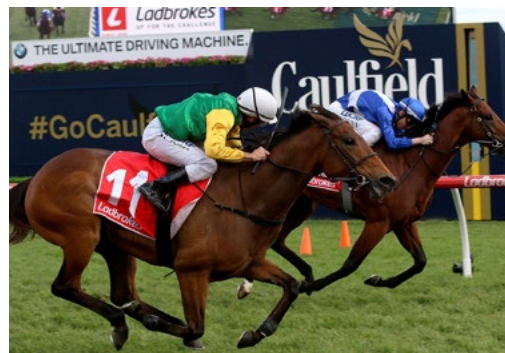
Shillelagh (NZ) (Savabeel)

Shillelagh's (NZ) (Savabeel) camp are counting themselves lucky that the mare didn't suffer any major injury when she was stopped in her tracks at Caulfield.