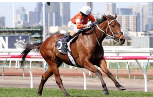
Who Shot Thebarman (NZ) (Yamanin Vital)