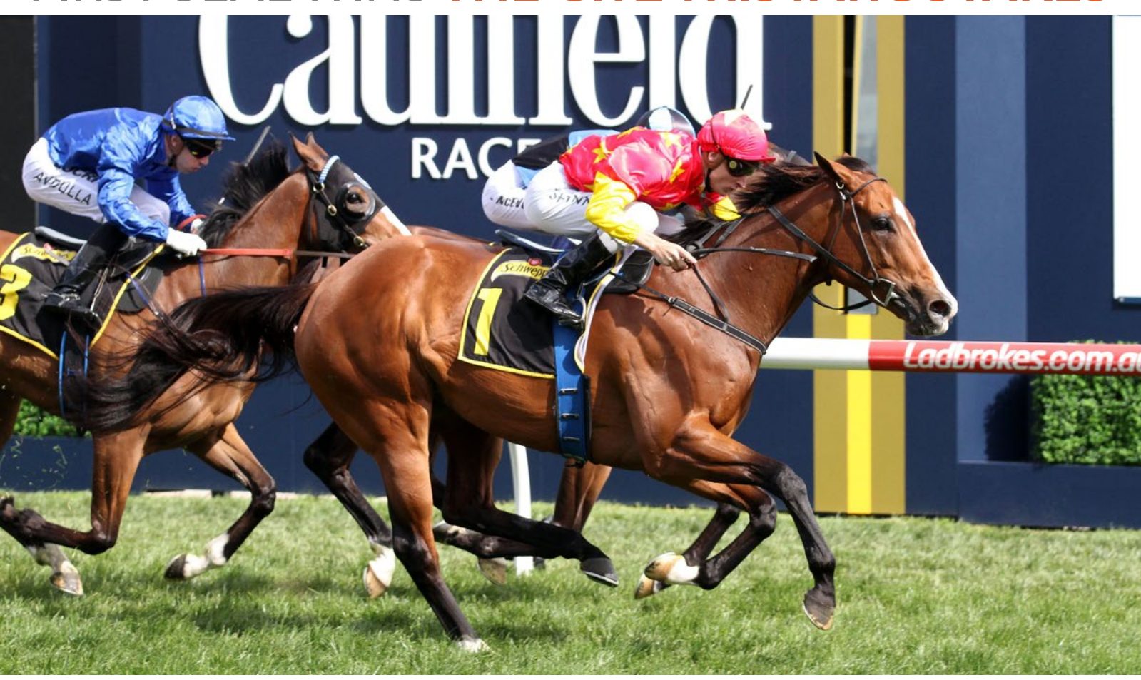
Karaka sale graduate First Seal captures the Gr. 2 Tristarc Stakes at Caulfield.

roup One winner First Seal (Fastnet Rock) has shown her class in her Melbourne debut, delivering a special win for her connections in the Gr. 2 Tristarc Stakes at Caulfield.