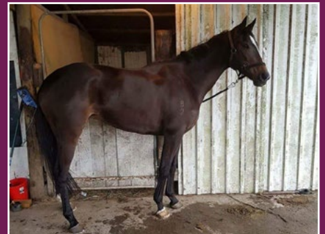
WELL-RELATED PENTIRE MARE

NEXT NZ AUCTION DATES • Listings close 7pm Monday 23 October • Catalogue published online 5pm Tuesday 24 October • Bidding from 5pm Tuesday to close of auction on Monday 30 October at 7pm •