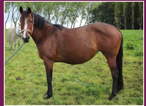
ZABEEL MARE IN FOAL TO EL HERMANO