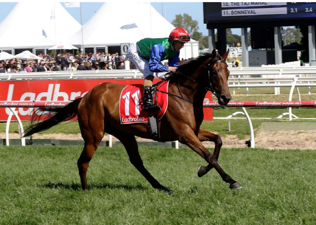
Bonneval will look to shake off an unlucky run in the Caulfield Stakes when she lines up in the Gr. 1 Caulfield Cup this weekend