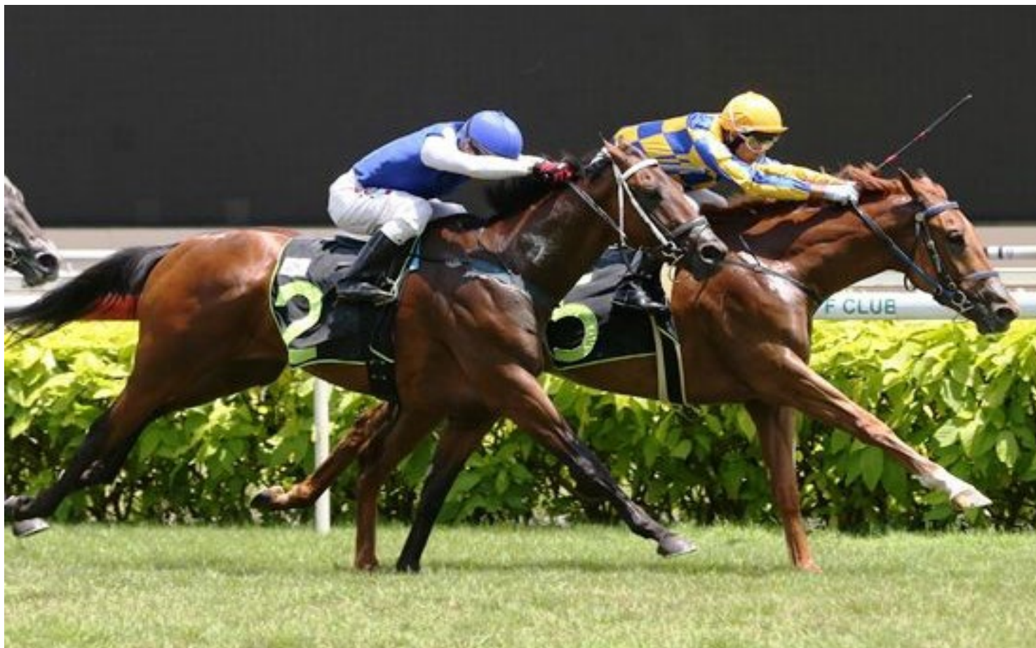
Easy Does It (inner) holds on to score his first win for some excited owners at Kranji

D ebut winner Easy Does It (NZ) (Super Easy) had a happy bunch of new owners experiencing the joy of racing a winner at their baptism of fire on Sunday.