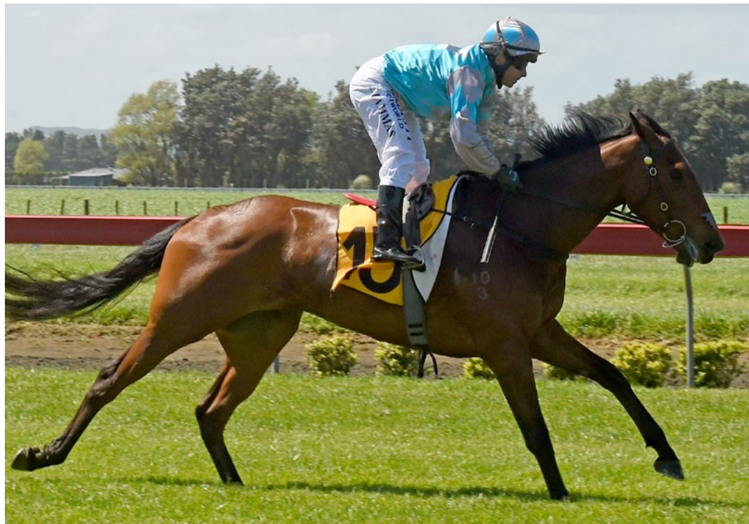
Hello M'Lady bolts clear as she dominates her rivals at Hawera