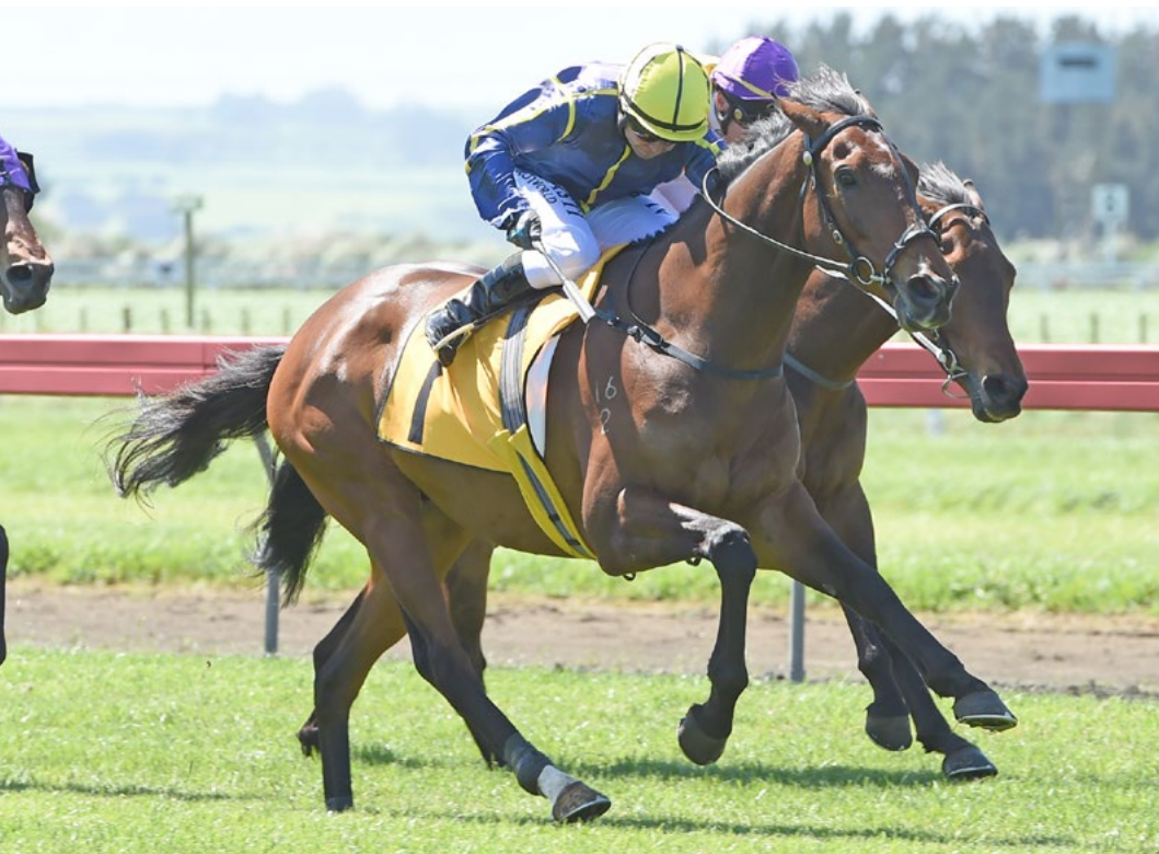
Travimyfriend scores with something in hand at Hawera