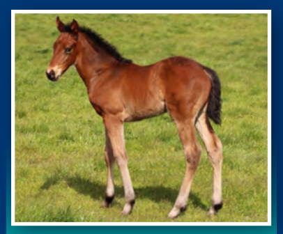
Colt ex. Surooh (Pivotal) Bred by Valachi Downs