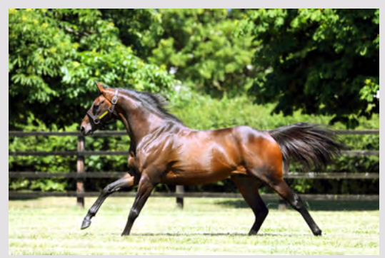
Little Avondale Stud stallion Time Test

Saturday was another bumper day for star stallion Dubawi, who was represented by Group One winners in both hemispheres.