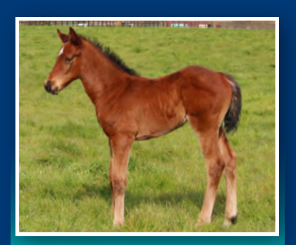
Colt ex. Silke Top (Librettist) Bred by Valachi Downs