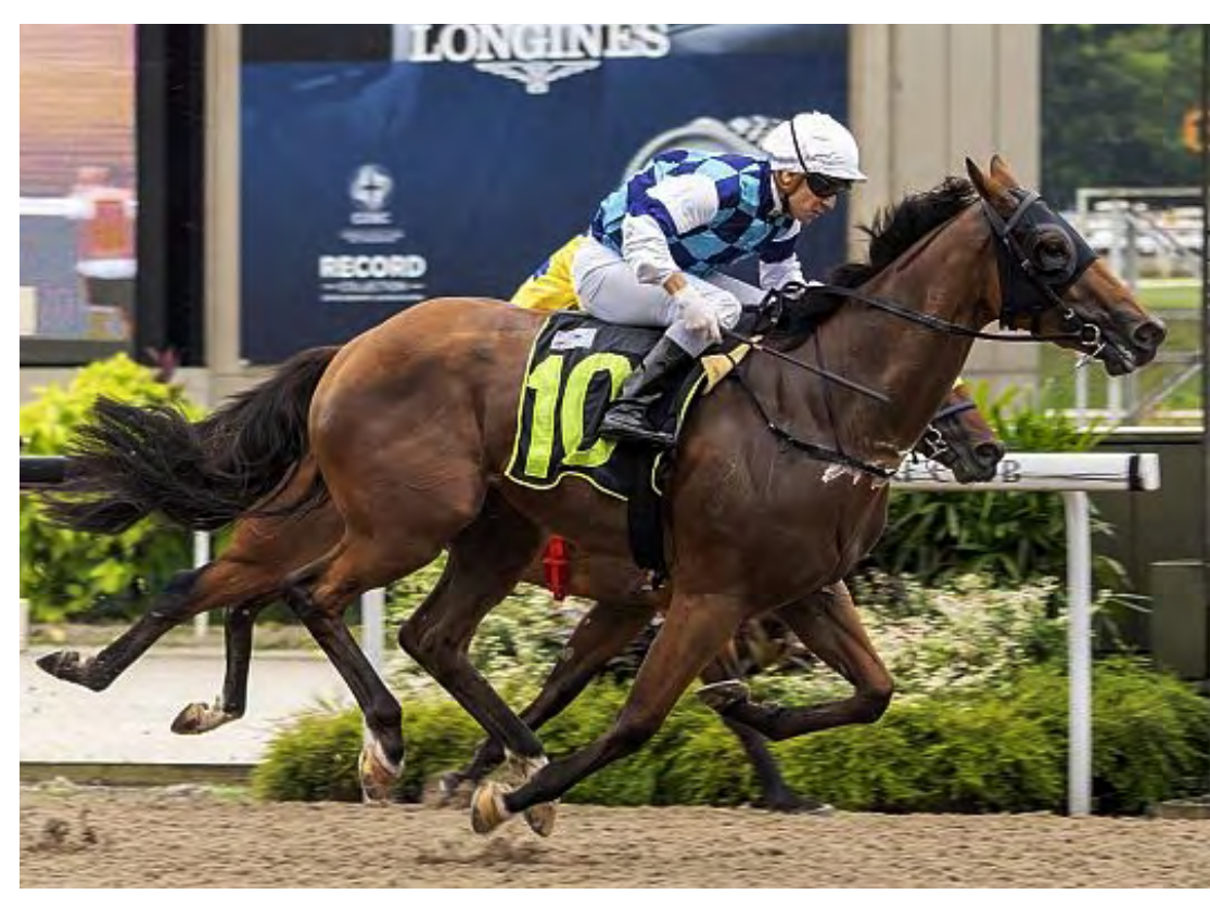
Super Posh breaks maiden status at Kranji

"Super Posh has done everything right since he's been in New Zealand and has settled in really well here. I don't think it will be just the one win from him.