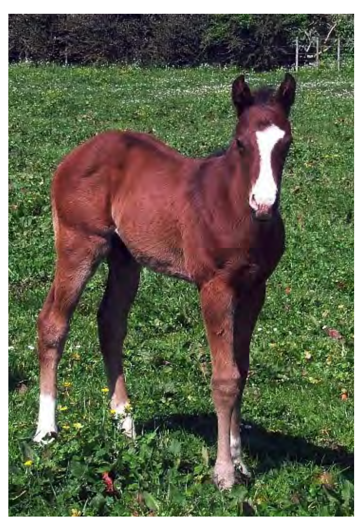
The Castledale ex Hot 'N' Moss foal born last month

a part of giving a young lad like him an opportunity gives me as much pleasure as the win itself because we all want that opportunity in life.