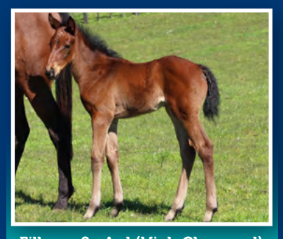
Filly ex. So Ard (High Chaparral) Bred by Hill Interior Linings