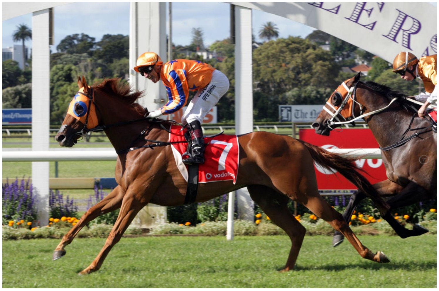
Star kiwi galloper Gingernuts has had his immediate plans changed following the abandonment of Saturday's Gr. 1 Livamol Classic

start in the A$3million BMW Caulfield Cup in a fortnight is off the table for New Zealand Derby winner Gingernuts (NZ) (Iffraaj) after he missed a run in the Gr. 1 Livamol Classic on Saturday.