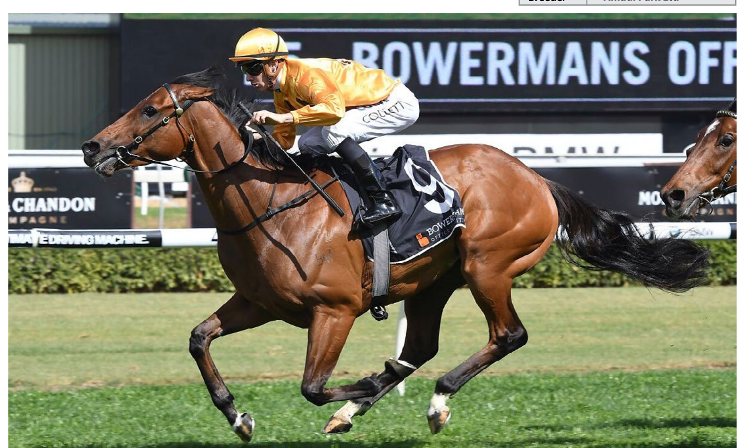
Never in danger of defeat, Sir Plush crosses the line an easy winner of the open 1400 metre event at Randwick.