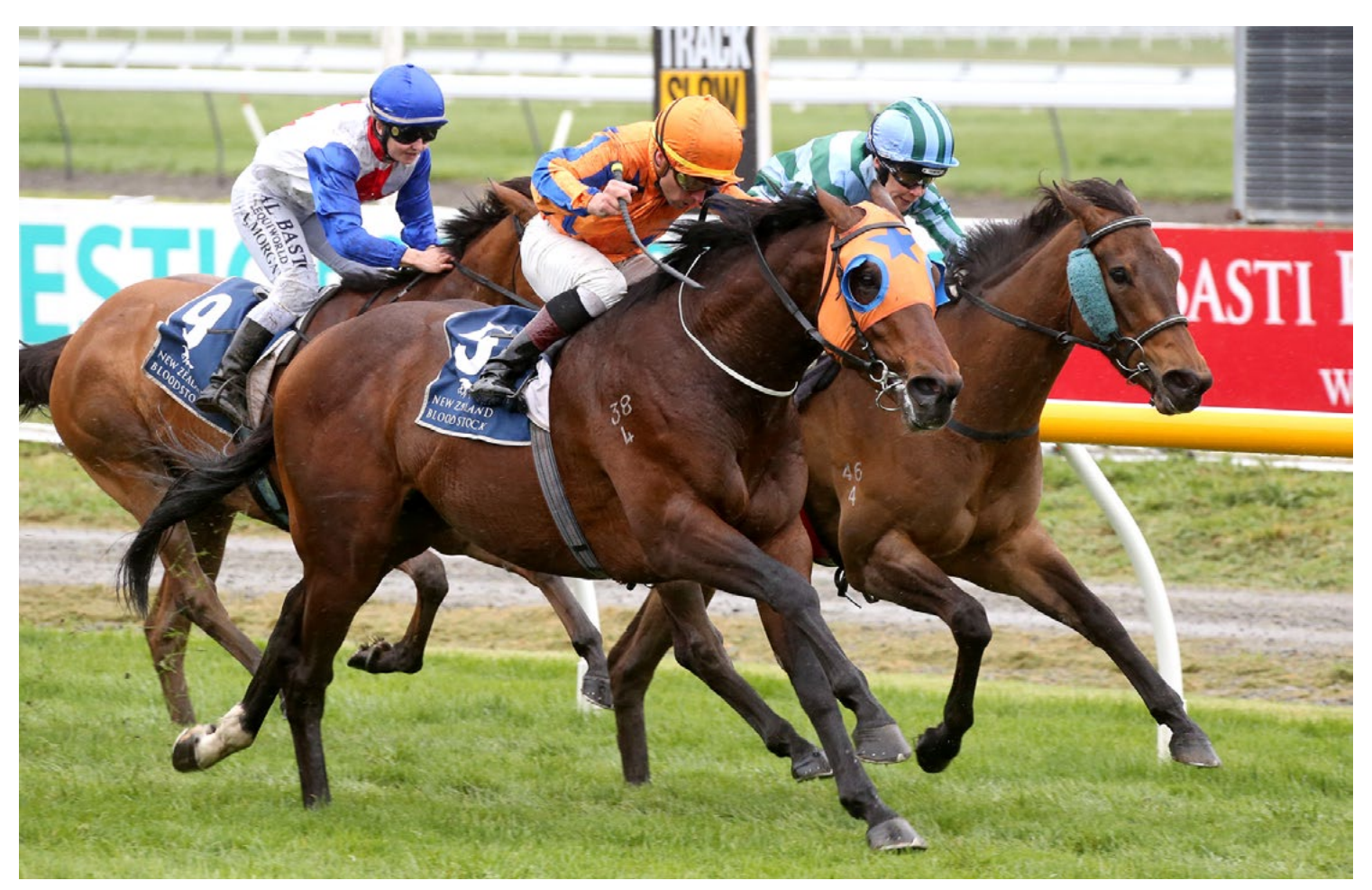
Age Of Fire does enough to defeat the filly Hot Fuss in Riccarton's Guineas Trial.

day that started in spectacular fashion for Te Akau Racing ended in disarray with the abandonment of racing at Hastings.