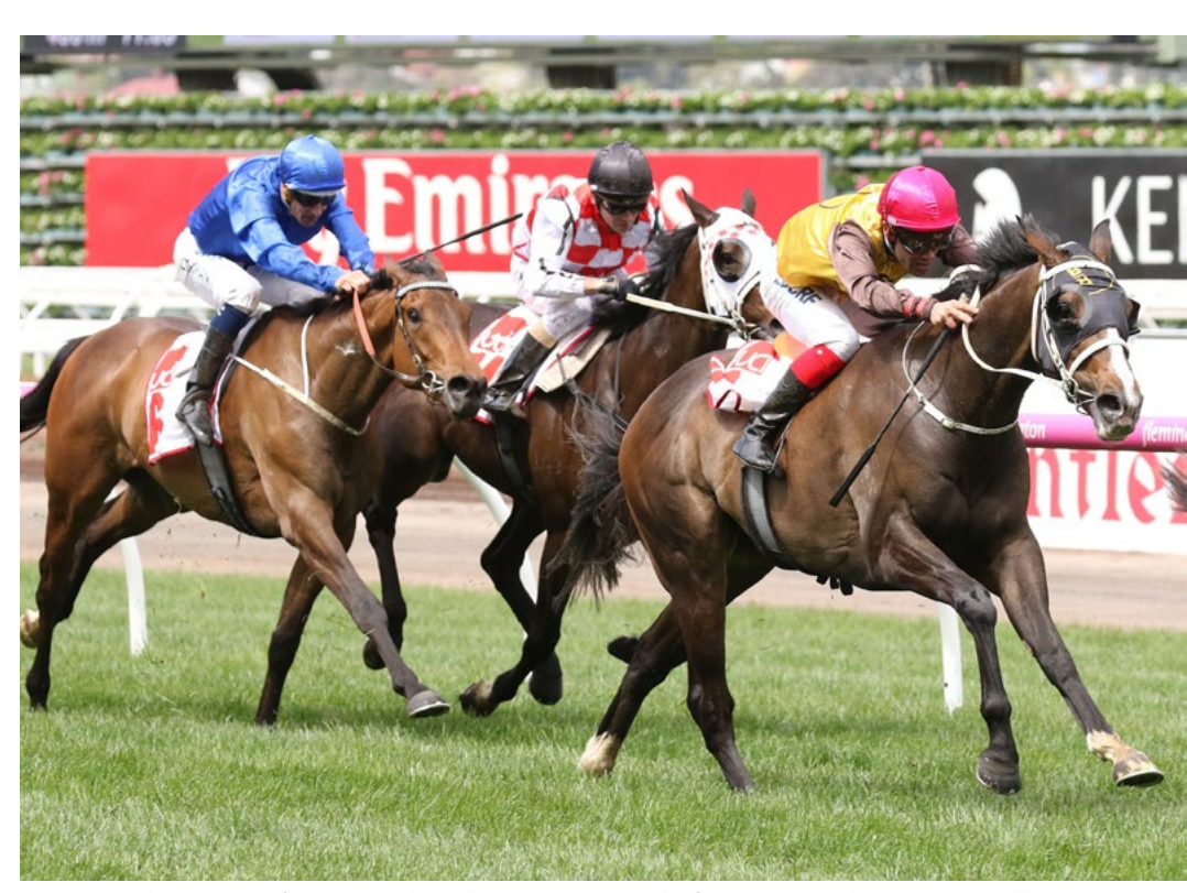
Main Stage bursts away from his rivals and into Victorian Derby favouritism in the three-year-old staying test at yesterday's Flemington meeting.