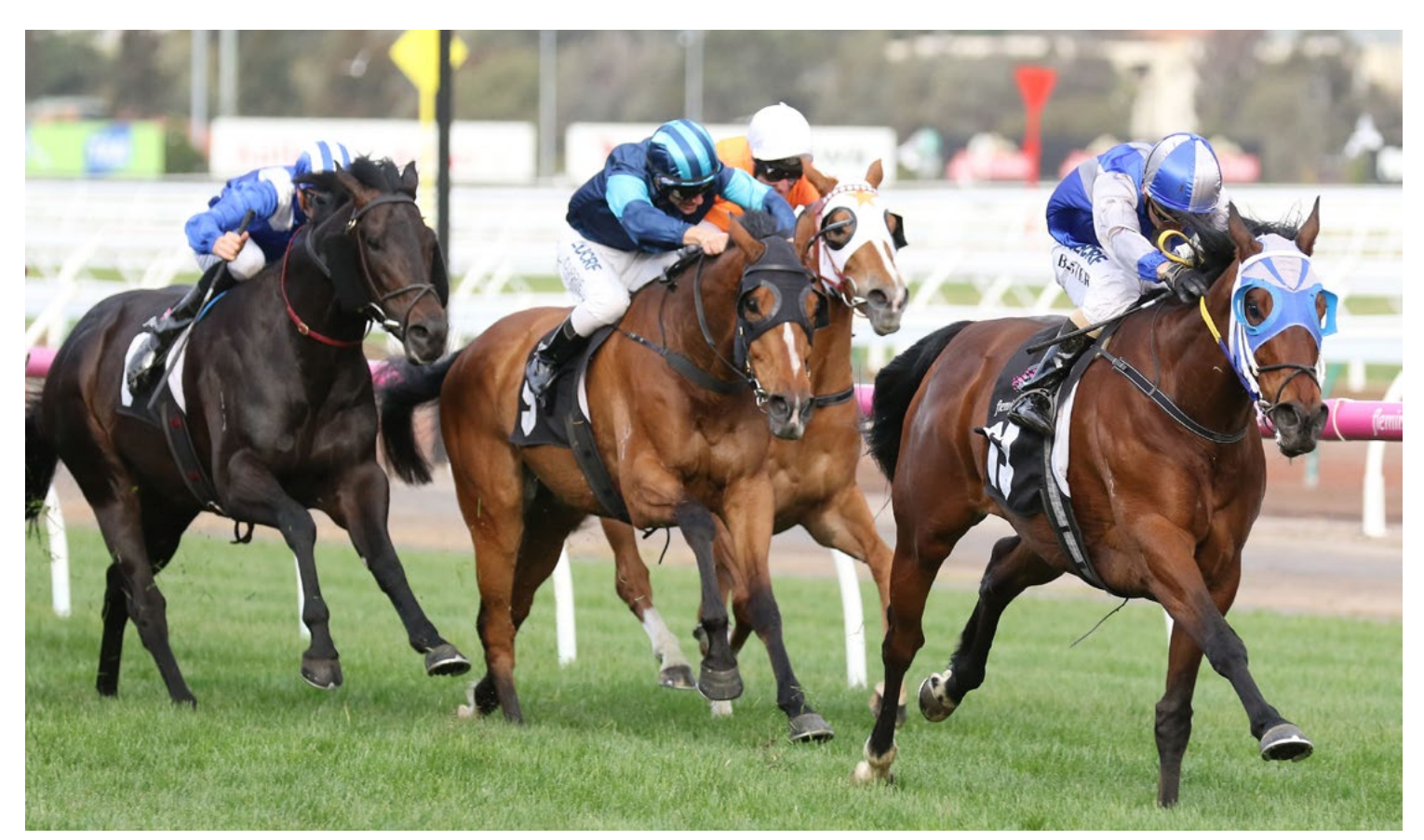
Pure Pride gets a well-deserved win in the final event on yesterday's Flemington card.

ightly raced five-year-old Pure Pride (NZ) (Shocking), second in the Group Two Blazer Stakes at the corresponding meeting a year ago but balloted out of this season's edition, recorded an impressive consolation win in the Listed Paris Lane Handicap at Flemington yesterday.