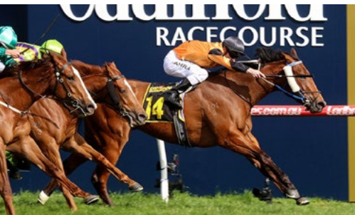
Legless Veuve (NZ) (Pins)