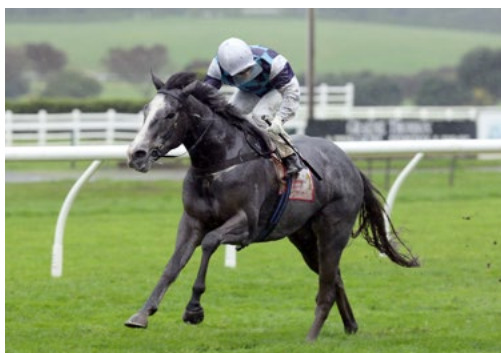
The Soultaker (NZ) (Iffraaj)

Purchased by Dwyer for $82,500 out of Westbury Stud's Select Sale draft at Karaka last year, the daughter of Redwood was runner-up on debut at Moe last season and successfully resumed in a Mornington maiden last week. Full story here.