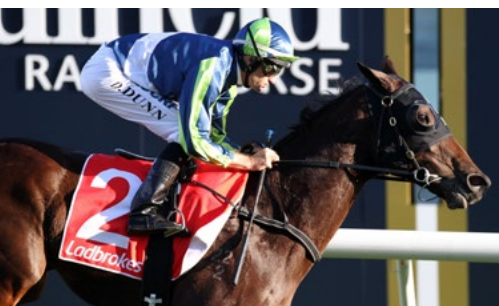
He's Our Rokkii (NZ) (Roc De Cambes)

She's a beautiful big filly with a terrific stride and great attitude she's one of the nicest fillies you could put a saddle on and I think she'll be even better as an autumn three-year-old."