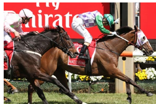
Prince Of Penzance (NZ) (Pentire)