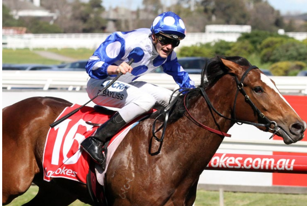
Karaka Yearling Sale graduate Harlow Gold will step out as a leading candidate in tomorrow's Gr. 1 Thousand Guineas at Caulfield

"He'll give her a good ride and he'll be pumped if she wins."