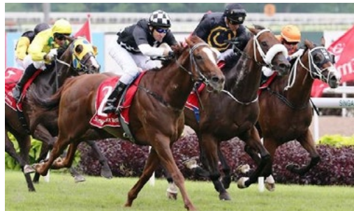
Well Done (NZ) (Falkirk)