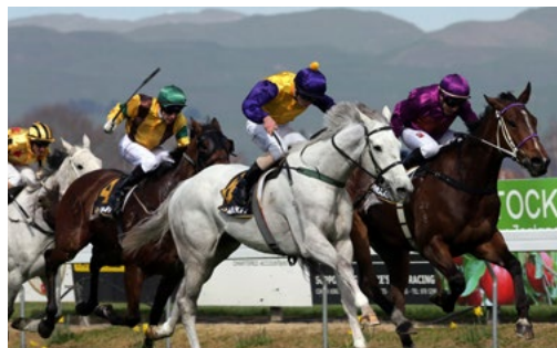
Blizzard (NZ) (Any Suggestion)

The former Melbourne and Australian Cup winner stands at Rich Hill Stud, and Rocknrolla's connections may get the opportunity to bank their service fee straight from the farm on Saturday. Full story here.