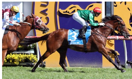
Turn Me Loose (NZ) (Iffraaj)