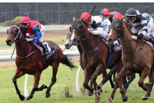
Rocknrolla (NZ) (Towkay)