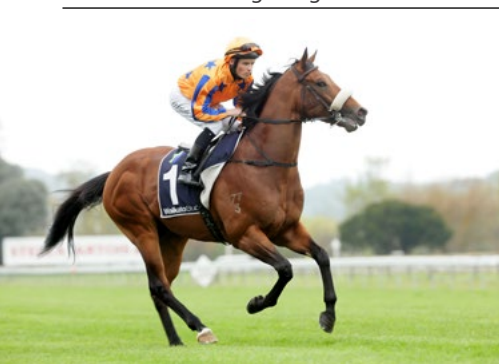
Heroic Valour (Fastnet Rock)