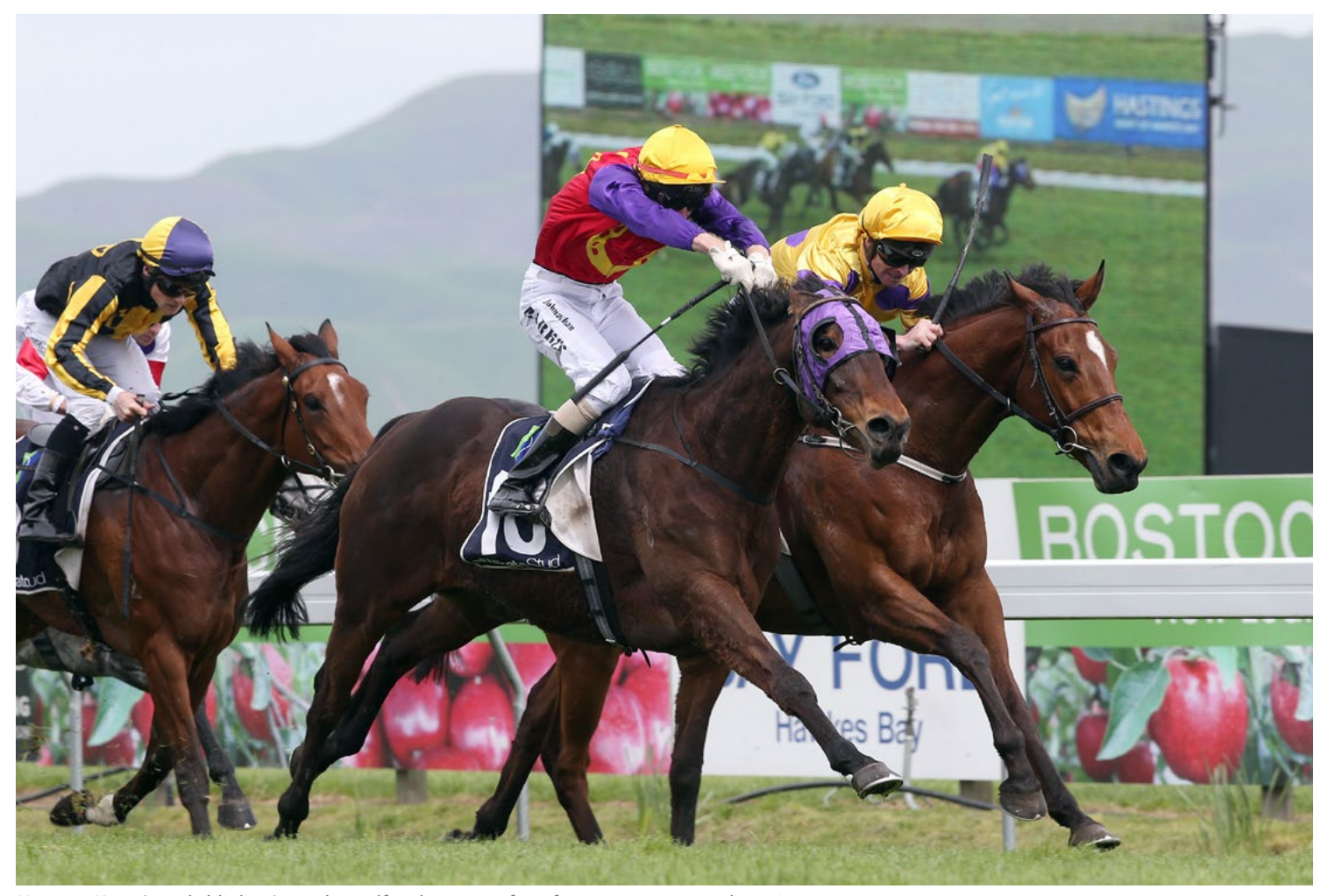
Heavens Keep (purple blinkers) puts himself in the picture for a feature race start with a gritty win