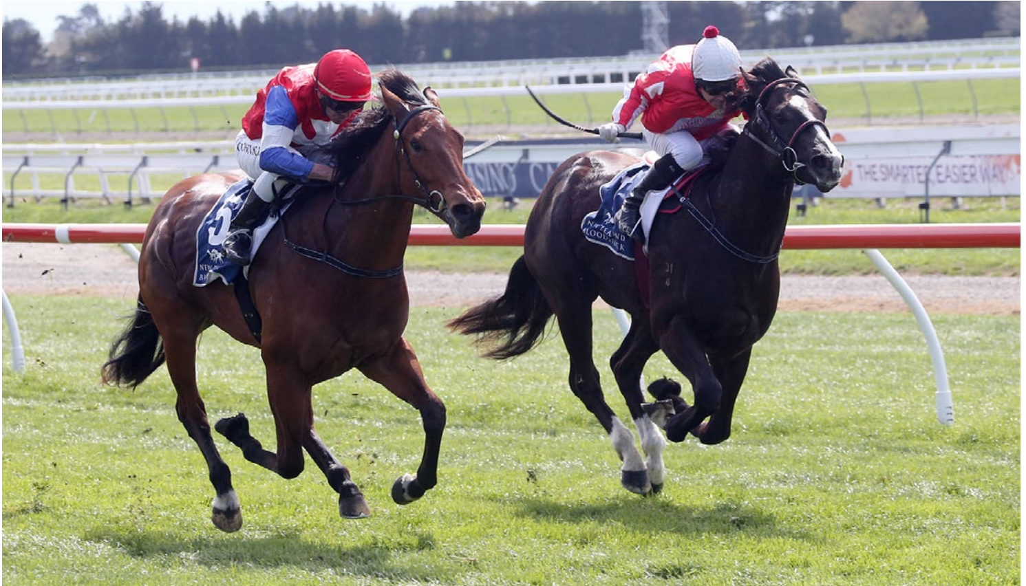
Kiwi Ida (nearest camera) outfinishes Sensei as the pair prove themselves a cut above their fellow first-starters in the juvenile event at Riccarton.

B argain buy Kiwi Ida (Squamosa) made the perfect start to her career at Riccarton to set up a likely return for a tilt at a black type prize.