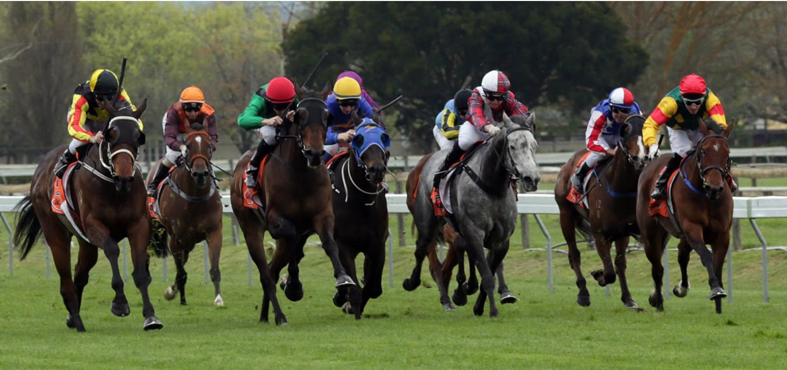
With the rest of the field beaten, Ringo (in the black and gold Wellfield colours) and Get That Jive (red cap, green sleeves) settle down to a tooth-and-nail fight to the line.

R ingo (NZ) (Fastnet Rock) showed he was on target to tidy up unfinished Riccarton business when he opened a new campaign in outstanding style at yesterday's Hastings meeting.