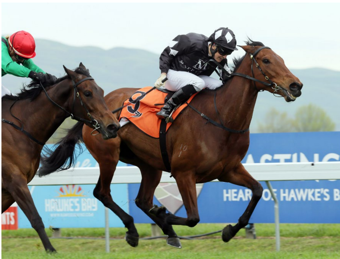
Nomisma (black colours) has enough in hand to hold off the determined challenge of Let Her Rip in the opening race on yesterday's Hastings card.