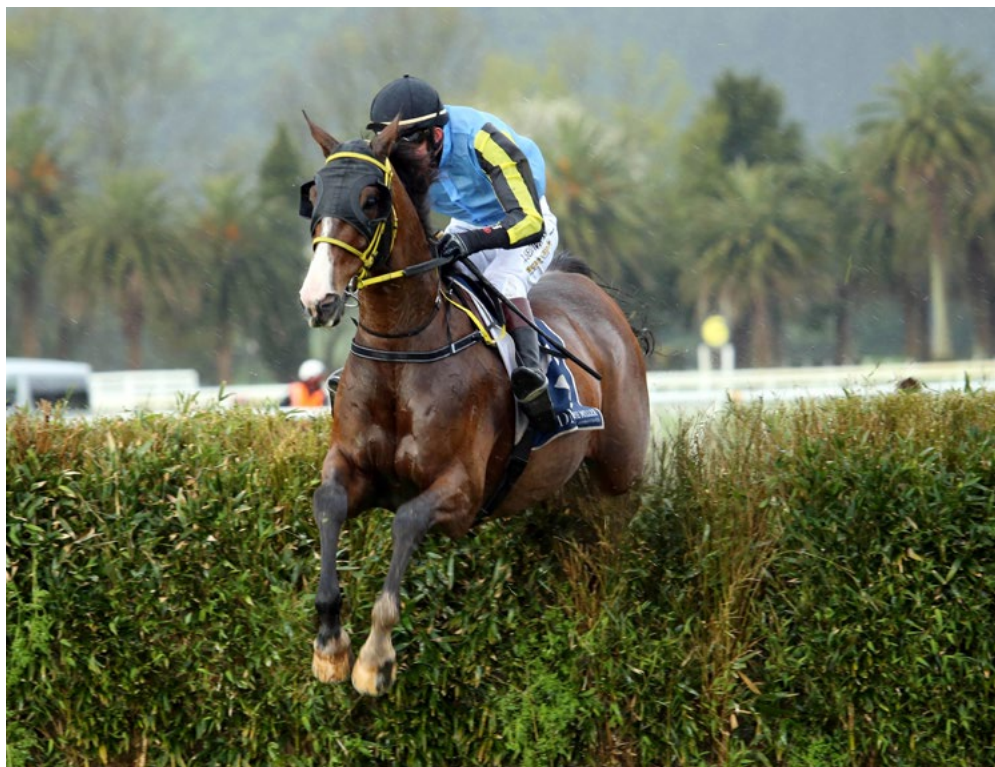
Thenamesbond is poetry in motion as he leaps a fence at Te Aroha