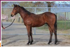
OCEAN PARK FILLY

Plenty of pin-hooking and breeding opportunities online now