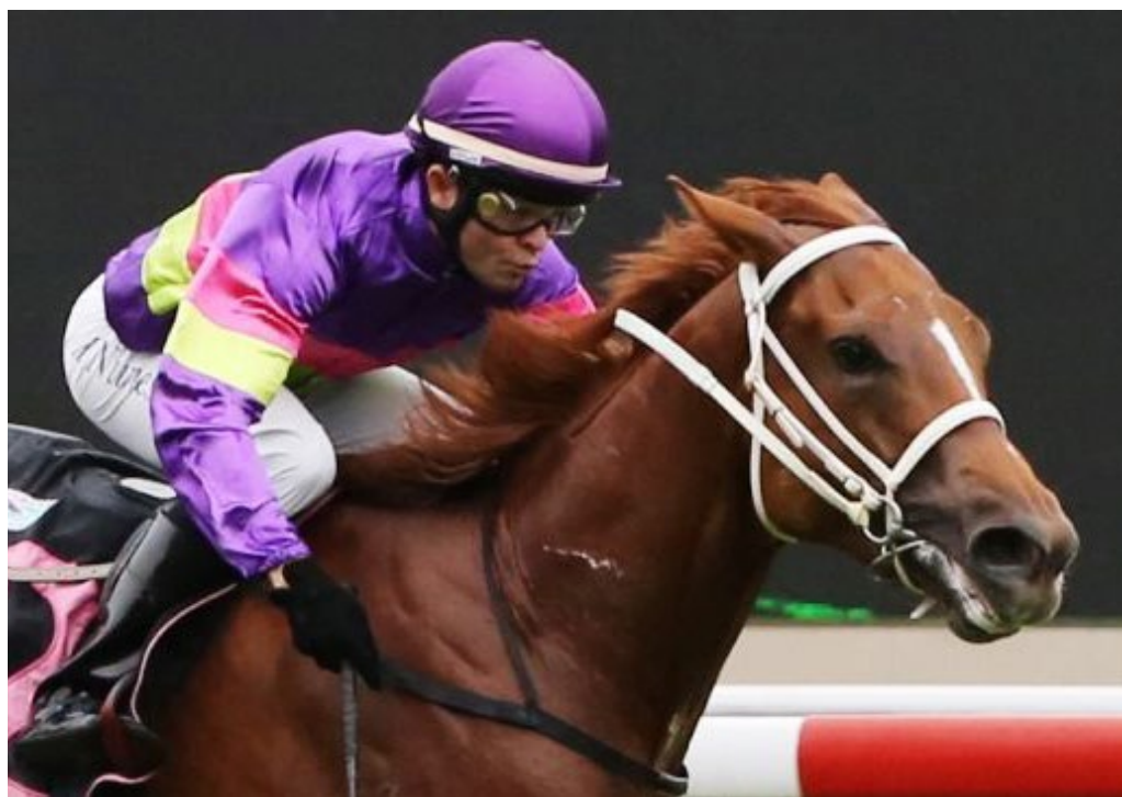
Yabadabadoo cruises clear for a solid Kranji victory