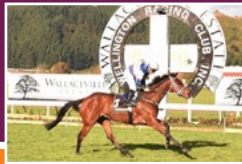
STAKES WINNING MARE