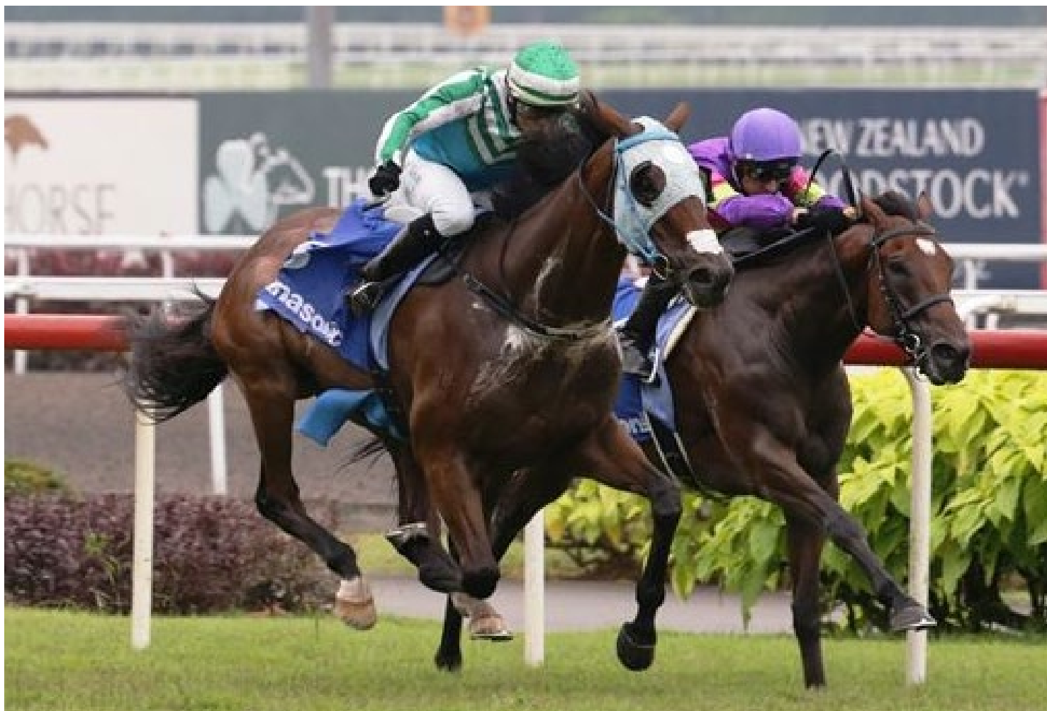
Infantry powers to success in the Panasonic Kranji Mile