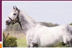
RELIABLE MAN NOM