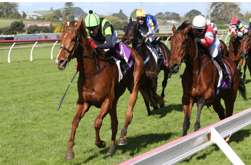
Flashy chestnut Notabadcraftsman is all determination as he scores at Ellerslie