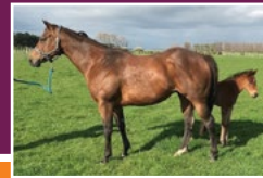
MARE & FOAL PACKAGE