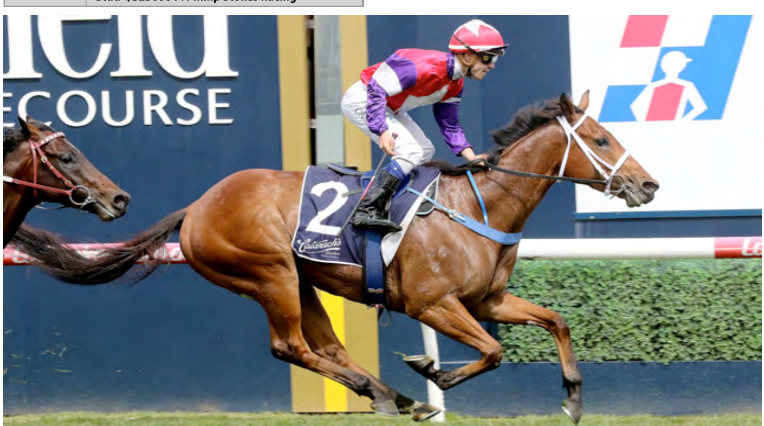
Éclair Calling winning at Caulfield