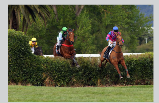
The Arabian Duke (NZ) (Bachelor Duke)

The win was just the fourth in a 52-start career for The Arabian Duke however he has now won twice from just three attempts over the bigger fences.