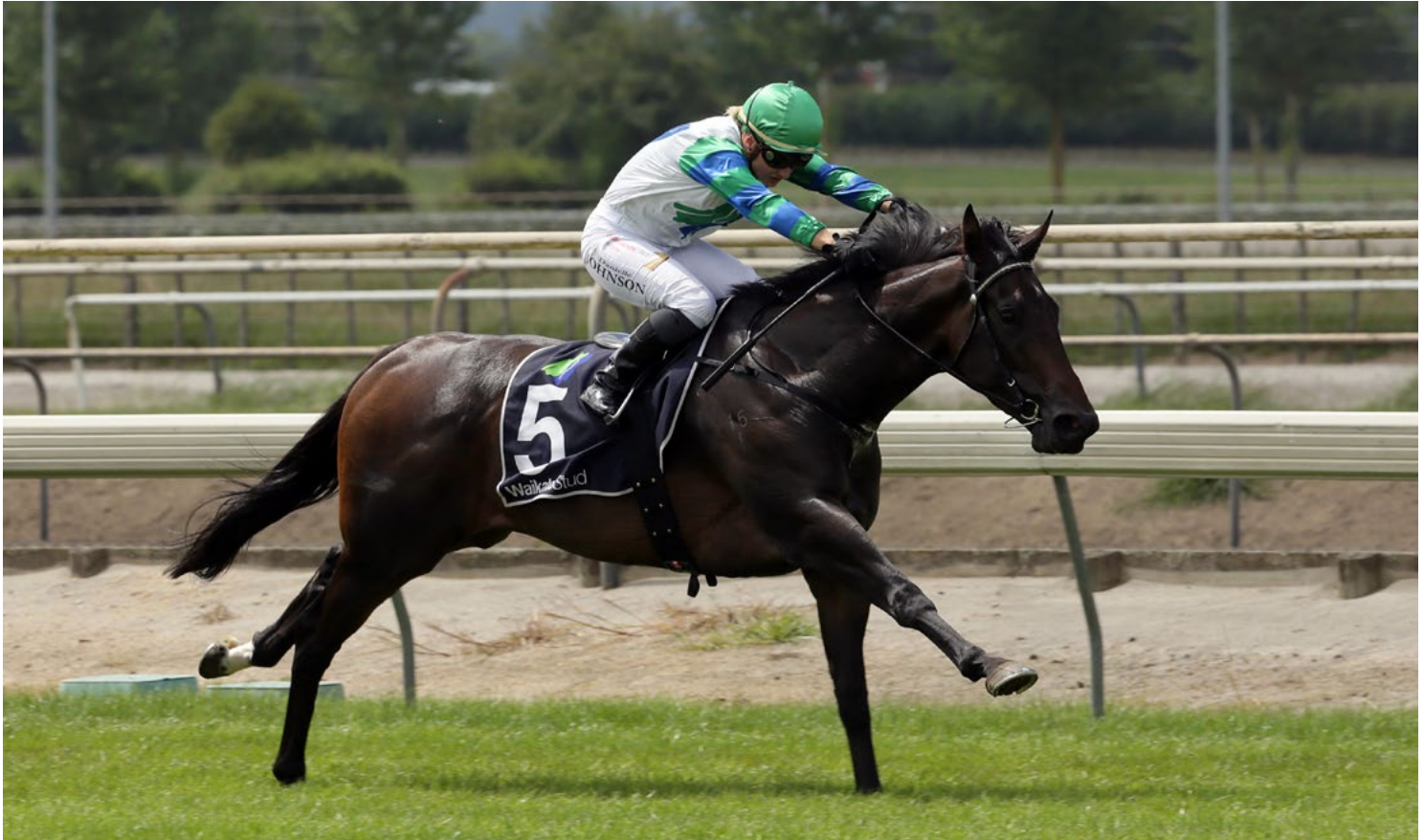
Classy mare Mary Quant in winning action during her last campaign