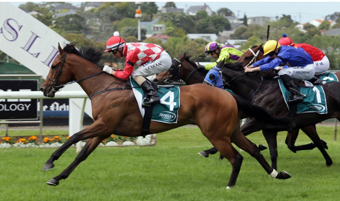
Despite a few home straight wobbles promising galloper Killarney makes it two wins from three starts with a strong performance at Ellerslie