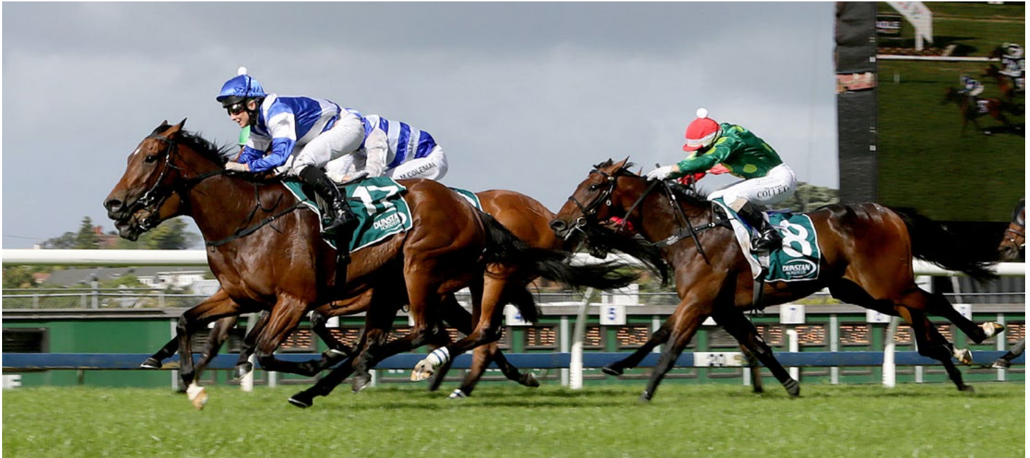
Rising Shot cruises up on the outer to win handsomely on the weekend

Exciting mare Rising Shot (NZ) (Red Giant) added her name to the list of potential finalists for the inaugural Dunstan Feeds Rising Stars Championship (1500m) at Ellerslie on Boxing Day with a stunning performance in one of Saturday's qualifying events for the series.