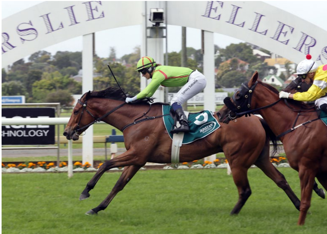
First Honour takes all the spoils at outside odds on Saturday