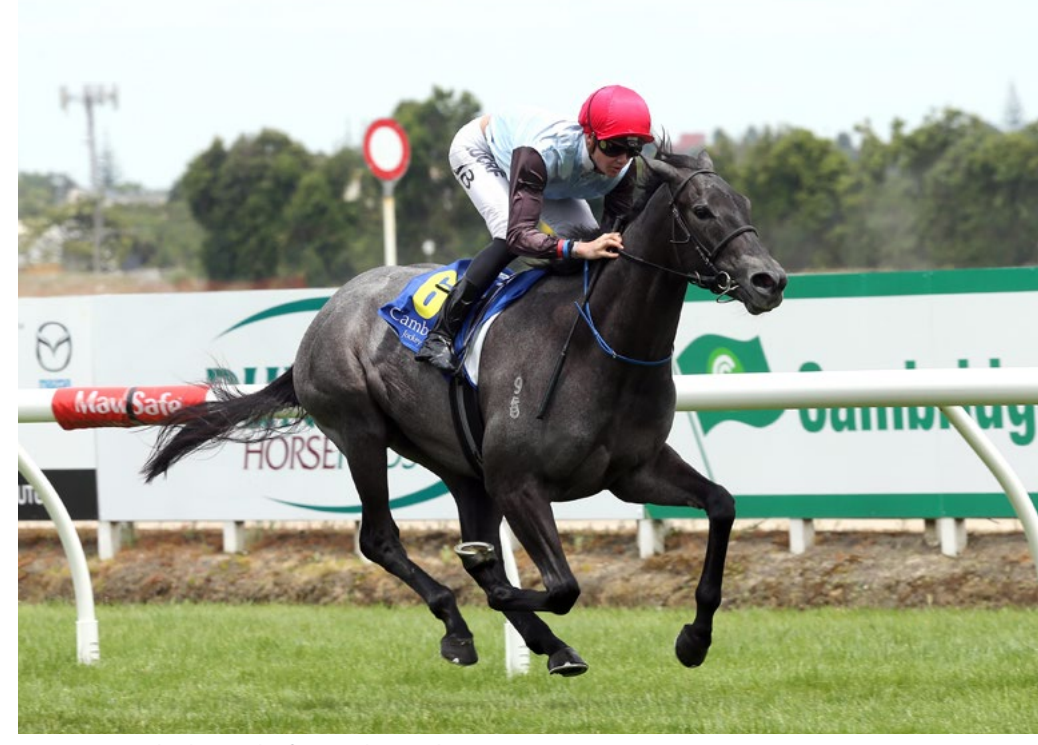
Exciting juvenile She's A Thief streets her rivals at Te Rapa

"She trialled enormous and the stable has always had a good opinion