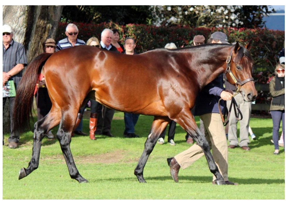
Waikato Stud resident stallion Ocean Park

last fifty metres but it was never in doubt."