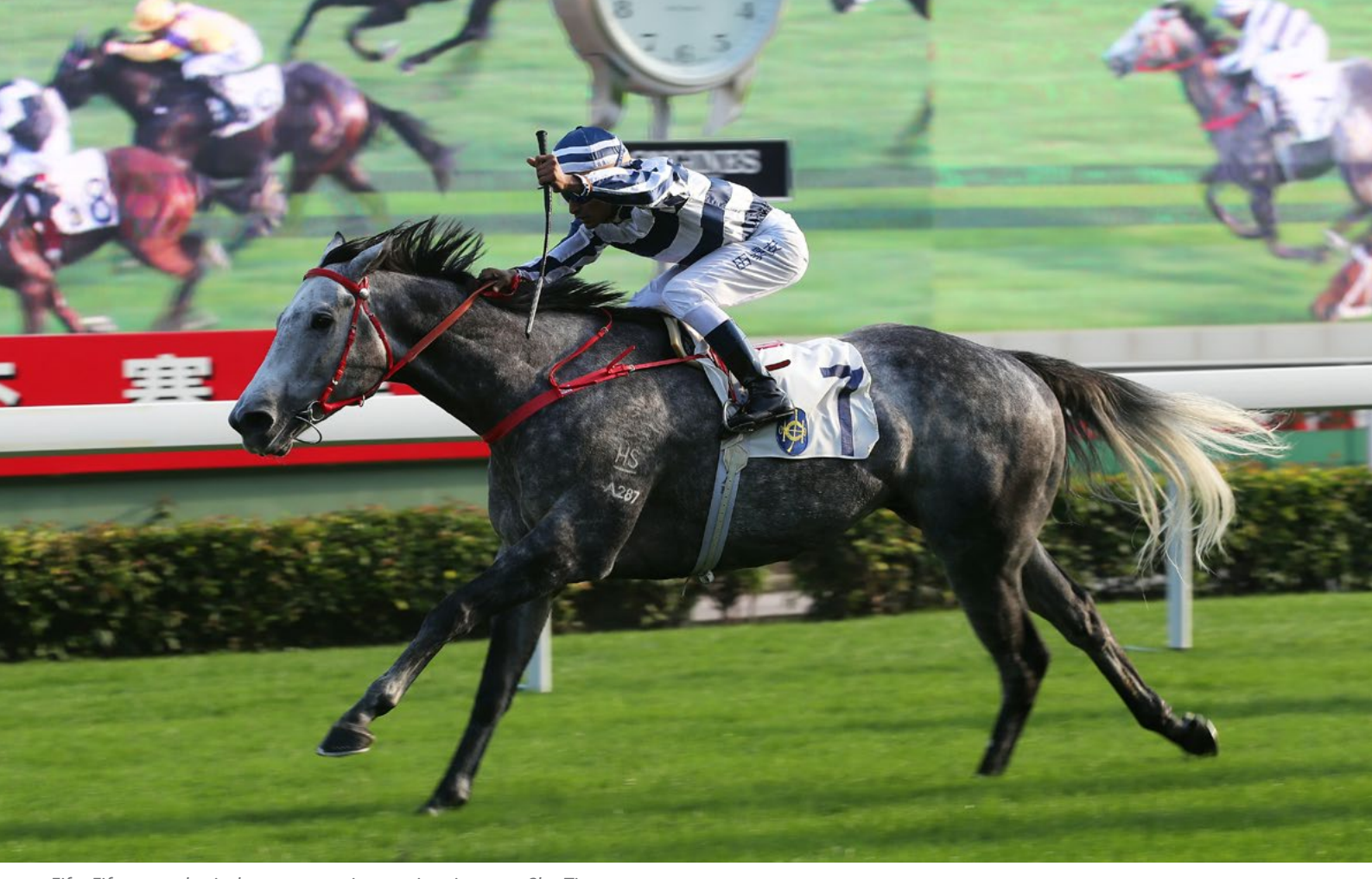
Fifty Fifty extends nicely to score an impressive victory at Sha Tin

ifty Fifty (NZ) (Thorn Park) continued his ascent through the grades with victory in the Chevalier Cup Handicap at Sha Tin Racecourse on Sunday.