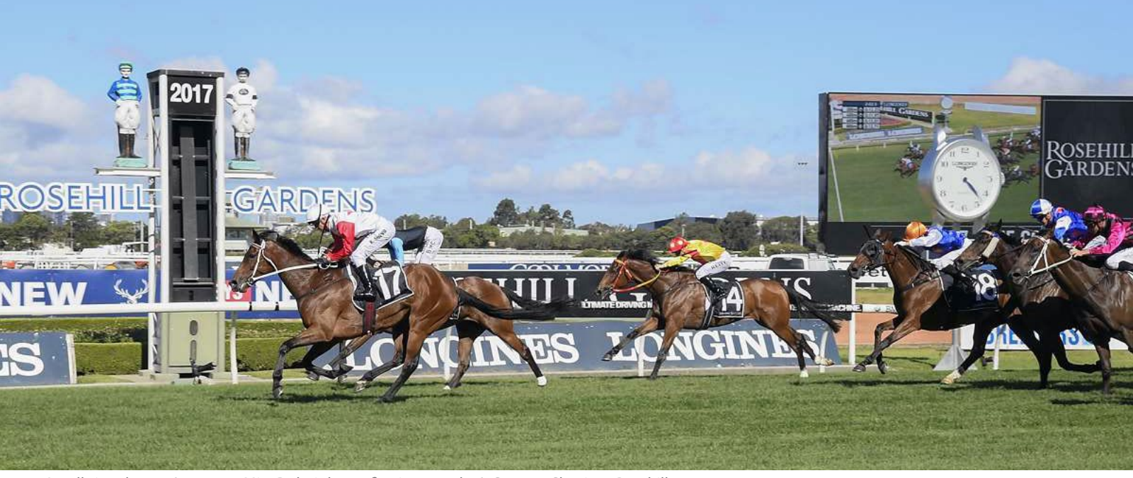
A well-timed stayer's run gets Miss Dubois home first in yesterday's Country Classic at Rosehill.