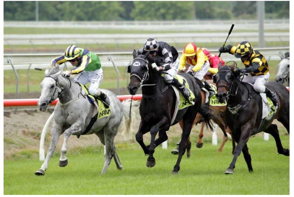
Grand old grey handicapper Maygrove adds another Cup to his collection as he fights off Five To Midnight (black and white colours) and Promise To Reign.

"Great for the public and just great for everyone.