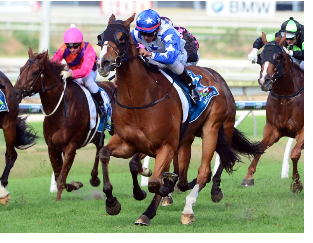
Crack Me Up scores a dominant win in yesterday's Tatt's Recognition Stakes at Doomben.