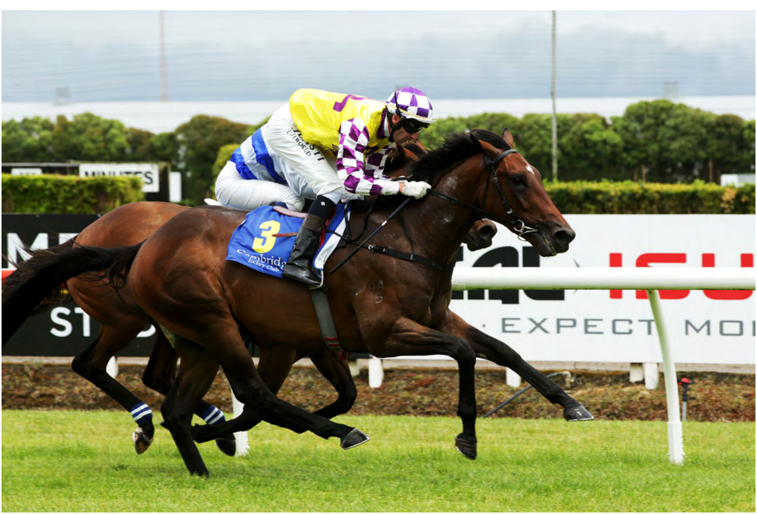
Surely Sacred stretches nicely to secure his debut win at Te Rapa

he early action at Sunday's Te Rapa race-meeting served up a pair of three-year-olds that could well command closer attention over the coming months.