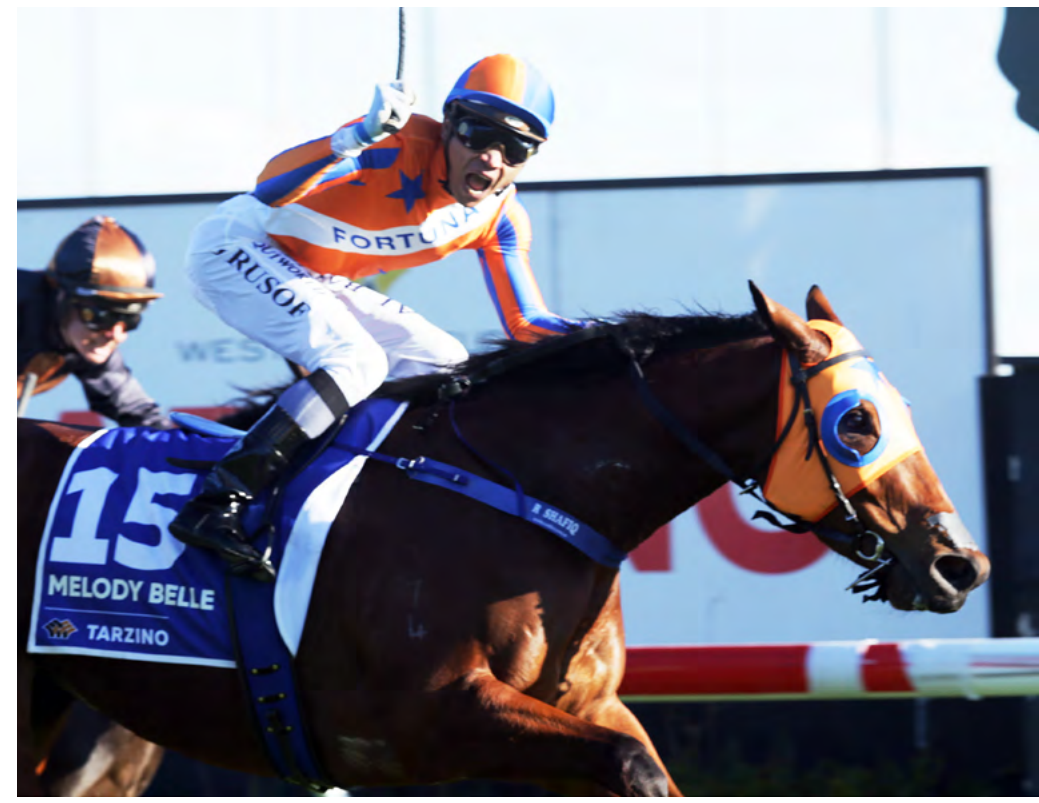
Star galloper Melody Belle will make an appearance at the Matamata trials this week