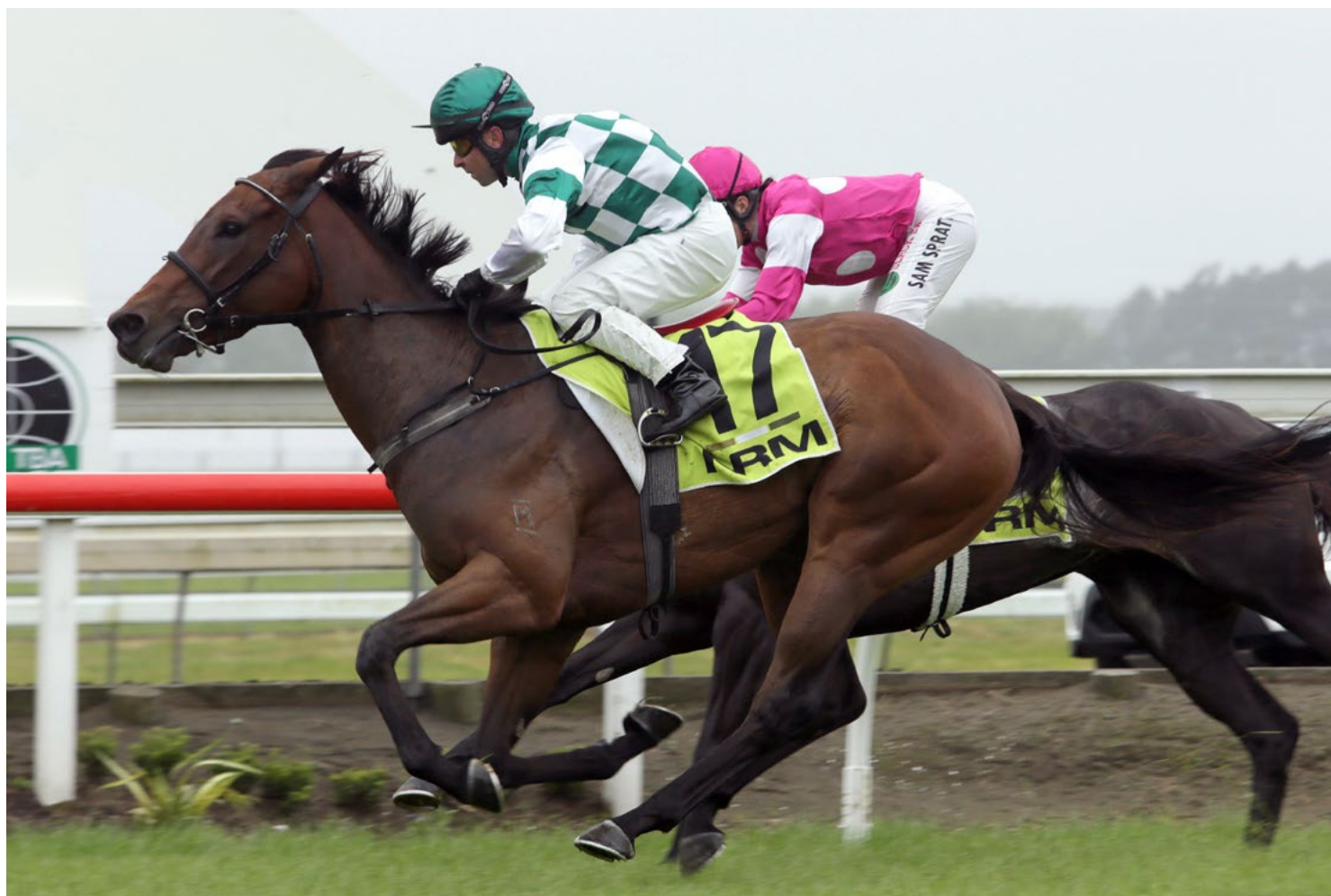
Upset winner of the Gr. 2 NRM Auckland Thoroughbred Breeders' Stakes, Lasarla