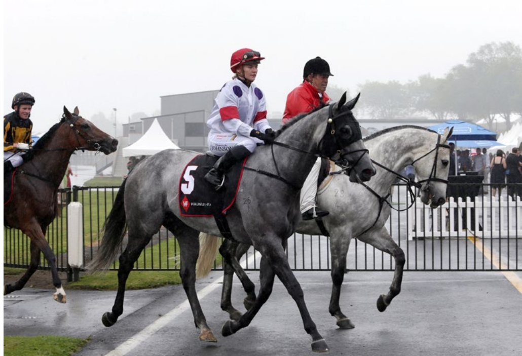
Ghostly grey mare Maid Of Steel returns to the winner's enclosure at Pukekohe

Maid Of Steel ran second to her former stablemate Sacred