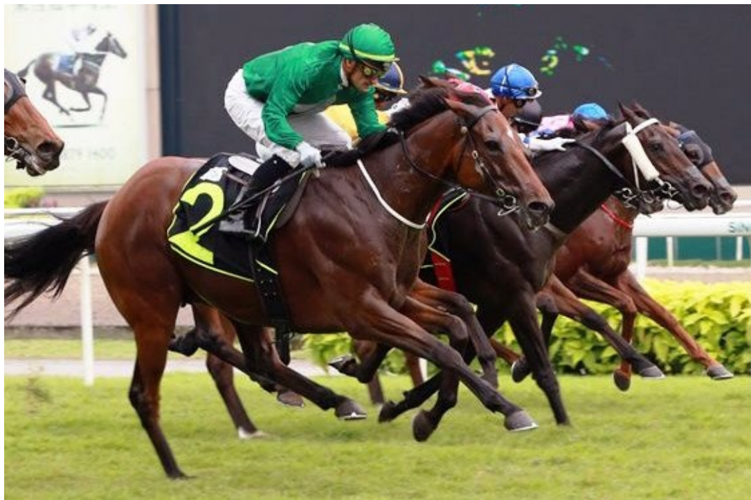
Gilt Complex hits the line for a quality victory