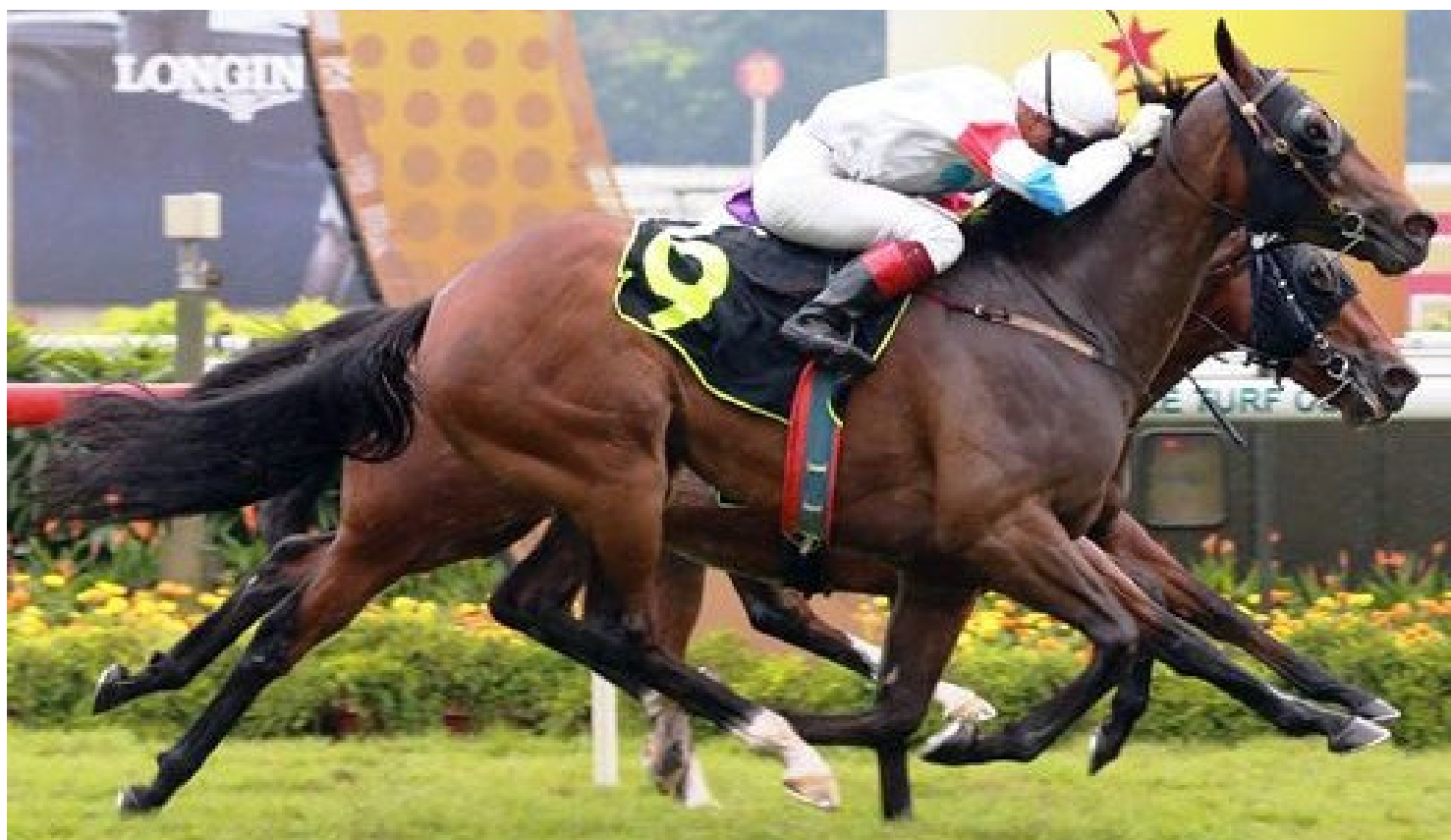
Longshot Poseidon finishes the best to post a brilliant win