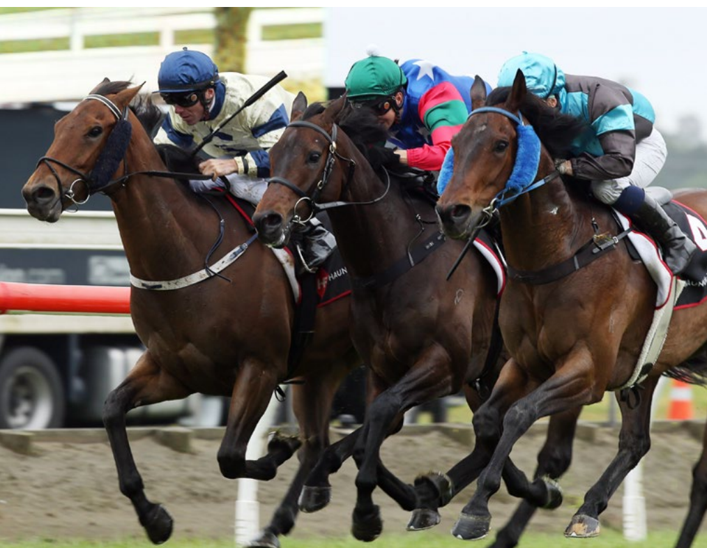
Prince Of Passion (blue sidewinkers) gets in the deciding stride in a blanket finish