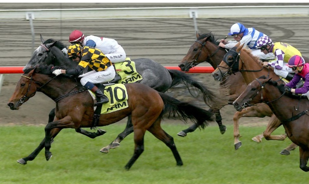
Buy Me A Rock (outer) storms home for an impressive victory