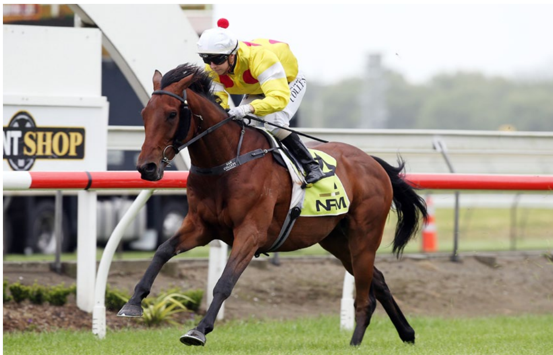
Promising stayer El Luchador has things well in control at Pukekohe

"He definitely likes a bit of rain around. He's nominated for a couple of