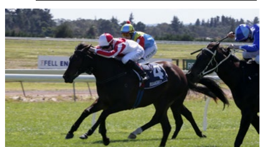
Global Thinking (NZ) (So You Think)

double in the Gr.2 Westbury Classic and the Gr.1 New Zealand Thoroughbred Breeders' Stakes. Full story here.