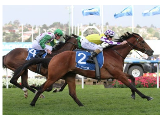
Sacred Elixir (NZ) (Pour Moi)

trainers targeted by the Auckland Racing Club in their bid to bring Australian flavour to next year's feature events and Weir has responded with multiple nominations. Full story here.