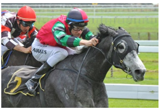
Slice Of Class (NZ) (Guillotine)

The remaining New Zealand representatives had mixed fortunes in the draw with Majestic Moments (NZ) (Darci Brahma) to jump from barrier five, Mr Spielberg (NZ) (Pentire) from barrier two, Titanium (NZ) (Tavistock) from barrier one, Blue Swede (NZ) (O'Reilly) from barrier eleven, and Cheetah On Fire (NZ) (One Cool Cat) from barrier six.