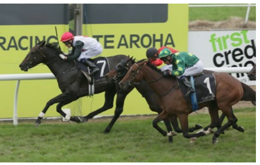
Perfect Fit (NZ) (Elusive City)

He did however catch the eye at the track last weekend running second in the Gr.3 R.J Peters Stakes (1500m) when beaten only a length by Scales Of Justice (Not A Single Doubt) who backs-up in the Gr.1 Railway Stakes (1600m).