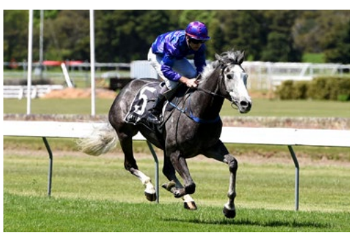
Megablast (NZ) (Shinko KIng)

(Shinko King) is thriving ahead of the sternest challenge of his brief career.