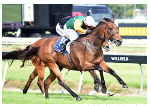
Shillelagh (NZ) (Savabeel)

"The road was rolling towards us and the sky in front of us lit up. Apparently, that was the energy released from the earthquake. Everything was rocking and rolling, scary stuff." Full story here.