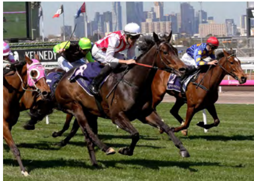
Our Libretto (NZ) (O'Reilly)