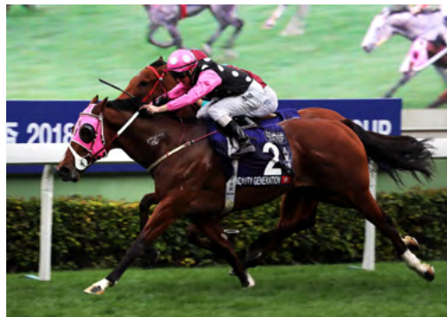
Beauty Generation (NZ) (Road To Rock)

Yogi, who is a four-time Melbourne winner with the first three of those successes at Sandown Hillside and the other at Flemington, narrowly holds favouritism to win the Sandown Cup ahead of stablemate Azuro (Myboycharlie).