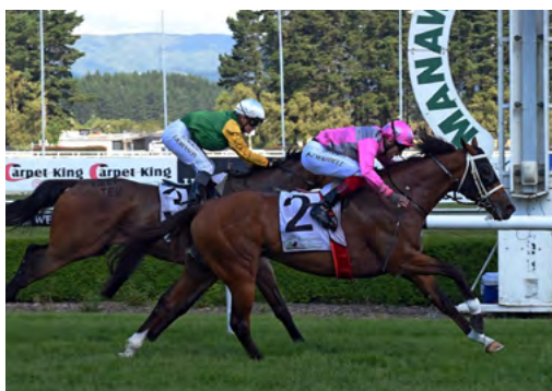
Wyndspelle (NZ) (Iffraaj)