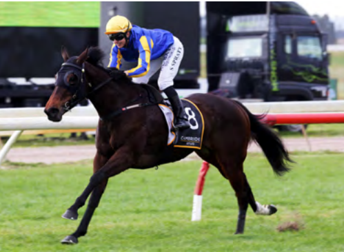
Melt (NZ) (Iffraaj)