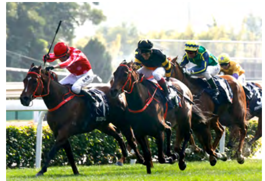
Mr Stunning (Exceed And Excel)

"He's a fit horse, so he doesn't need to do any more. I just think he's enjoying life," he added.