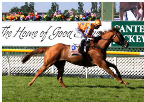
Te Akau Shark (NZ) (Rip Van Winkle)

better get him to the race in the best shape we can and I thought a two-mile race two weeks out was ideal."