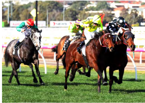
Yogi (NZ) (Raise The Flag)

"We've been sort of holding off (on using blinkers) for as long as we can," Weir said.