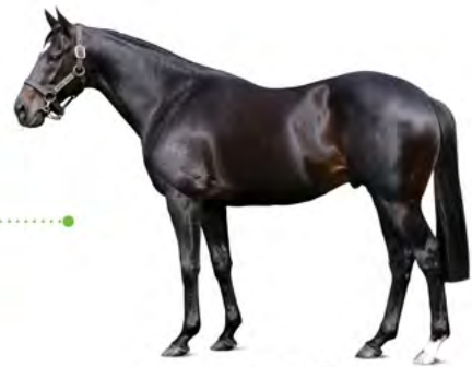
Sacred Falls SERVICE FEE $30,000+gst LFG

1 Leading First Season Sire at Karaka this year