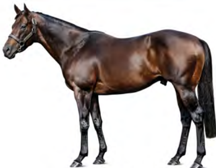
Ocean Park SERVICE FEE $30,000+gst LFG

1 Leading First Season Sire at Karaka this year