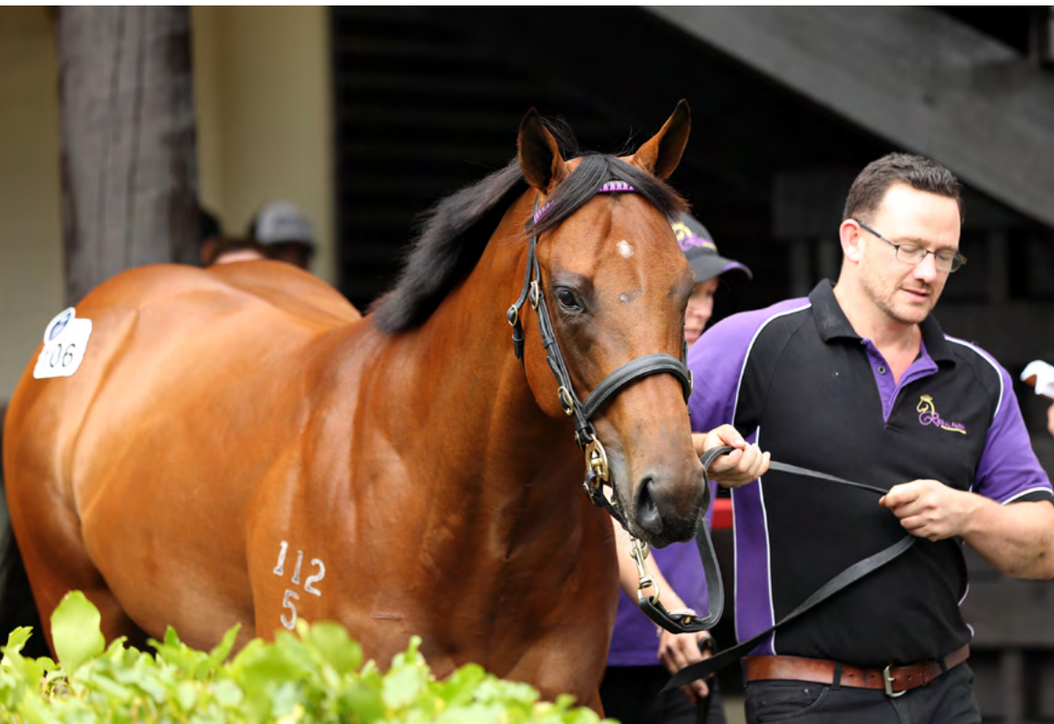
Hinchinbrook-El Ashb colt - The sale topping Lot 106 from 2017 Ready To Run Sale