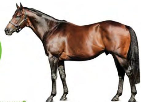
Rock 'n' Pop SERVICE FEE $9,000+gst LFG

1 Champion NZ based Australian Second Season Sire