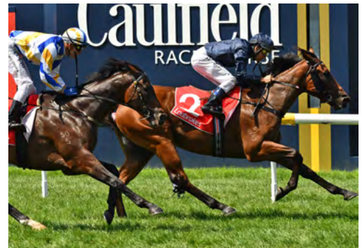
Long Leaf (Fastnet Rock)