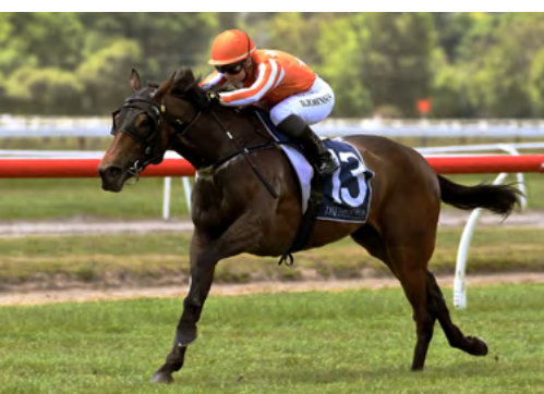
Jip Jip Rock (High Chaparral)