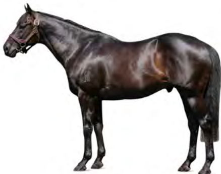
Savabeel SERVICE FEE Private