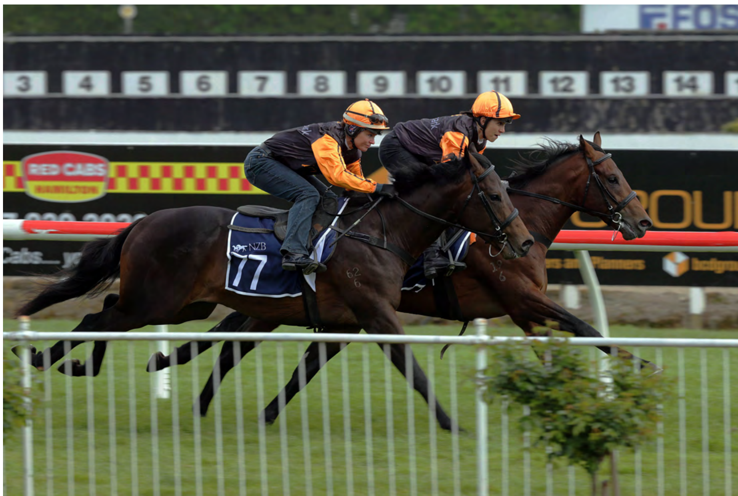
Prima Park 2018 Ready To Run Sale Lot 67

In a short time Prima Park has built a high profile on the thoroughbred sales landscape, and that will be enhanced by another quality draft going forward to the 2018 Ready to Run Sale.