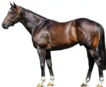
Tivaci SERVICE FEE $20,000+gst LFG

2 Young Stakes producing sires with winners in over four countries