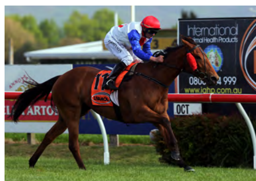
Savvy Coup (NZ) (Savabeel)

"She was flying. She did three rounds yesterday and wouldn't have blown a candle out but following her gallop today (Thursday), she's just pulled up scratchy," Bary said. Full story here