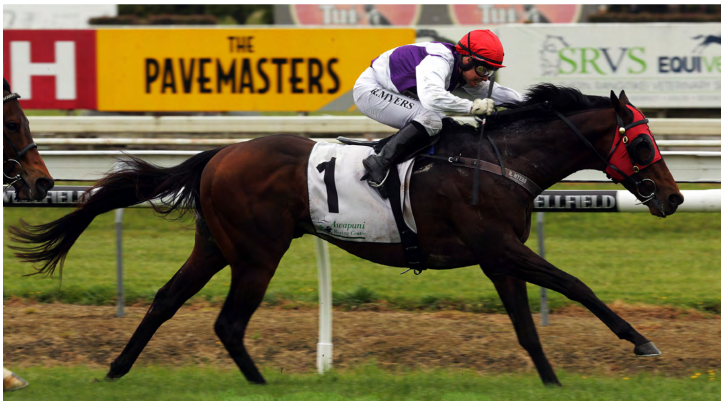
Ocean Emperor will look to make it back-to-back wins in Saturday's Gr.2 Gartshore Tauranga Stakes