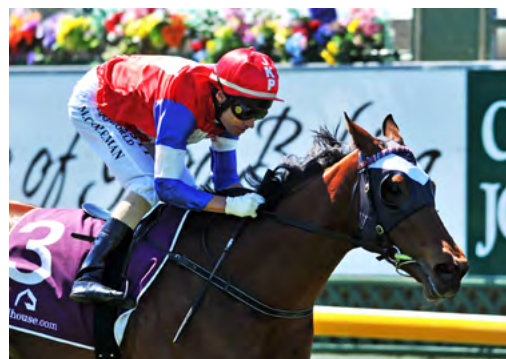
Kiwi Ida (Squamosa)