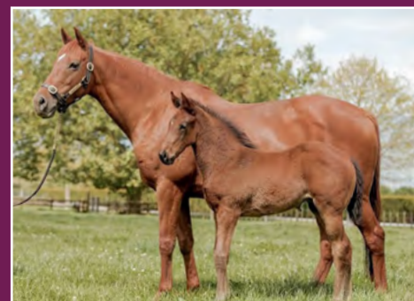
WINNER BY FAST 'N' FAMOUS & FOAL AT FOOT BY RIOS. UNRESERVED.