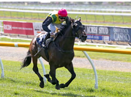
The Chosen One (NZ) (Savabeel)