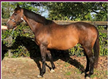
GROUP ONE PRODUCING ZABEEL MARE, IN FOAL TO CONTRIBUTOR.