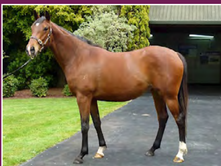
PEARL SERIES NOMINATED FILLY BY DARCI BRAHMA.