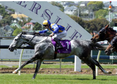
Saint Emilion (NZ) (Mastercraftsman)

Savacool was purchased by her trainer out of Waikato Stud's 2016 New Zealand Bloodstock Premier Yearling Sale draft for NZ$220,000.