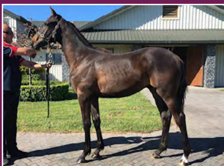
REDWOOD COLT OUT OF A DUAL WINNING PENTIRE MARE.

Bidding closes from 7pm Monday 12 November!