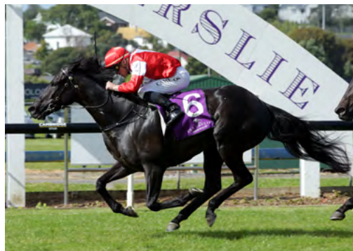
Mongolian Marshal (NZ) (High Chaparral)