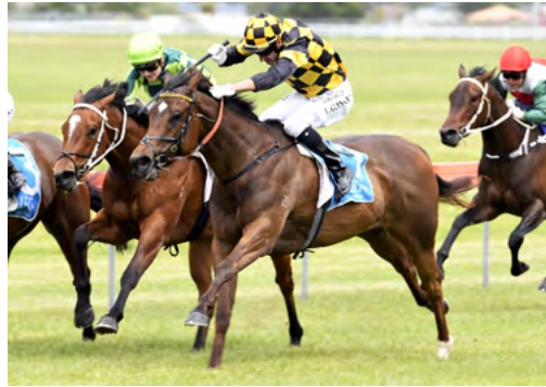
A Proper Lady (I Am Invincible)

"Today we were able to get her in behind