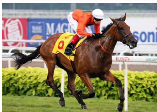
Bahana (NZ) (Elusive City)

"Flemington will suit her greatly, so we'll see what happens."