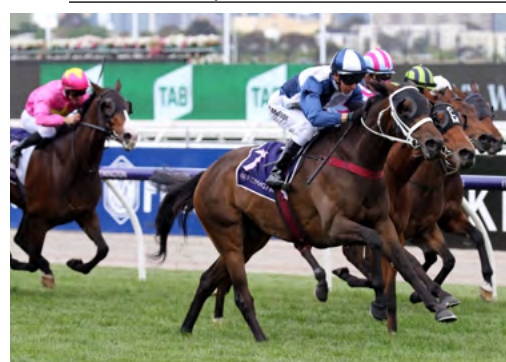
Savacool (NZ) (Savabeel)