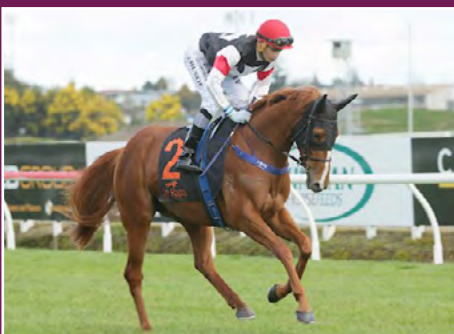
SON OF RELIABLE MAN OUT OF A STAKES PRODUCING MARE.