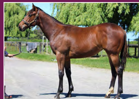
UNRESERVED SHAMEXPRESS FILLY.