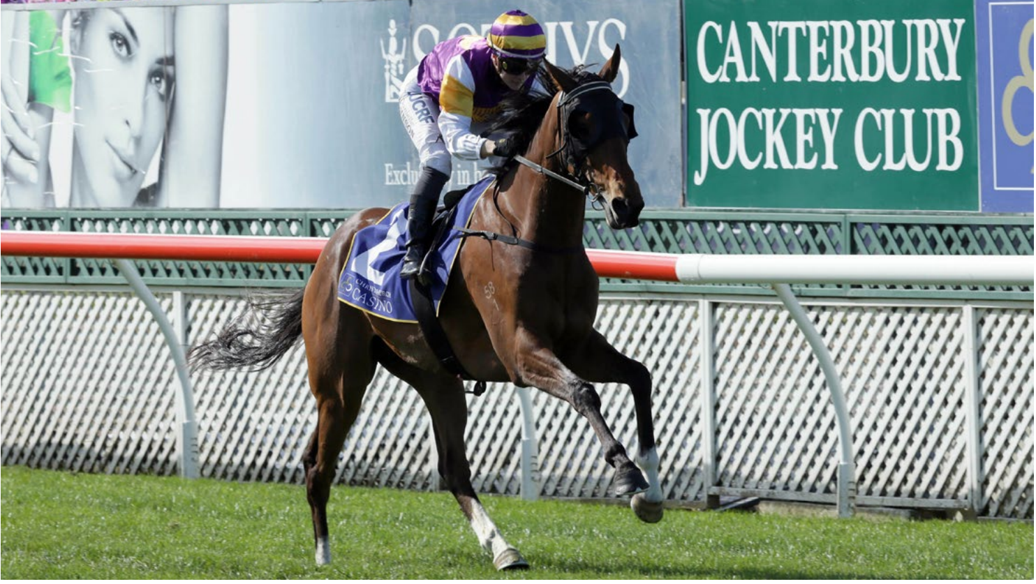
Nymph Monte runs away with the 2500 metre Metropolitan Handicap and into short-priced favouritism for next week's New Zealand Cup.

he odds about Nymph Monte (NZ) (Tavistock) completing a Riccarton hat-trick have tumbled after the stayer completed a Listed double on the track.