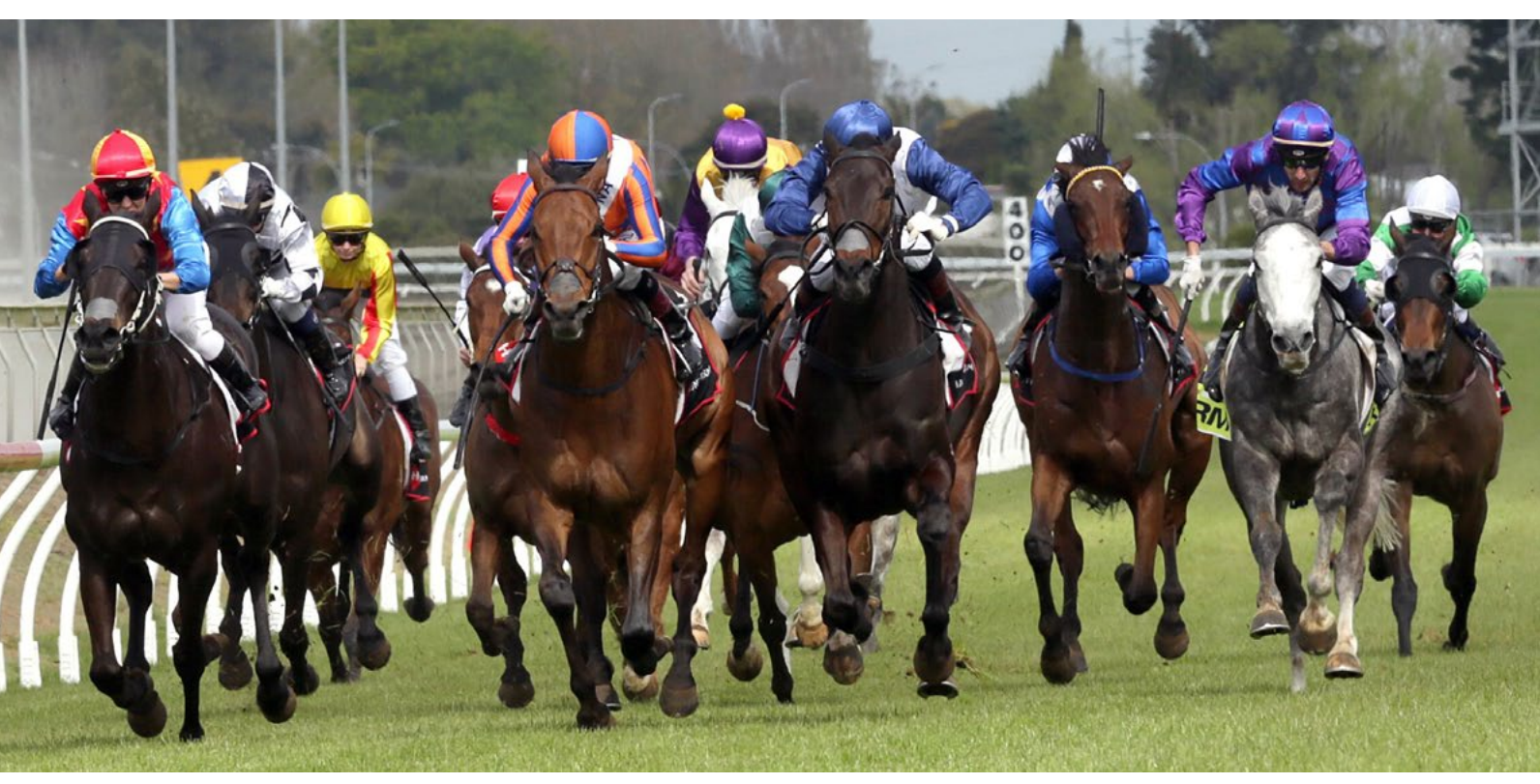
Blinkers will go on Chance To Dance (centre) for the first time in tomorrow's Gr. 3 OMF Stakes at Ellerslie

e Akau Racing are hoping the application of blinkers for the first time will work the oracle with former European stayer Chance To Dance (Teofilo) who takes his place in the Gr. 3 OMF Stakes at Ellerslie on Tuesday.