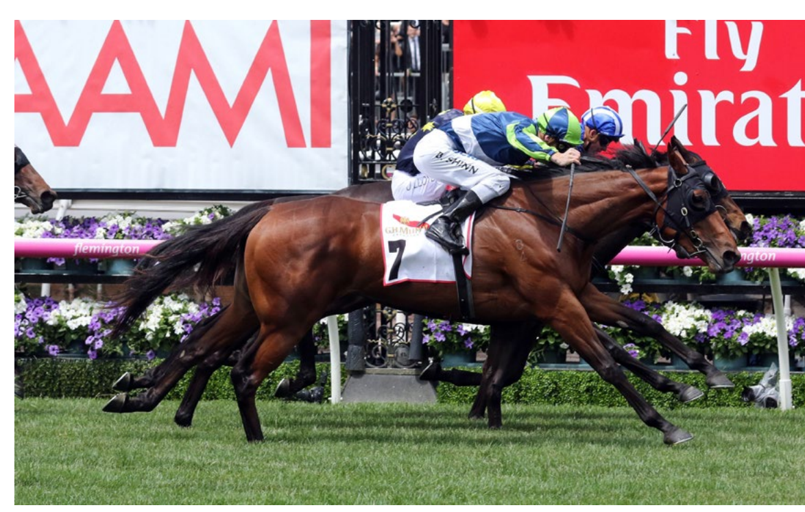
As the best stayers do, Luvaluva stretches her neck nearing the winning post to touch off Glam Guru and Rimraam in the Wakeful Stakes.

Well supported as a $5 second favourite, Luvaluva saved ground on the inside before bursting through and got home in the final strides to beat outsider Glam Guru (Medaglia d'Oro) by a head with a nose to $8 third favourite Rimraam (NZ) (Commands) third.