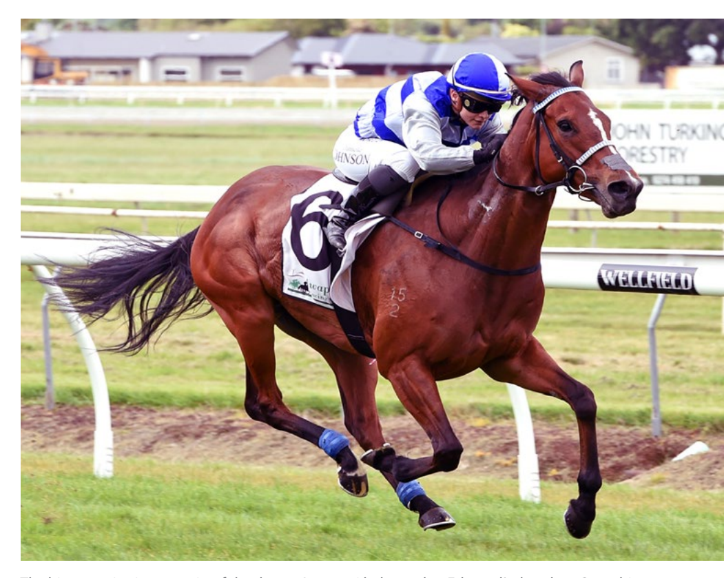
The biggest winning margin of the day at Awapuni belonged to Ethereal's daughter Seraphim, seen here scooting away from her Rating 65 rivals by a widening 3½ lengths.

When she asked for a serious effort, it was immediately forthcoming and Seraphim strode to the front 200 metres from home and powered away to win by three-and-a-half lengths.