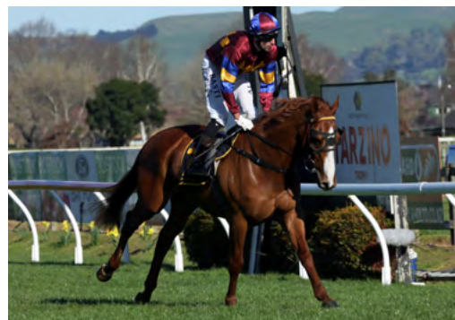
Pentathlon (NZ) (Pentire)

"She's certainly a filly on the way up and one you can follow."