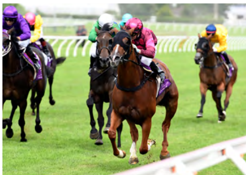
Major Tom (NZ) (Red Giant)

"He ran really well at Matamata last start. He will run on Melbourne Cup Day at Ellerslie in the Rating 82 2200m, and if he performs well we will go down to Christchurch and have a crack."