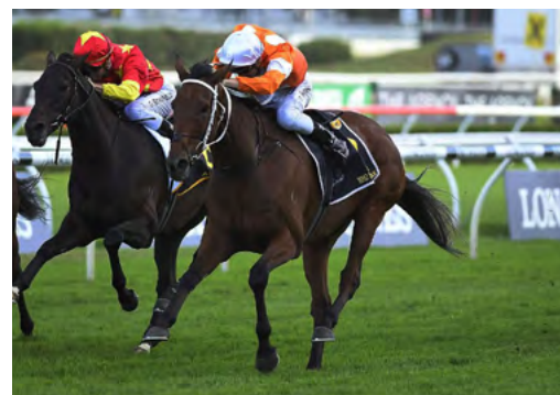
Who Shot Thebarman (NZ) (Yamanin Vital)

"James McDonald is aboard and barrier 10 should suit her normal racing style."