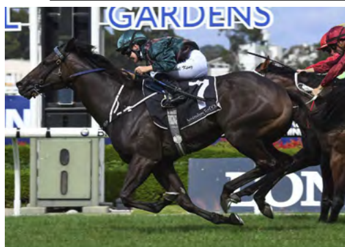
Lanciato (NZ) (Per Incanto)