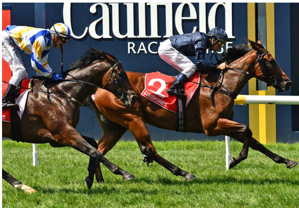
Long Leaf will have a fresh edge on his side when he lines up in the Gr.1 Coolmore Stud Stakes at Flemington

Long Leaf was purchased by BBA Ireland out of Curraghmore's 2017 New Zealand Bloodstock Premier yearling draft for $750,000.