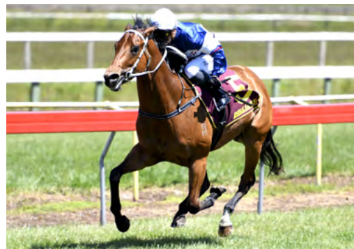
Eridani (NZ) (Makfi)

That last-start effort resulted in the three-year-old filly jumping away as a $2.70 favourite and she won accordingly