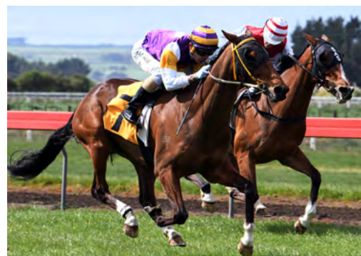
Nymph Monte (NZ) (Tavistock)

Patrick Erin has drawn barrier 8 in a field of 13 for Saturday's contest.