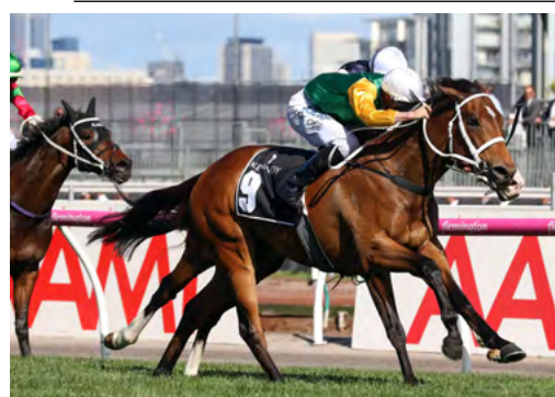
Shillelagh (NZ) (Savabeel)

"We would be galloping her over 2000m on Saturday morning in preparation for the Oaks anyway, so she can run and then go back to Warrnambool and have a quiet week."