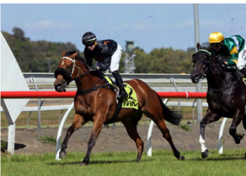
Consensus (NZ) (Postponed)