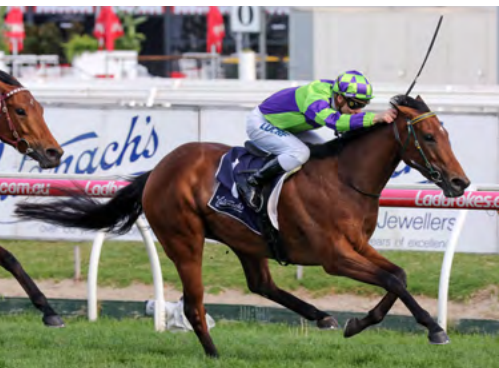
I Am A Star (NZ) (I Am Invincible)