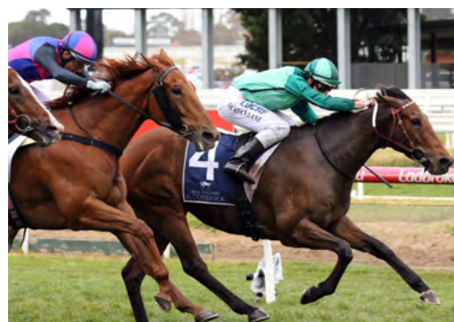
Humidor (NZ) (Teofilo)

Three-time Group One winner Humidor (NZ) (Teofilo) will take no further part in the Melbourne spring carnival after pulling up