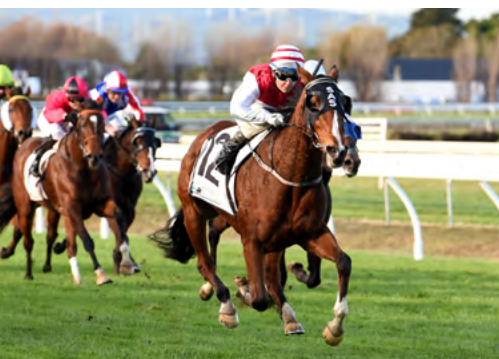
Ladies First (NZ) (Dylan Thomas)

"Whilst he might not have figured in the finish on Golden Rose day, he is certainly better than that run and I expect him to prove himself on Saturday and be hard to beat."