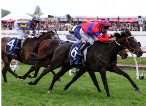
Verry Elleegant (NZ) (Zed)

Standout three-year-old filly Verry Elleegant (NZ) (Zed) will head to Flemington on Saturday to contest the Gr.2