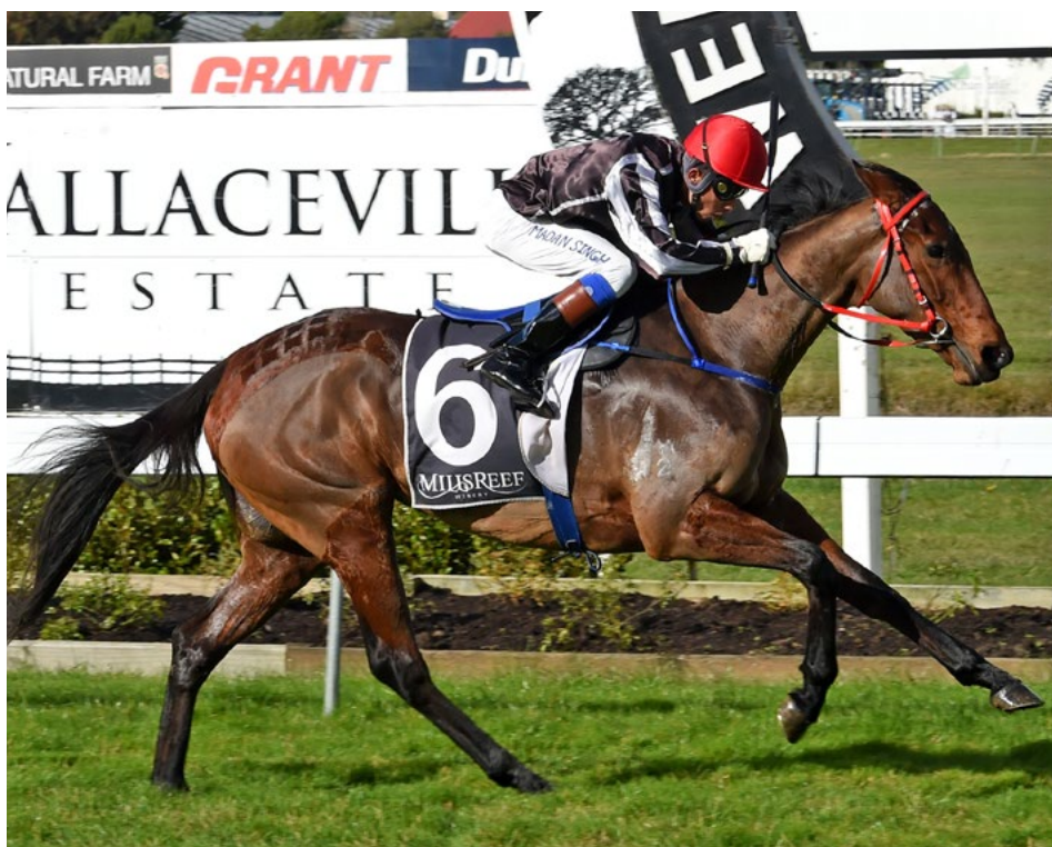
Strolling Vagabond is well clear as she skips to victory on the weekend