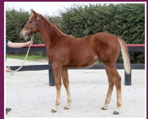
WEANLING COLT BY PROISIR. OUT OF LISTED WINNER FLORIDITA.

NEXT AUCTION DATES • Accepting listings from Tuesday 30 May • Listings close 7pm Monday 5 June • Catalogue published online 5pm Tuesday 6 June • Bidding from 5pm Tuesday 6 June to close of auction on Monday 12 June • Lots close in sequential order from 7pm on Monday 12 June.