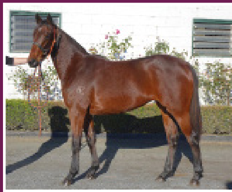
QUALITY YEARLING FILLY BY TAVISTOCK. BROKEN IN.