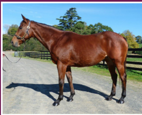
YOUNG SHINKO KING MARE IN FOAL TO HE'S REMARKABLE.

Featuring 47 Lots with 28 Lots offered unreserved.