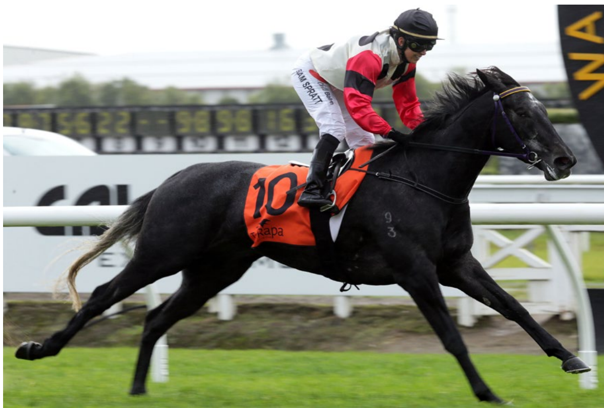
Blue Shadow proves Sam Spratt's assessment spot on with an easy win in the opening event at Te Rapa.