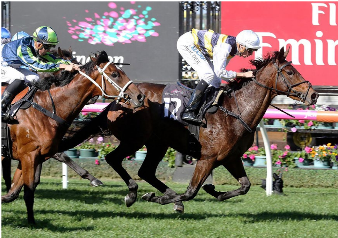
Aloisia runs out a strong 1400 metres to beat the juveniles at Flemington in her Australian debut.