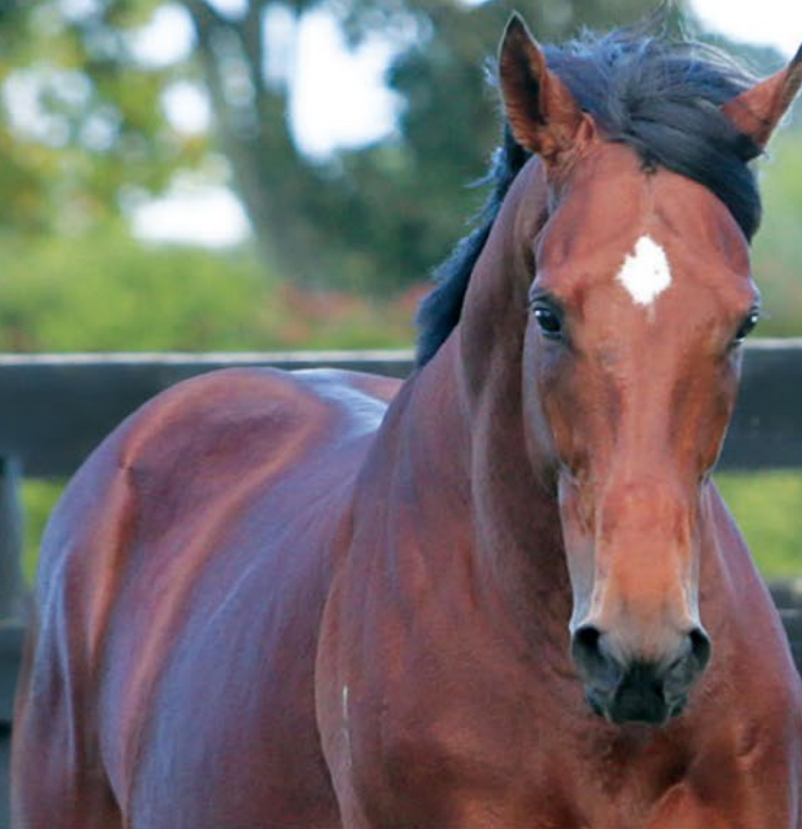
Triple Gr.1 winner Turn Me Loose at Windsor Park