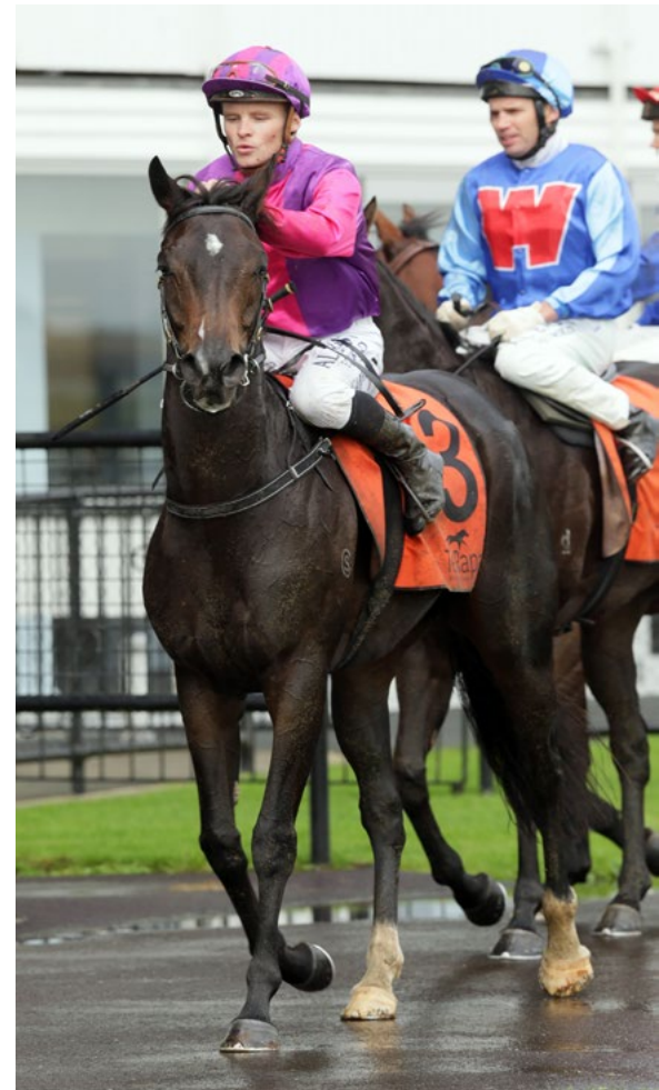
Promising filly Power O'Hata returns to the Te Rapa birdcage after a gritty win