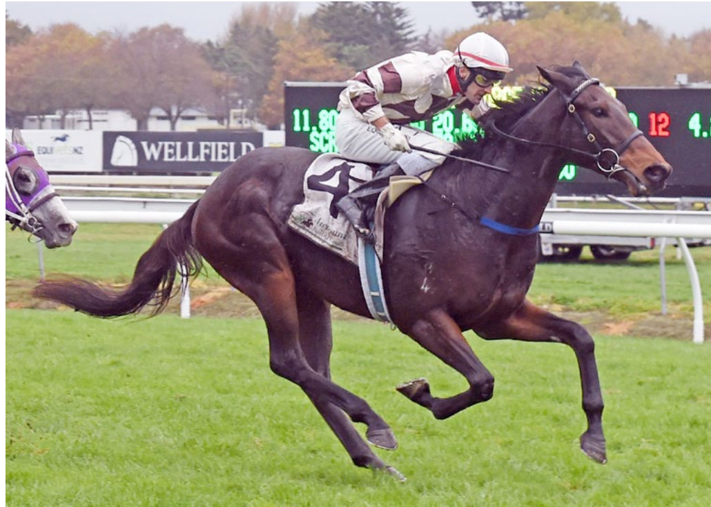
Detentore makes it three wins on end at Awapuni

going nature around his stable that belies his raceday ability.