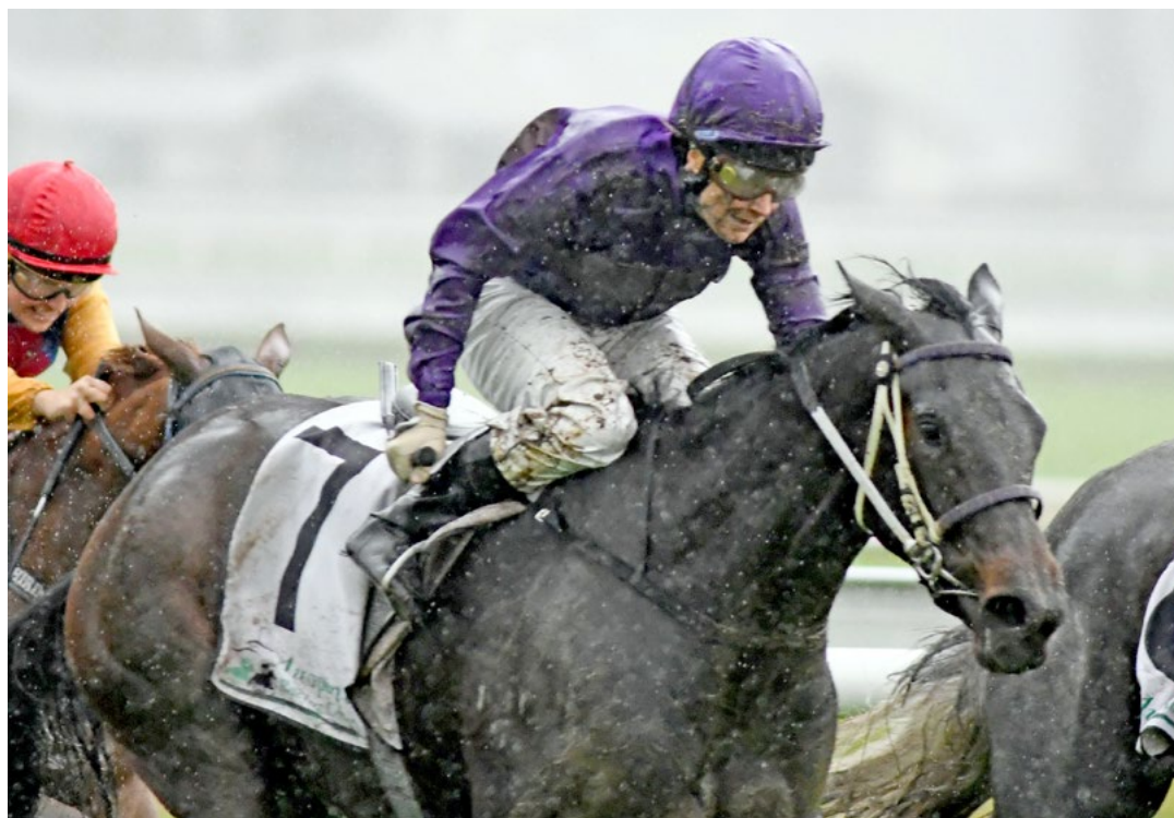
The rain and mud was flying as Platinum Rapper broke maiden status at Awapuni