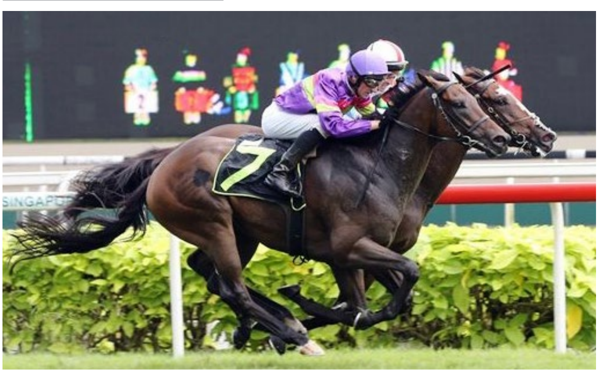
Ground Control (outer) snatches a narrow victory at Kranji

"But then he clipped heels when I popped him out, and I think he felt sore around the joint. He still won well and will win more races here."