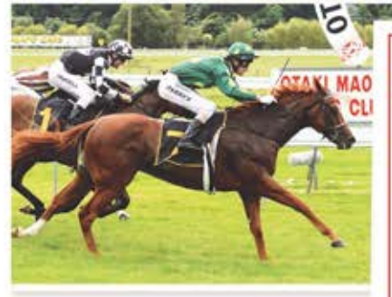
DIVINE POWER Wins Otaki Gardiner Homes 2YO

(One of Five individual Stakes winners from Powers first crop 2 year olds) in New Zealand and Europe