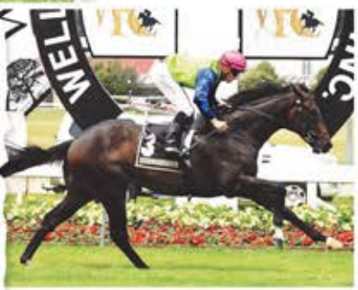
PADRAIG Wins WRC Provedoring 2YO H

NZ BLOODSTOCK SALE RESULTS PREMIER SOLD UP TO $380,000 PREMIER AVERAGE $171,878 TOP 5 SALES, $380,000, $250,000, $250,000, $250,000, $230,000 -ALL ON A STUD FEE OF $9,000