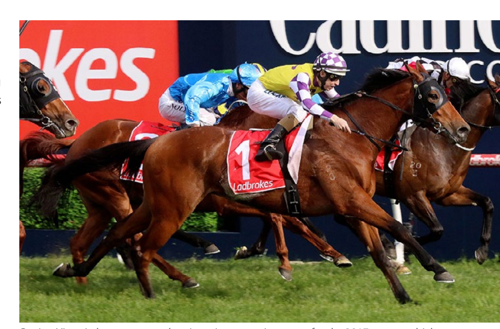
Racing Victoria has announced major prizemoney increases for the 2017 season which are sure to attract New Zealand runners across the Tasman to grab their share of the riches