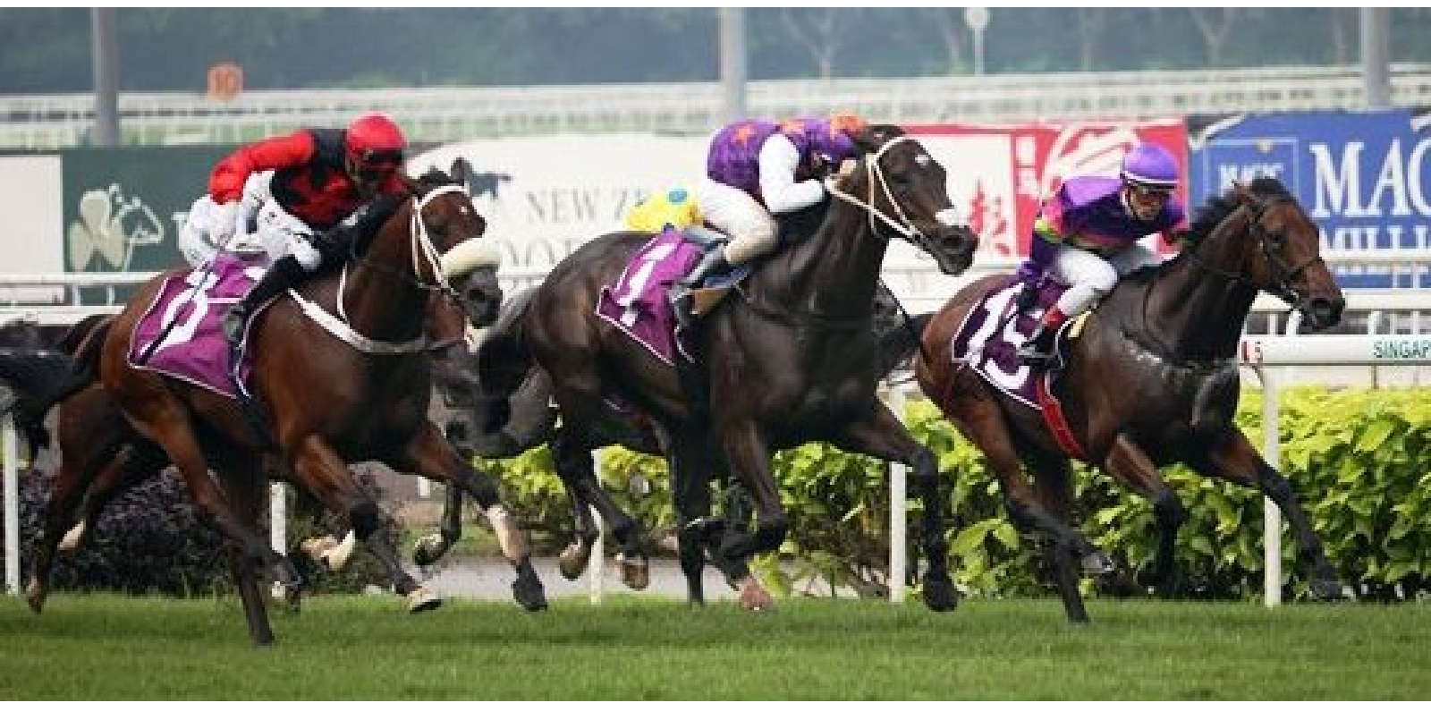
War Affair (middle) and Storm Troops (outer) hit the line locked together.

ith its bumper field of 15 runners, Sunday's Saas Fee Stakes was billed as a nice prelude to the Singapore Guineas, but what a thriller it turned out to be with champion War Affair (NZ) (O'Reilly) sharing the spoils with Storm Troops (Orpen) in a pulsating three-way go.